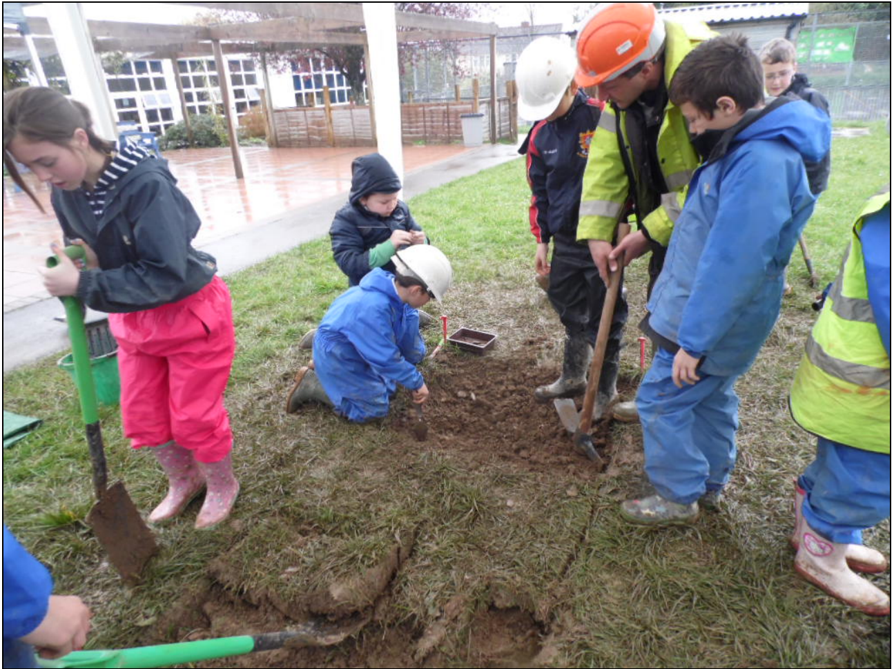
Stripping the turf; from the west.