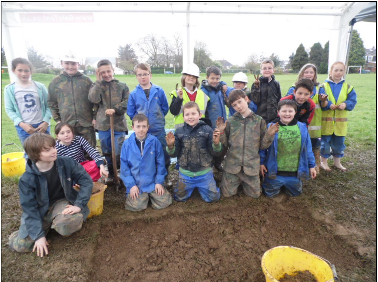
Some of the children involved in the excavation; from the south.