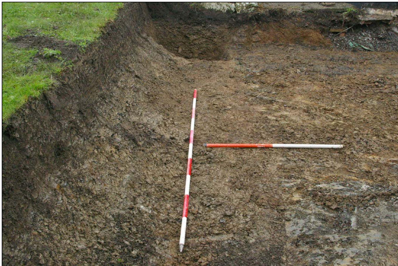
Figure 3: Post excavation view of site showing ditch [110]; looking south (1m and 2m scales).