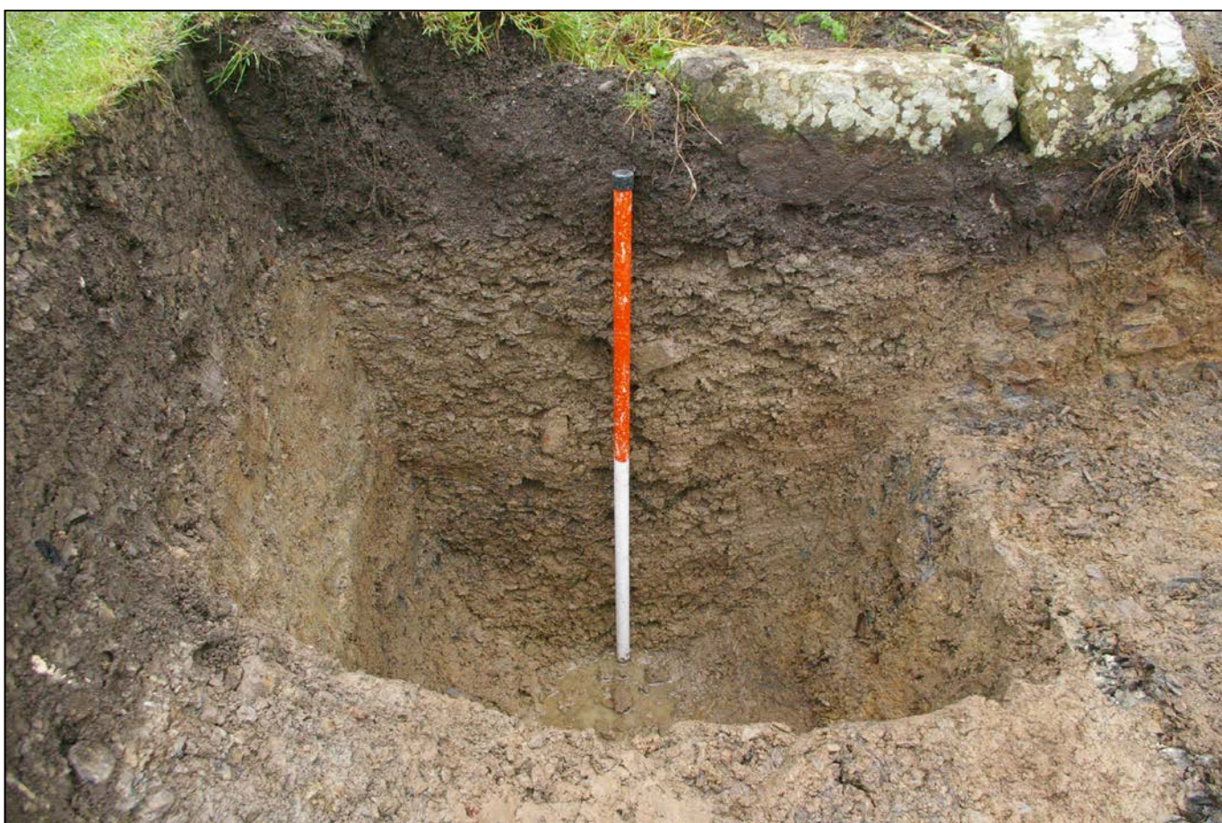
Figure 4: North-facing section of ditch [110]; looking south (1m scale).