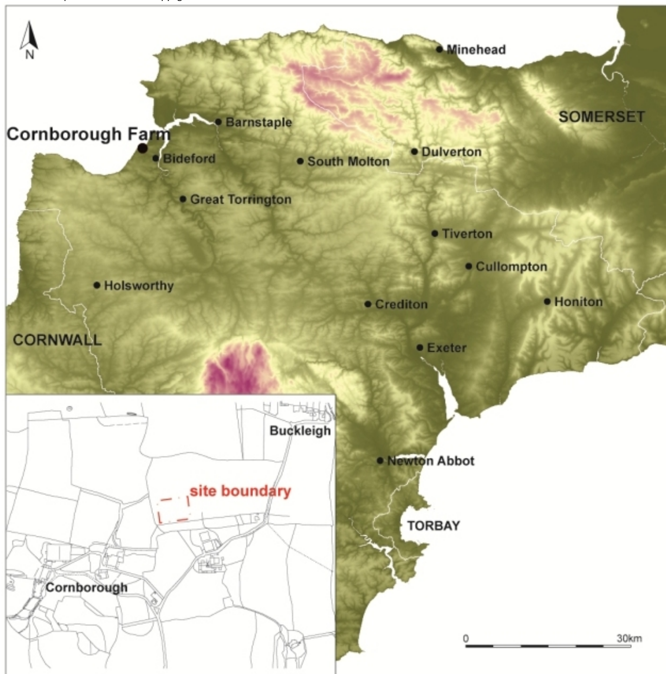
Figure 1: Site location map; site location in red.

Any plans or photographs embedded within or attached to this form remain the copyright © of the recorder, and must not be reproduced in any publication without the explicit consent of the copyright holder.