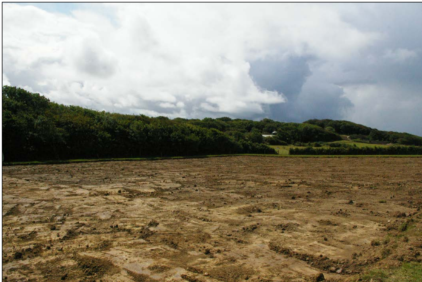
Figure 3: Post excavation view of site; looking south-west (1m and 2m scales)