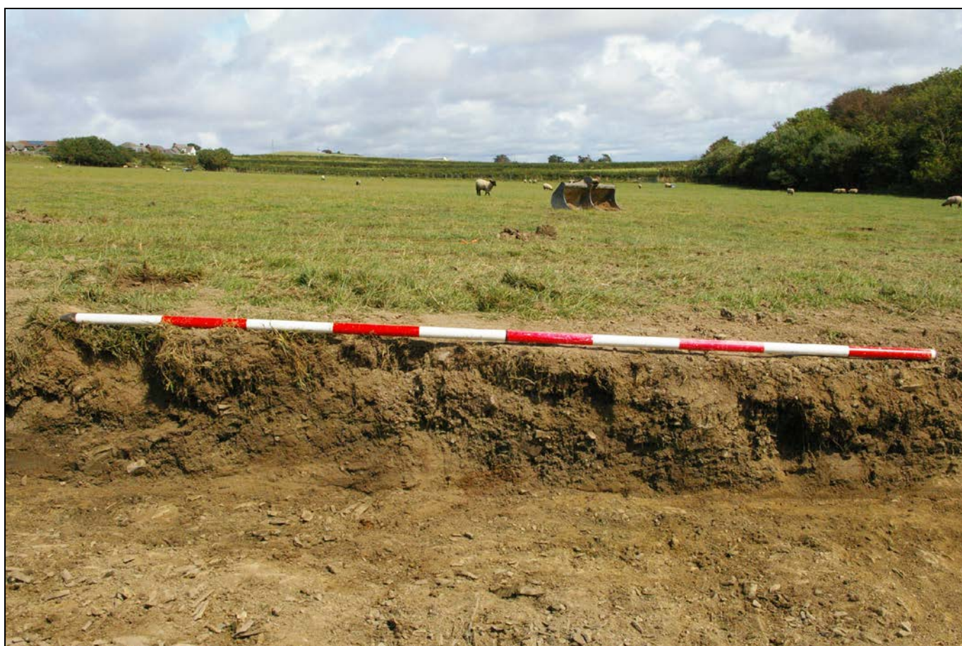
Figure 4: Representative west facing section; looking east (2m scale).