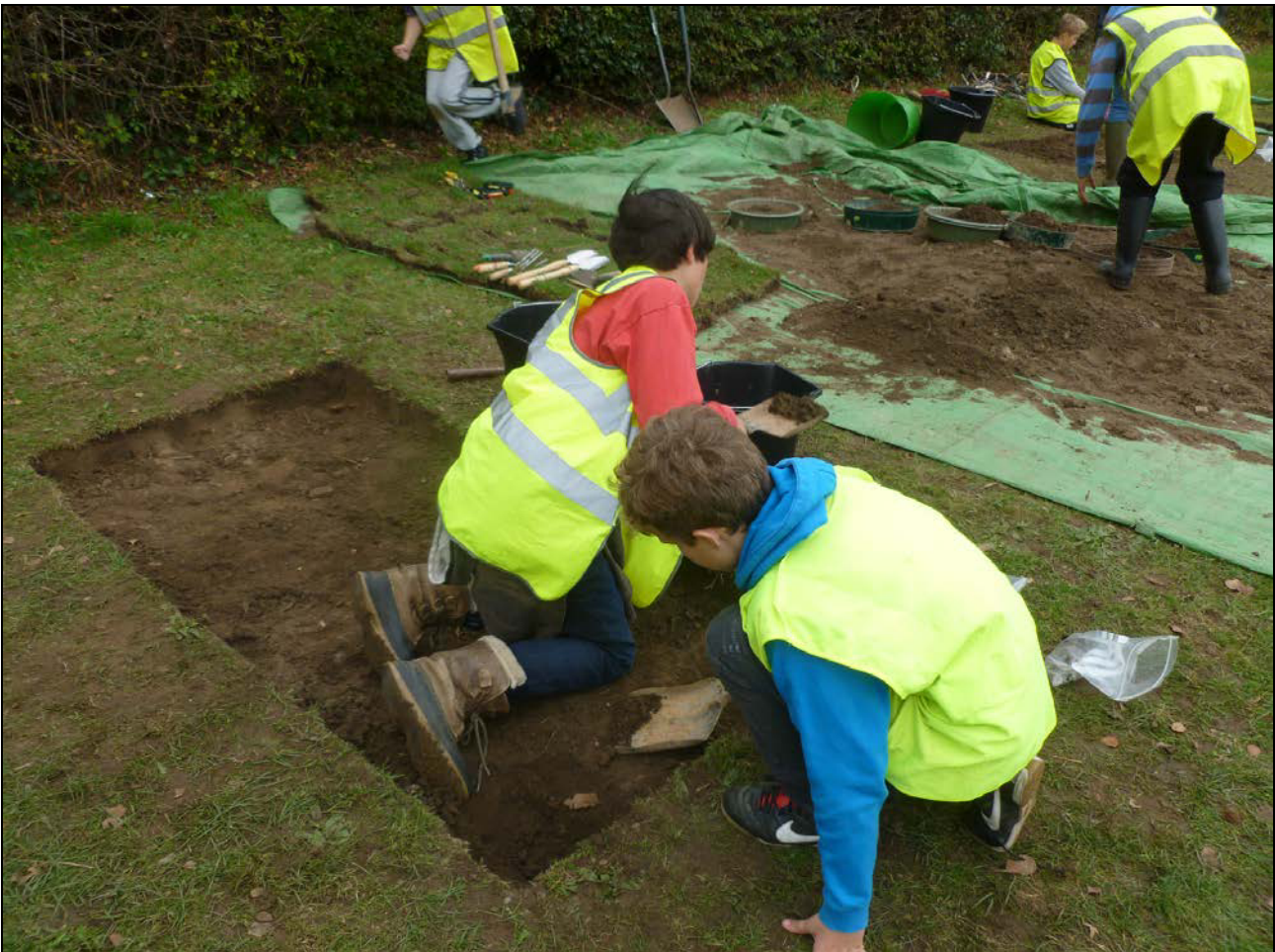
Some of the children involved in the excavation; from the south.