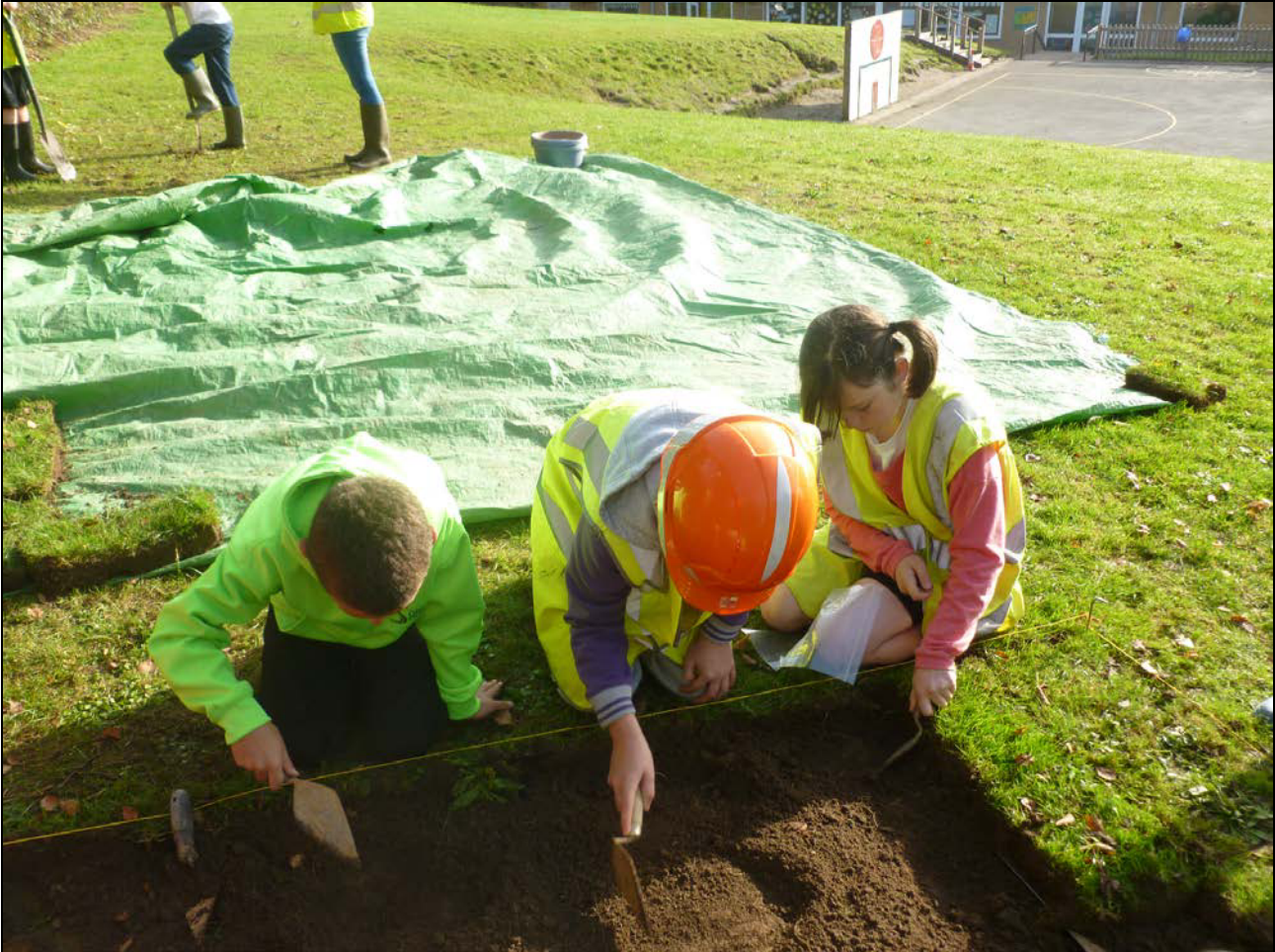
Excavation begins in Trench #1, with turf stripping for Trench #2 in the background; from the west.