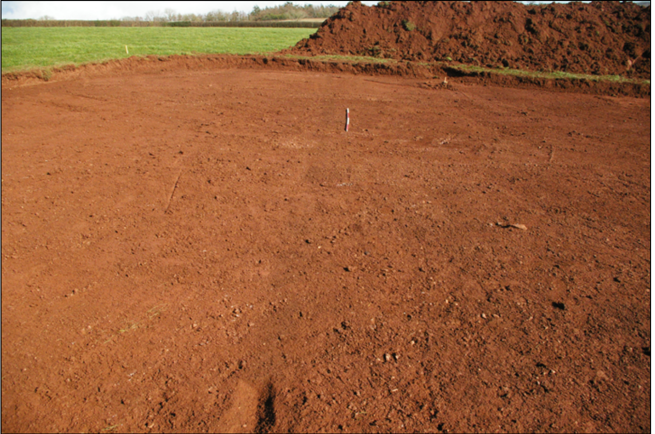
Figure 5: Gully [102], viewed from the west (2m scale).