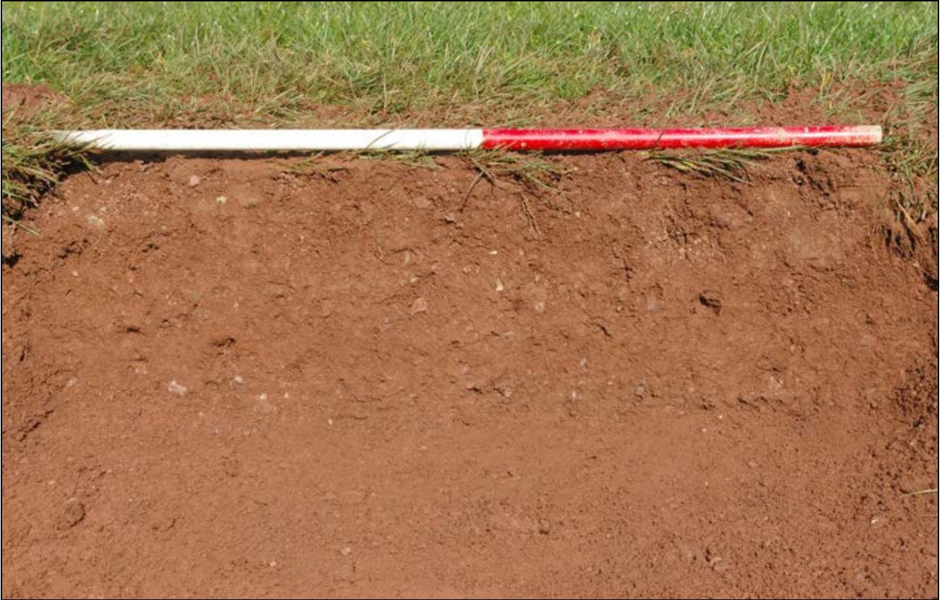
Figure 3: Sample section, viewed from the south (1m scale).