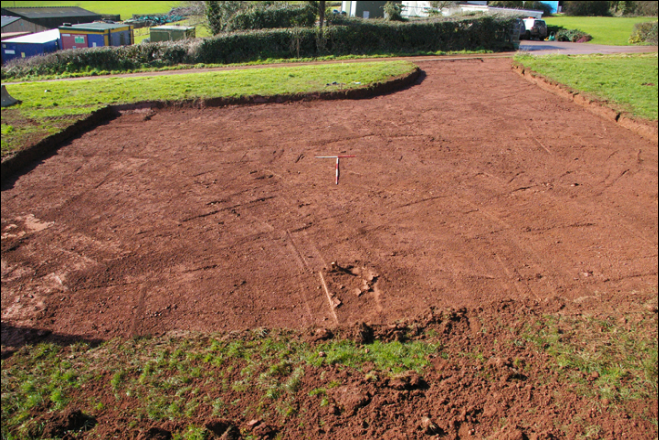
Figure 4: Post-excavation site shot, viewed from the east (1m & 2m scale).