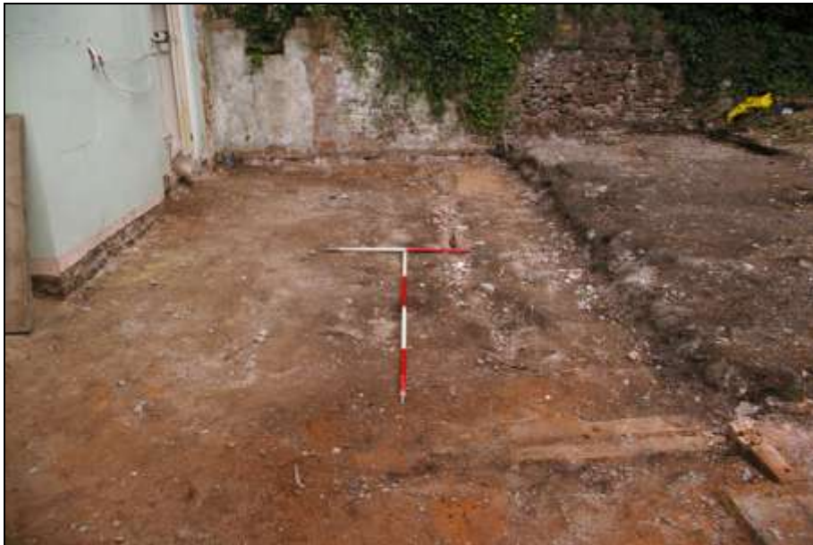
Figure 6: Site shot; viewed from the south (1 & 2m scale).