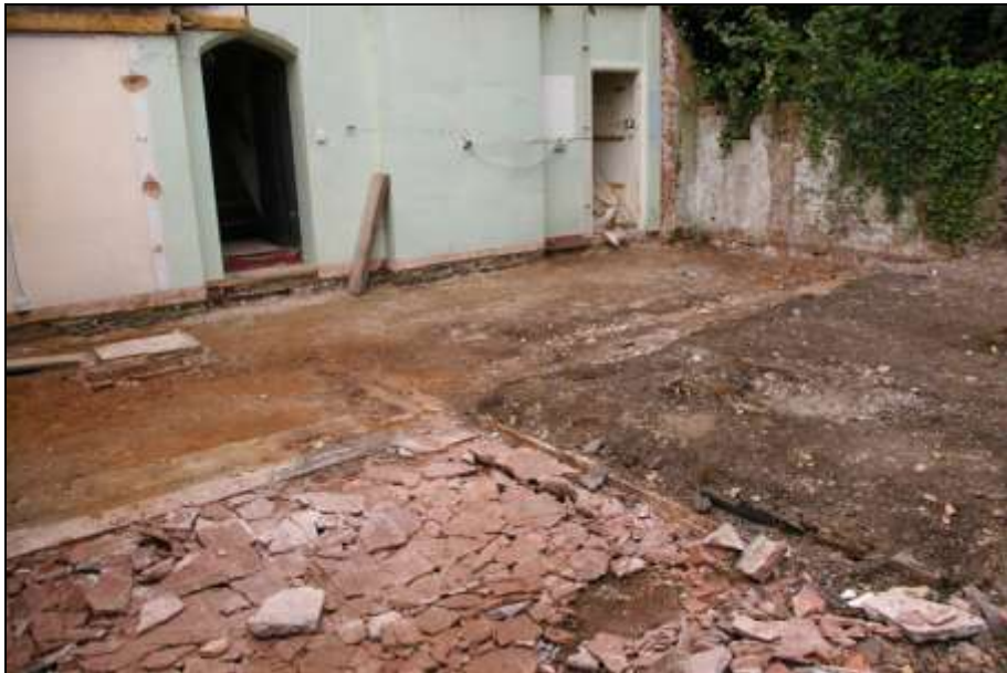
Figure 4: Site shot; viewed from the south-east (no scale).