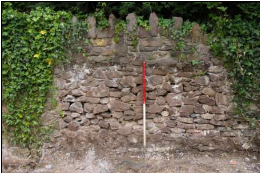
Figure 7: Exposed section of wall behind removed coal store (1m scale).