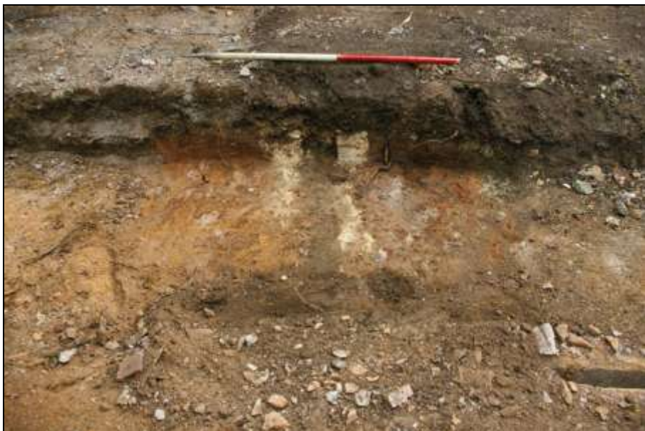
Figure 8: Foundation Trench [105] pre-excitation; viewed from the west (1m scale).