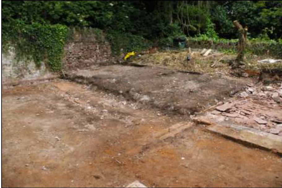
Figure 3: Site shot; viewed from the south-west (no scale).