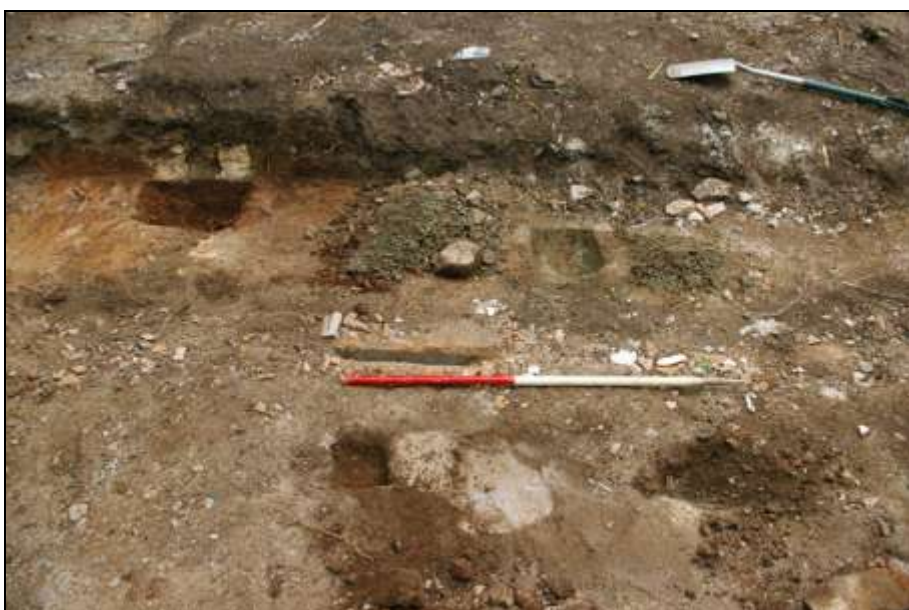
Figure 11: Working shot of stone slabs and Foundation Trench [105], viewed from the west (1m scale).