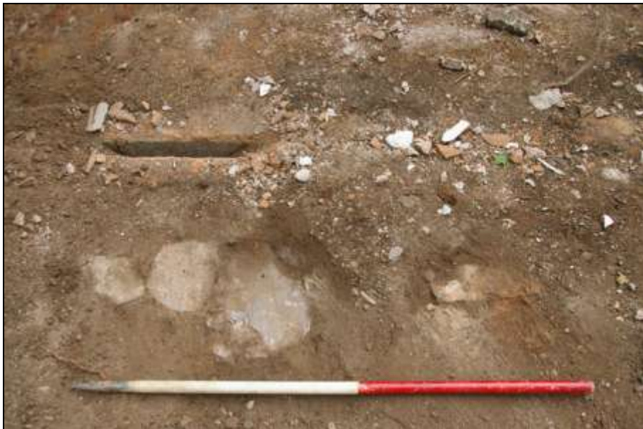
Figure 10: Stone slabs within spread of demolition/made-ground, showing modern footing of demolished extension; viewed from the west (1m scale).