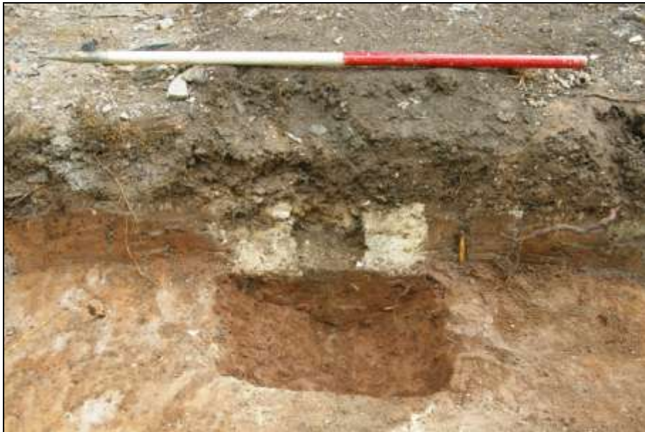
Figure 9: Foundation Trench [105], with sondage; viewed from the west (1m scale).