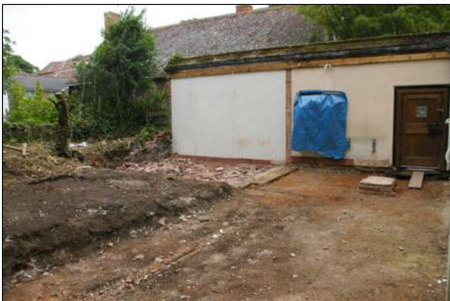
Figure 5: Site shot; viewed from the north-west (no scale).