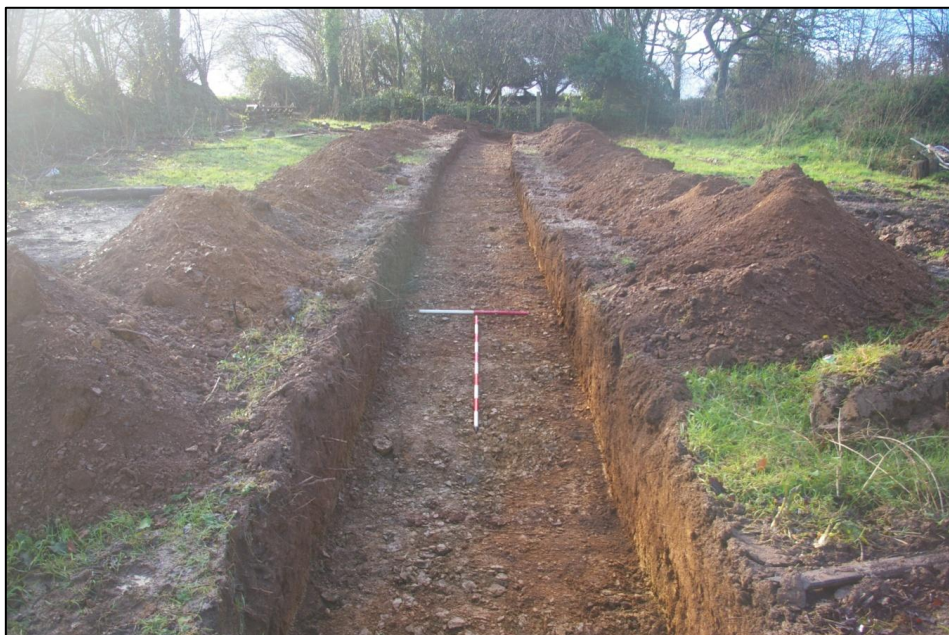
Figure 5: Post-excavation view of trench 1; viewed from the north-east (1m and 2m scales).