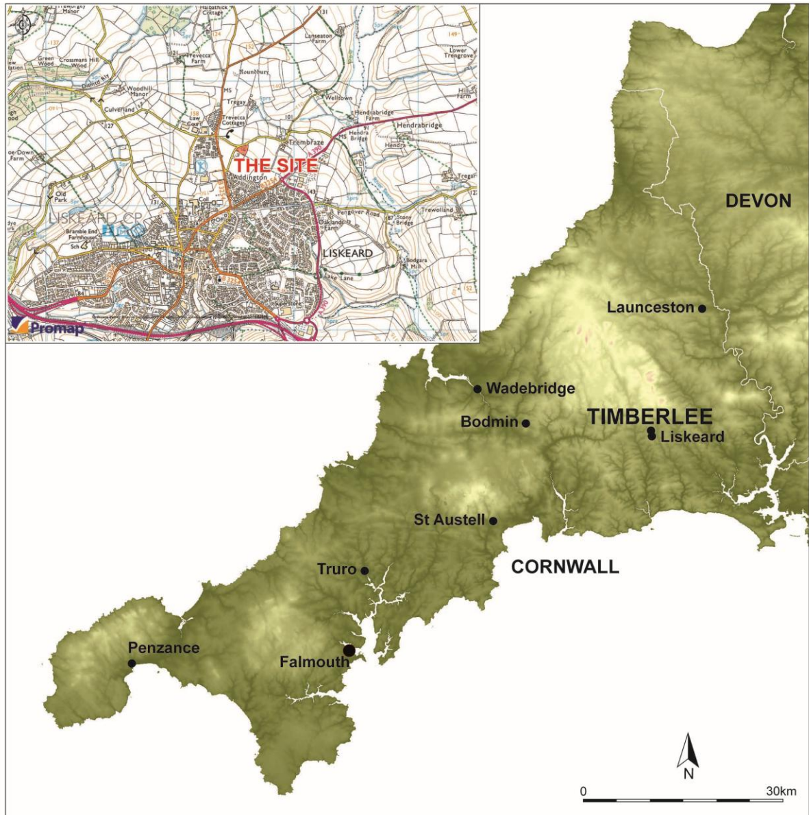
Figure 1: Site location (the site is indicated in red).