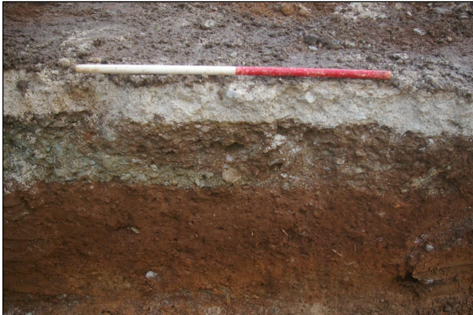
Figure 4: Surface (411), probable continuation of Surface (303), south-west facing section, viewed from the south-west (1m scale).