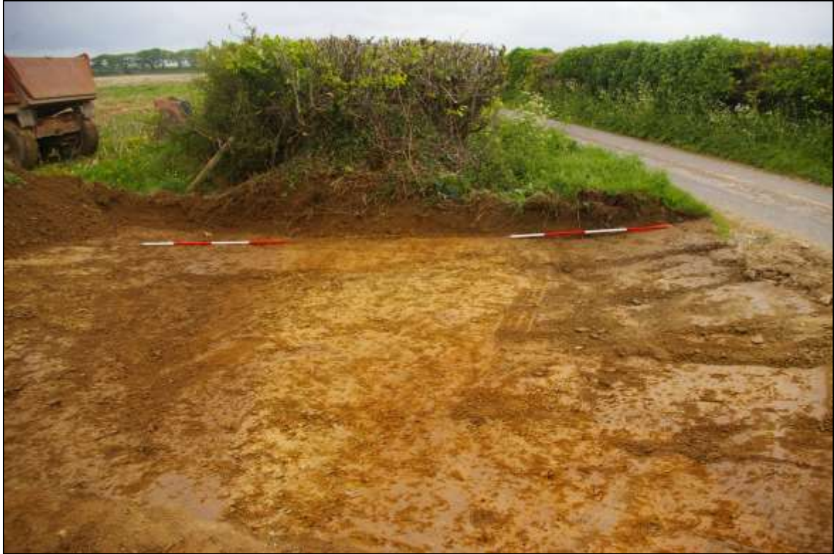
Figure 2: Hedgebank {110} with flanking ditches [102] and [104]; viewed from the south (scales 2m).