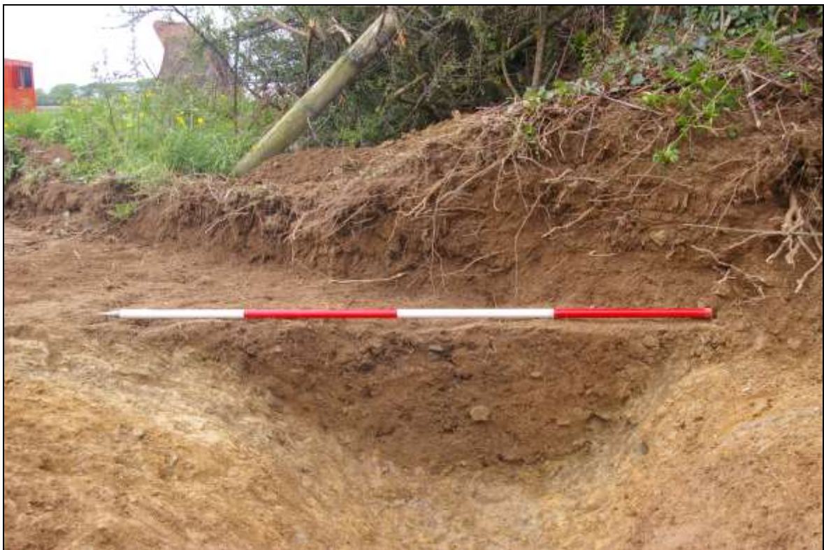
Figure 3: West-south-west facing section of ditch [104]; viewed from the south (scale 2m).