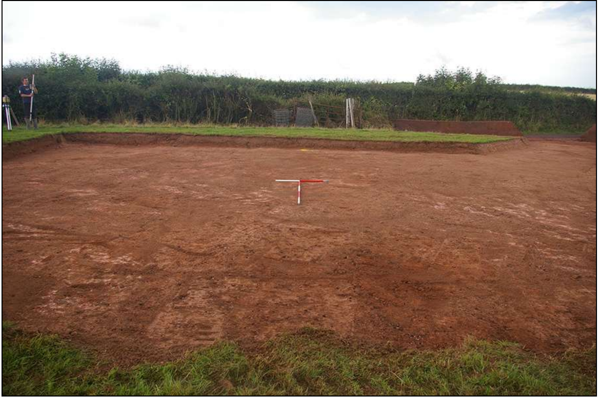
Figure 2: Site shot post-excavation; viewed from the south (1m & 2m scale).