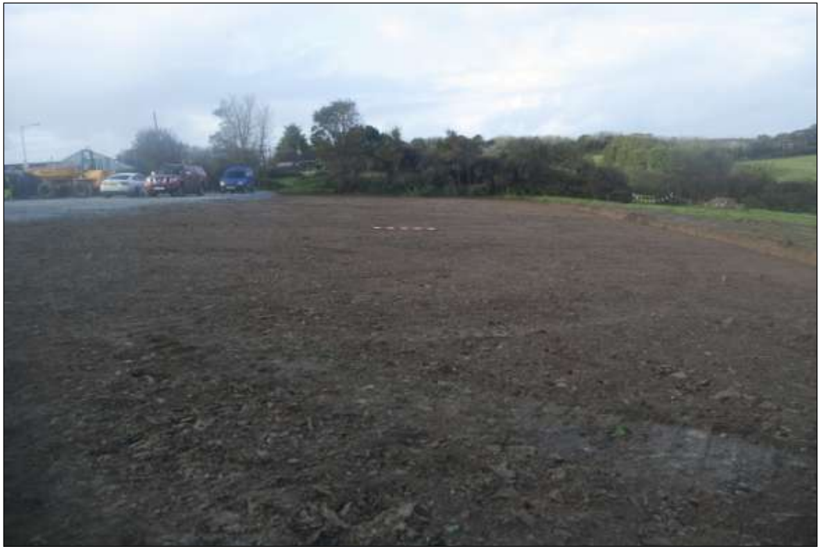
Figure 2: Area 1, post-excitation; viewed from the south (2m scale).