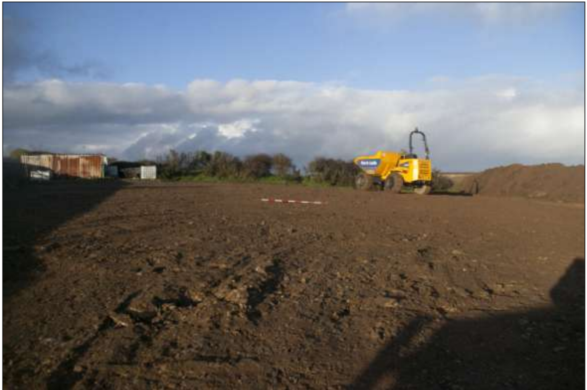
Figure 3: Area 2, post-excitation; viewed from the south (2m scale).