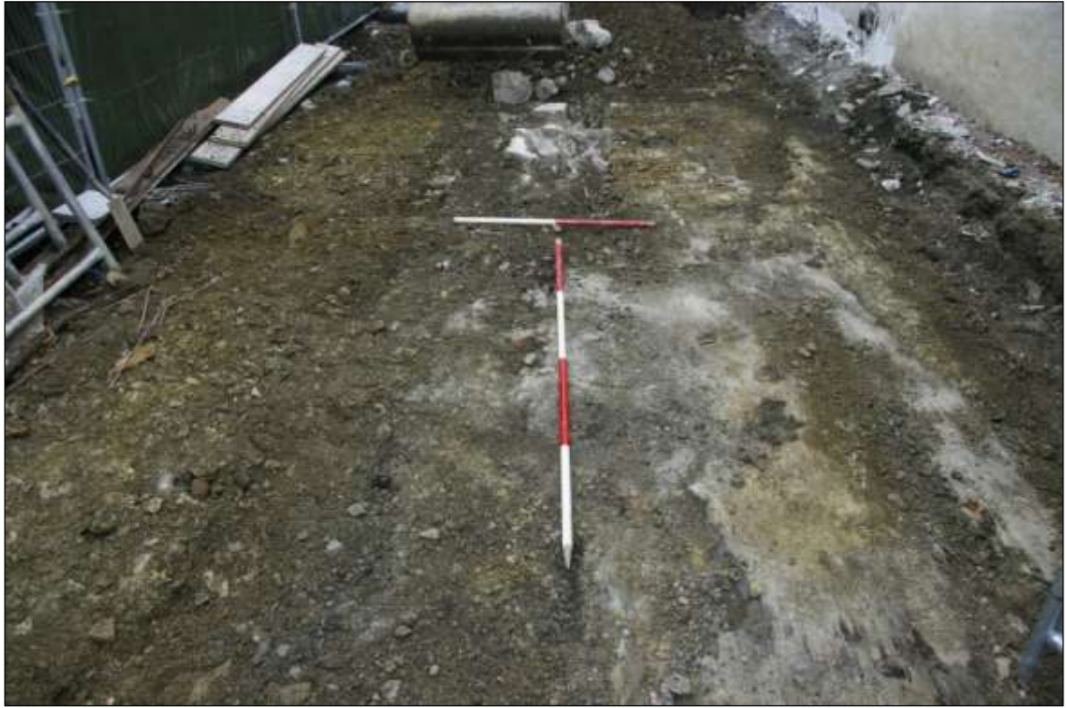
Figure 2: The site, post initial strip; viewed from the south (1m & 2m scales).