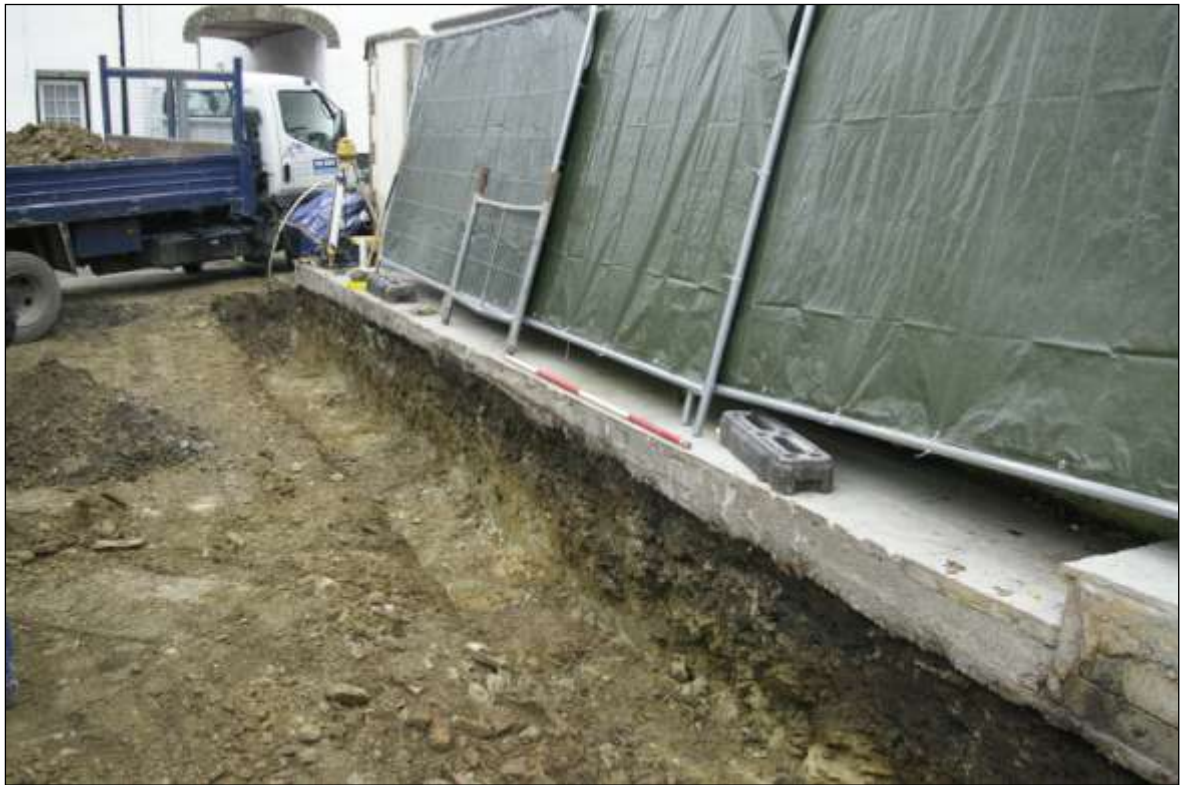
Figure 3: West facing section of west foundation trench, oblique; viewed from the north-east (2m scale).