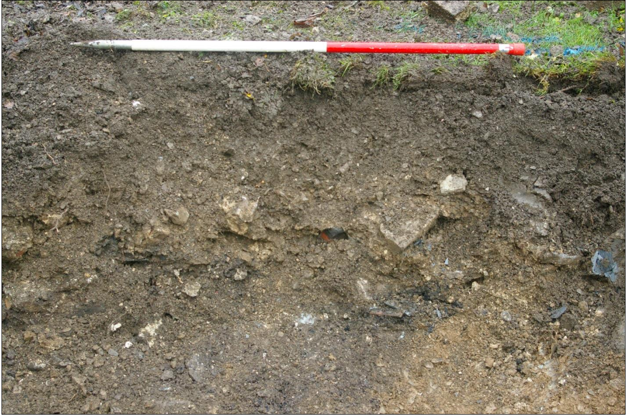
FIGURE 2: SAMPLE SECTION; FROM THE NORTH (1M SCALE).