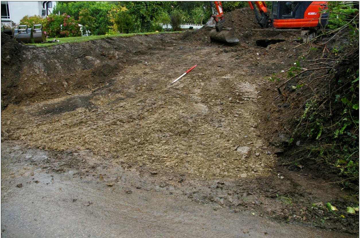
FIGURE 3: AREA STRIP FOR DRIVEWAY; FROM THE NORTH-EAST (1M SCALE).