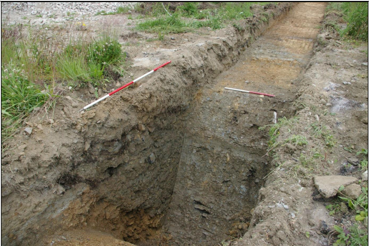
Figure 3: Post-excavation view of [308]; viewed from the south-east (1m and 2m scales).