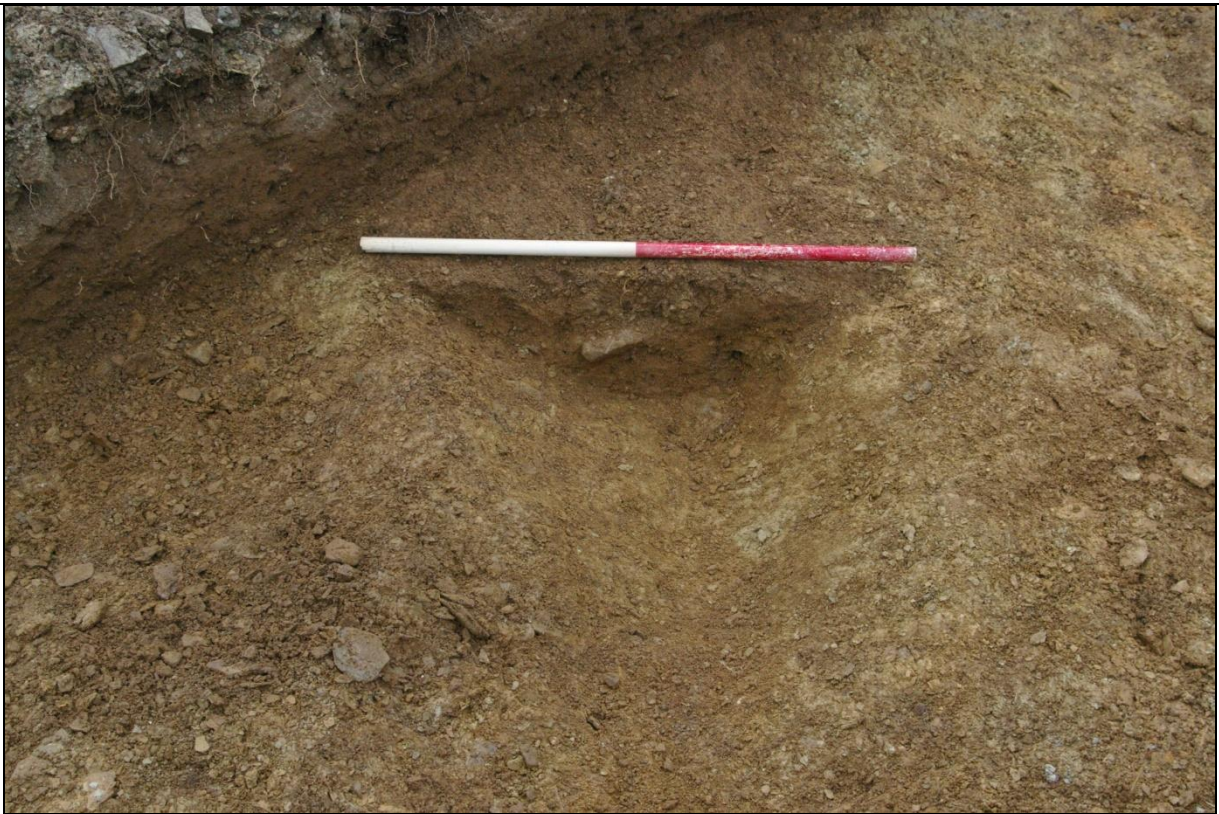
Figure 2: Post-excavation view of [206]; viewed from the west (1m scale).