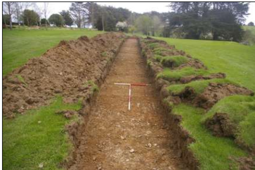
FIGURE 5: TRENCH 3 POST-EXCITATION; VIEWED FROM THE NORTH-WEST (1M & 2M SCALE).