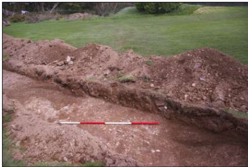
FIGURE 4: DITCHES [204] AND [206]; VIEWED FROM THE SOUTH (2M SCALE).