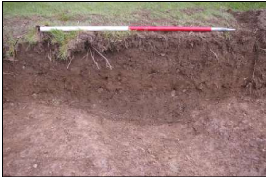
FIGURE 3: DITCH [103]; VIEWED FROM THE NORTH (1M SCALE).