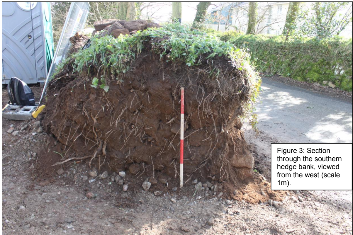
Figure 3: Section through the southern hedge bank, viewed from the west (scale 1m).