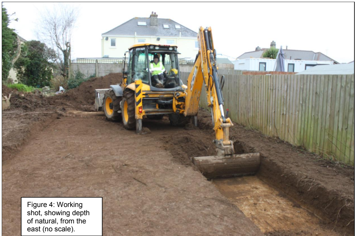
Figure 4: Working shot, showing depth of natural, from the east (no scale).