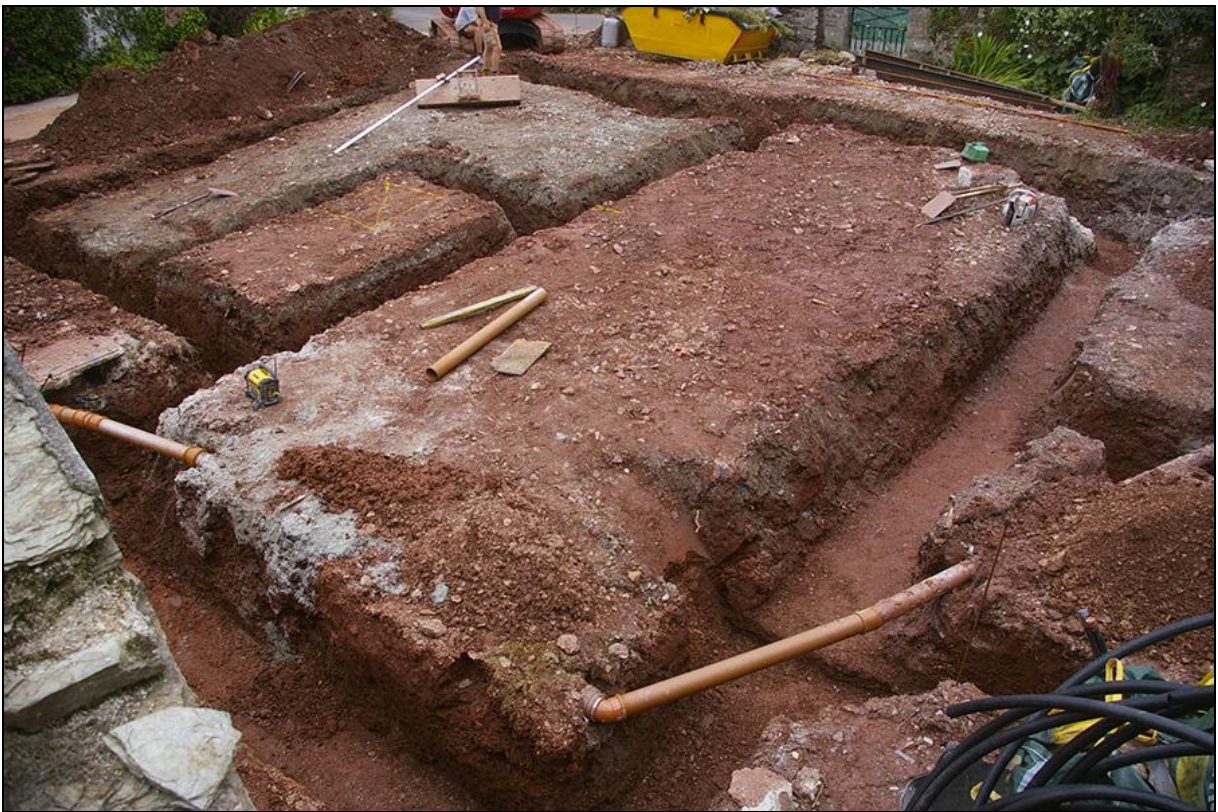
FIGURE 3: SITE SHOT, POST-EXCAVATION SHOWING MODERN PIPE WORK; VIEWED FROM THE WEST (NO SCALE).