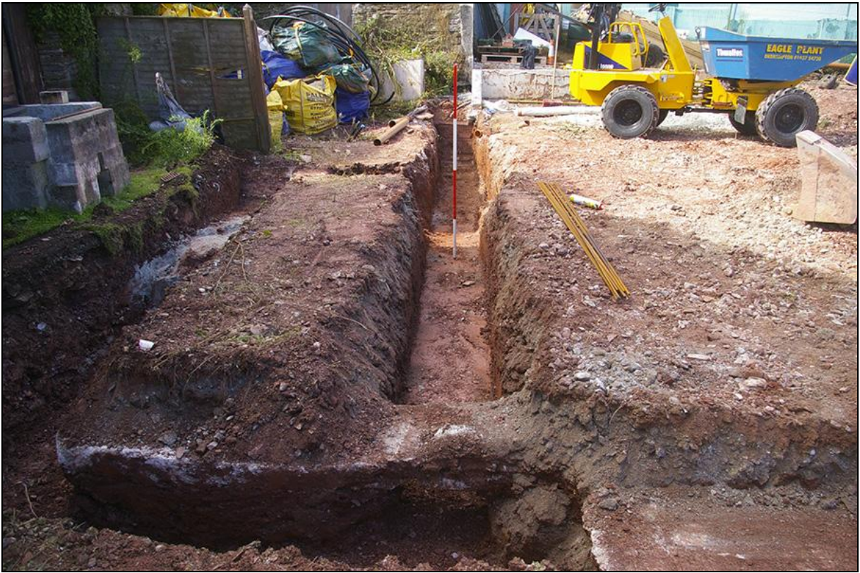
FIGURE 2: MID-EXCAVATION SHOT SHOWING CONCRETE FOOTINGS OF DEMOLISHED BUNGALOW IN THE SOUTH CORNER OF THE SITE; VIEWED FROM THE SOUTH-EAST (2M SCALE).