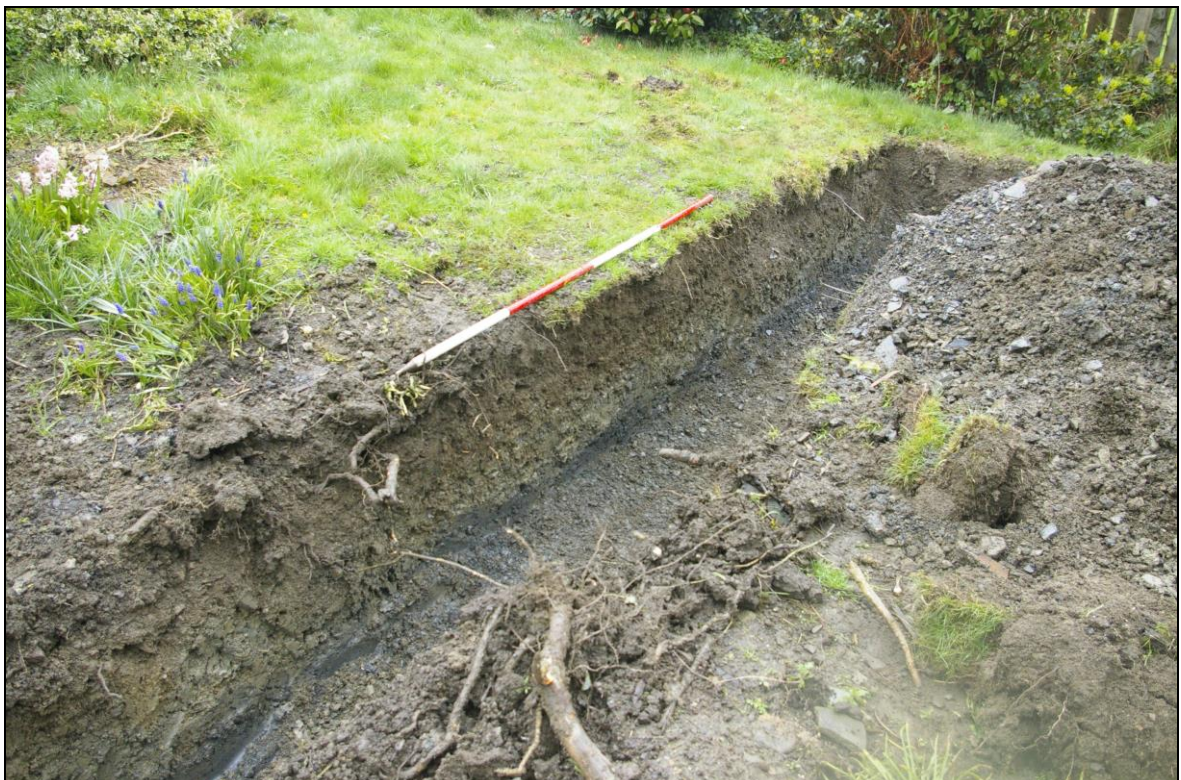
Figure 3: South-east facing section of Area #1; viewed from the south (2m scale).