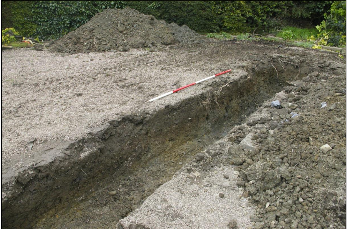
Figure 2: North-east facing section of Area #2; viewed from the east (2m scale).