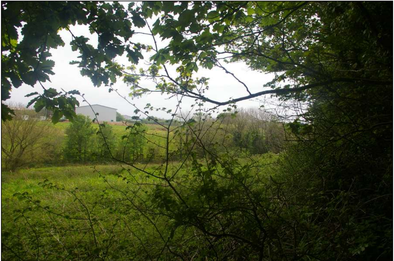
View across the valley to the large modern industrial estate that is being developed to the south and south-west of the site; viewed from the north.