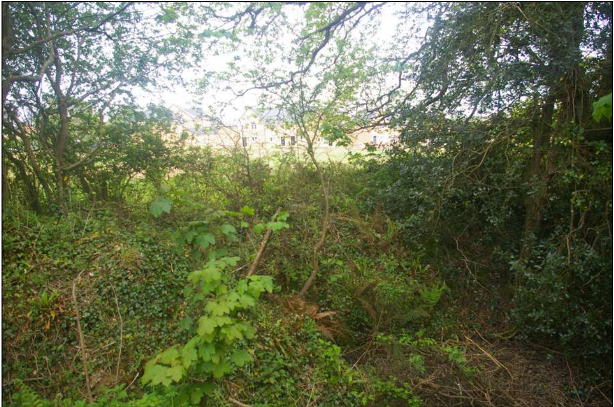
View from the north-east corner of the monument, showing intervisibility with the adjacent houses of the new development; viewed from the west.