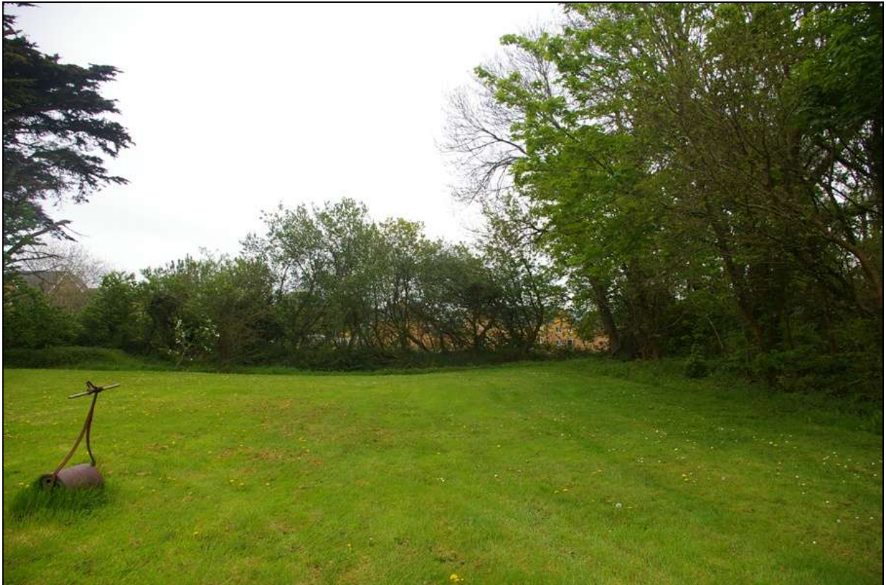
View from the site showing clear intervisibility with the new houses of the development to the east, through the hedgebank boundary; viewed from the west.