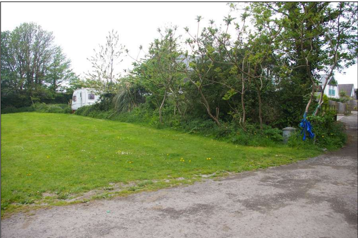
The remains of the bank and hedge to the north-west of the site; viewed from the south-east.