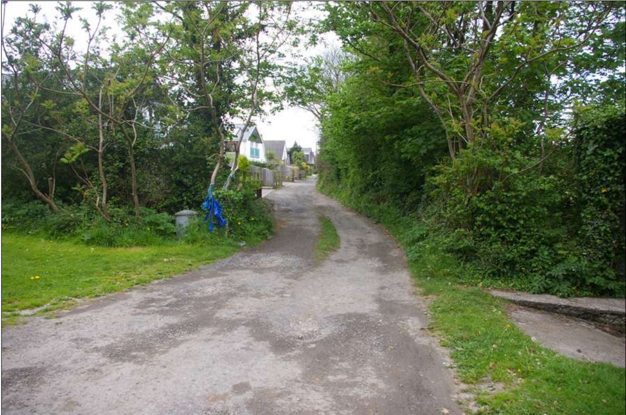
View along the track leading to the site off Cleavelands, past Lanveans 1-3 (the nearest houses to the west); viewed from the south looking north.