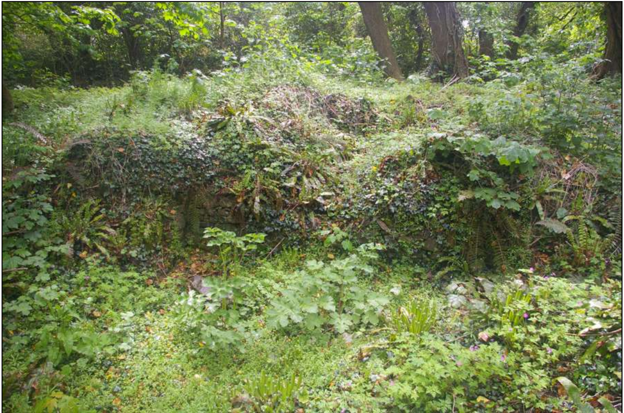
View of some of the standing walls within the site, located towards the south-western part of the central enclosure; here the walls of a small square structure rises through the foliage; viewed from the east.