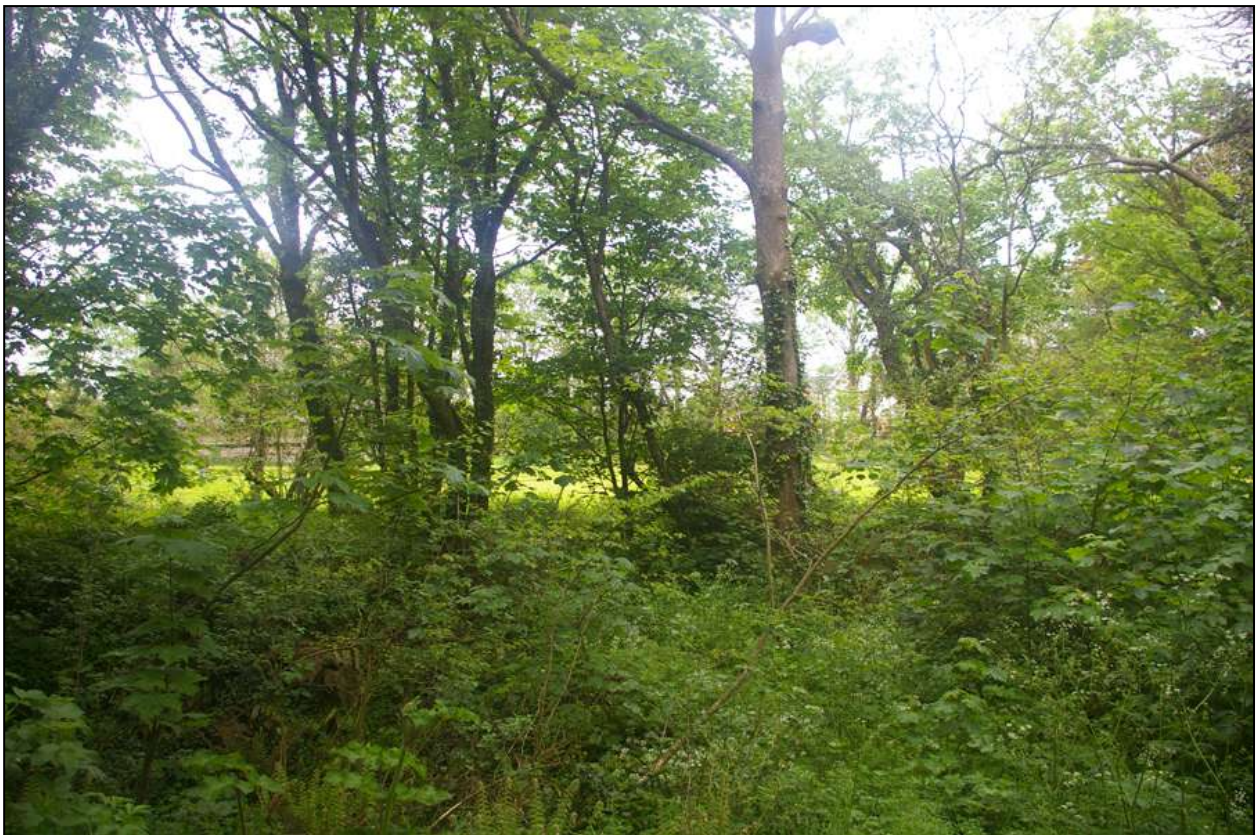
View from the northern part of the central enclosure of the monument, showing intervisibility with the newly built houses to the north of the site and views to the site itself, through the trees; viewed from the south.