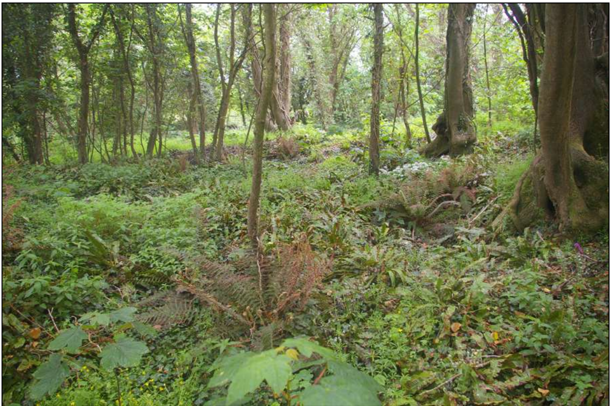
View from the north-west corner of the moated site across to the south-east corner of the enclosure, showing scrub and tree coverage; viewed from the north-west.