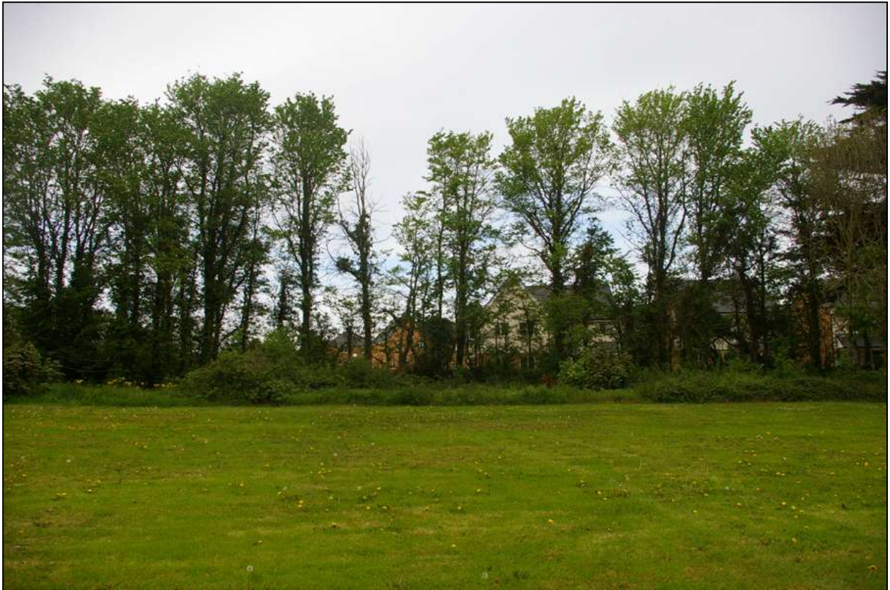
View from the site showing intervisibility through the line of mature trees to the first phase (already occupied) of the new houses to the north; viewed from the south.