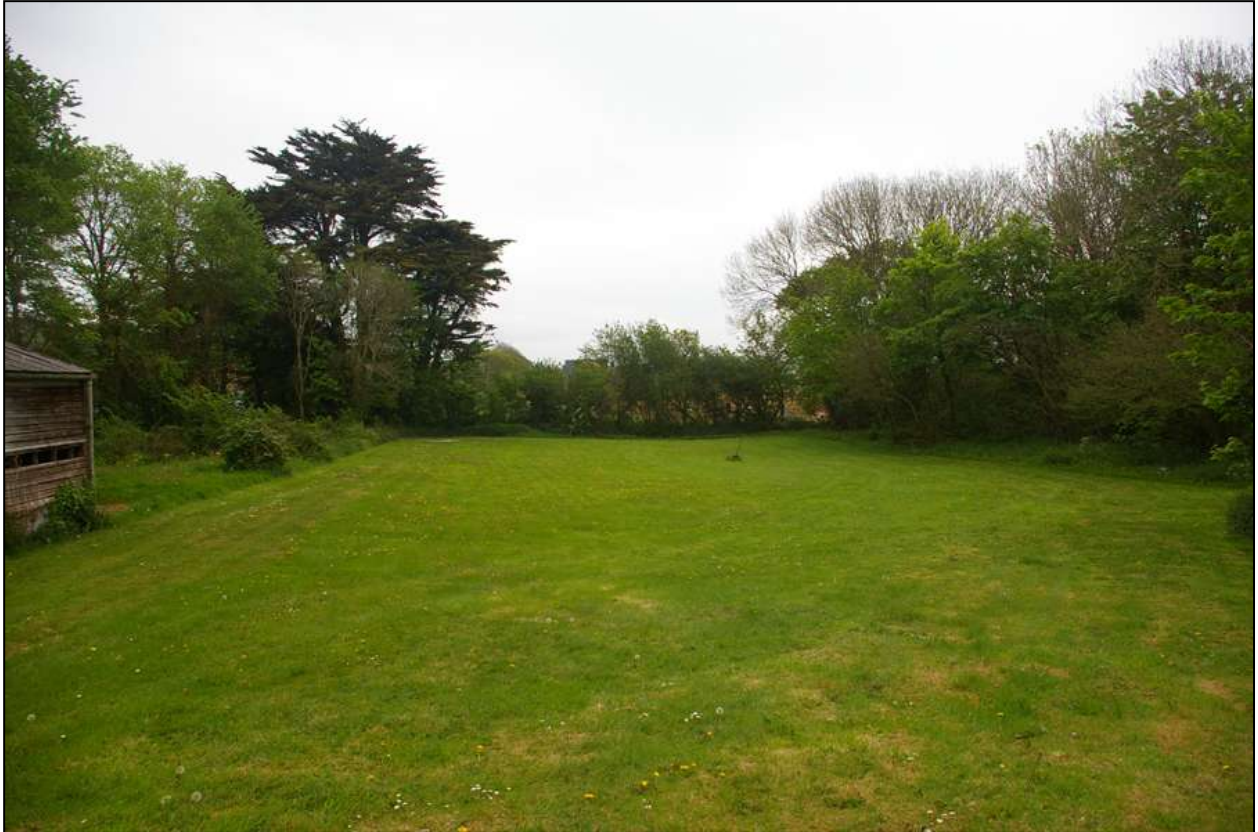
View east across the lawned area of the site, showing the mature if scrappy and ragged eastern boundary hedge; viewed from the west.