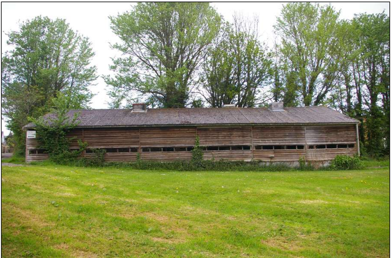
The wooden agricultural building, a former poultry shed, that occupied the centre of the northern boundary of the site, just east of the access track; viewed from the south-east.