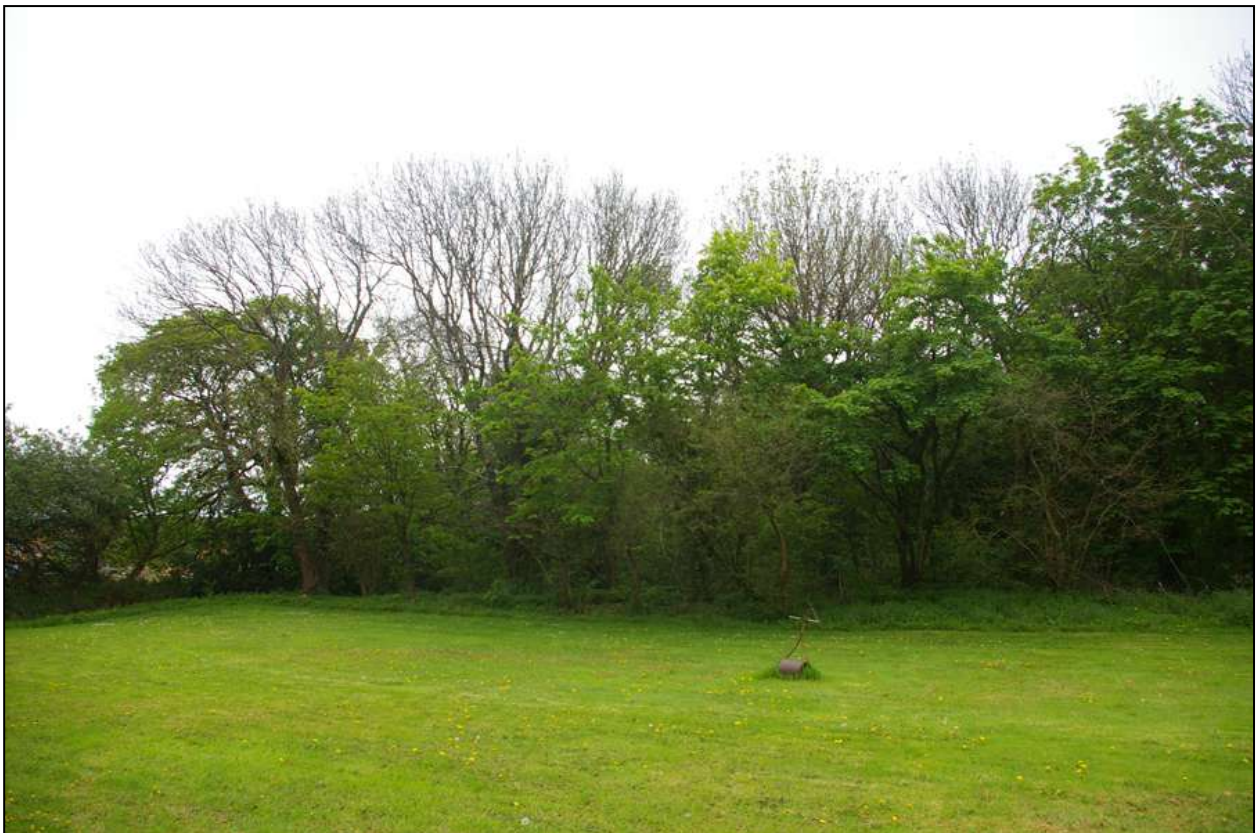
The scrub woodland that abuts the southern side of the proposed site and which contains the moated Scheduled Monument; viewed from the north-west.