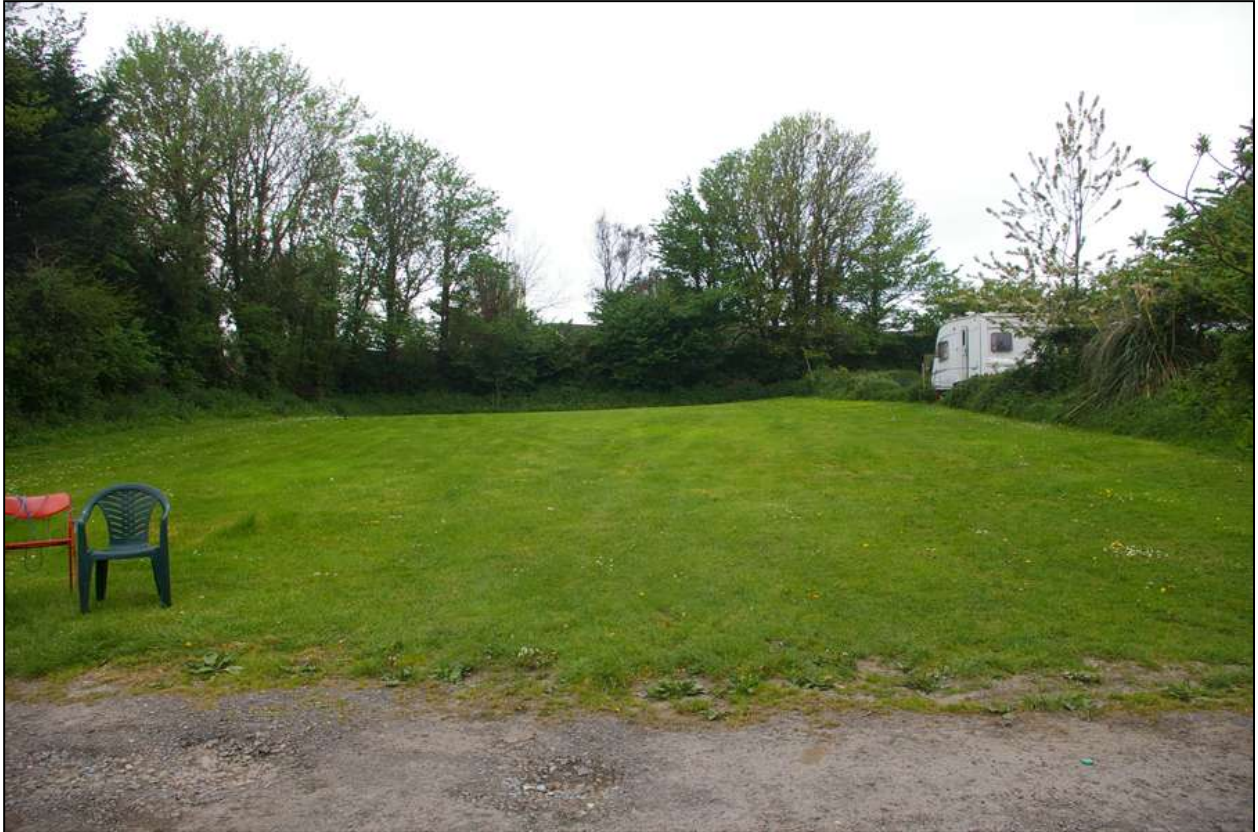
The western boundary, a mature hedge with trees with a fence beyond, enclosing a development of 20 th century bungalows; viewed from the east.