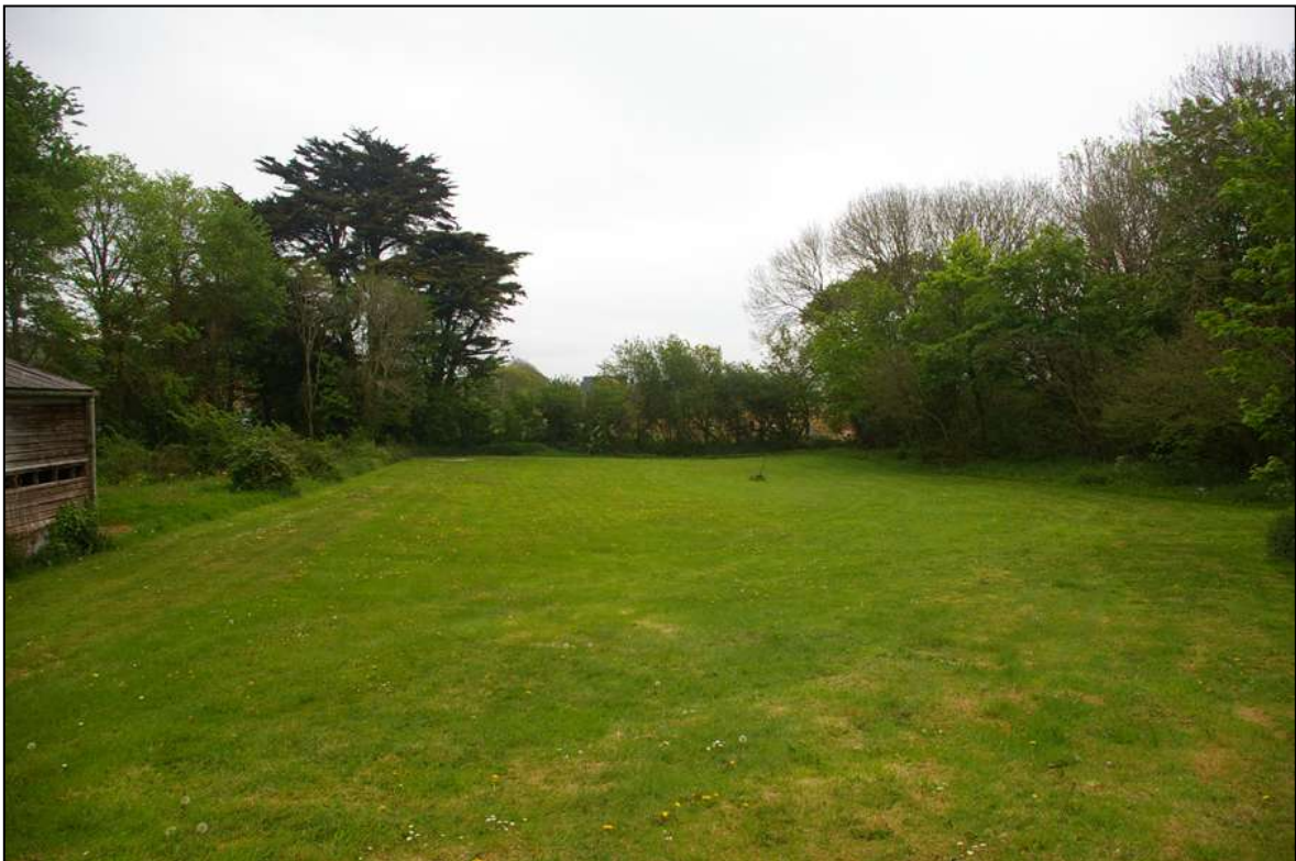
Figure 2: View across the site from the west; the SAM lies within the trees to the right.

The proposed site is enclosed by mature hedges to the north, east and west. The northern hedge features a line of mature trees, while the overgrowth western hedge features is flanked by a tall fence. The south-western bank and hedge, dividing the site from the private house Trelowarth, is more sparse. There are significant gaps in the hedge to the east, which allow wider views out of the site. Between the site and the Scheduled Monument there is no marked boundary, merely an area of scrub and brambles along a woodland fringe.