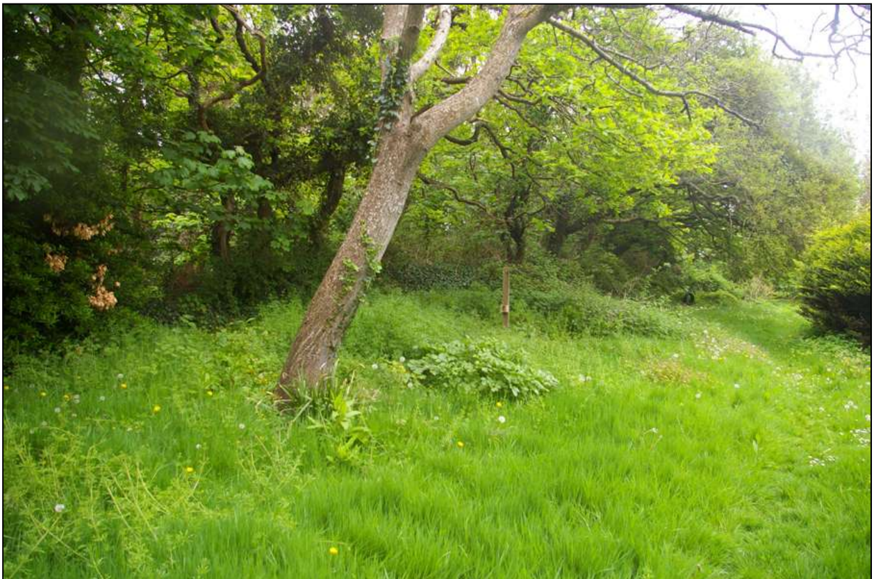
The hedge and wire fence boundary along the western side of the Scheduled Monument; viewed from the north-west.