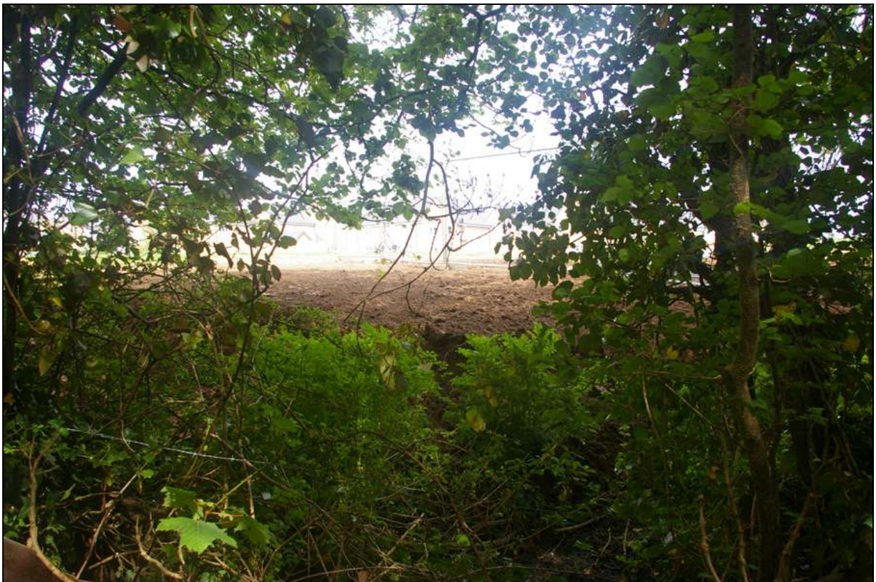
View from the south-east corner of the site, showing how the adjacent development extends right up to the edge of the Scheduled Monument, with intervisibility, aural intrusion and physical effects on the monument; viewed from the west.