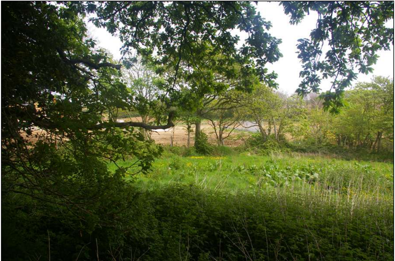
View from the southern bank of the moated site, looking south across the fields of the valley, showing the next phase of the development, which will wrap around the monument on its southern side and south-east corner; viewed from the north-west.