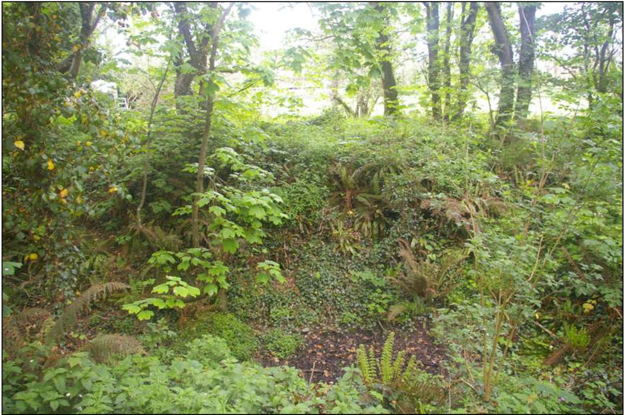
View of the deep ditch on the northern side of the monument; viewed from the south-west.