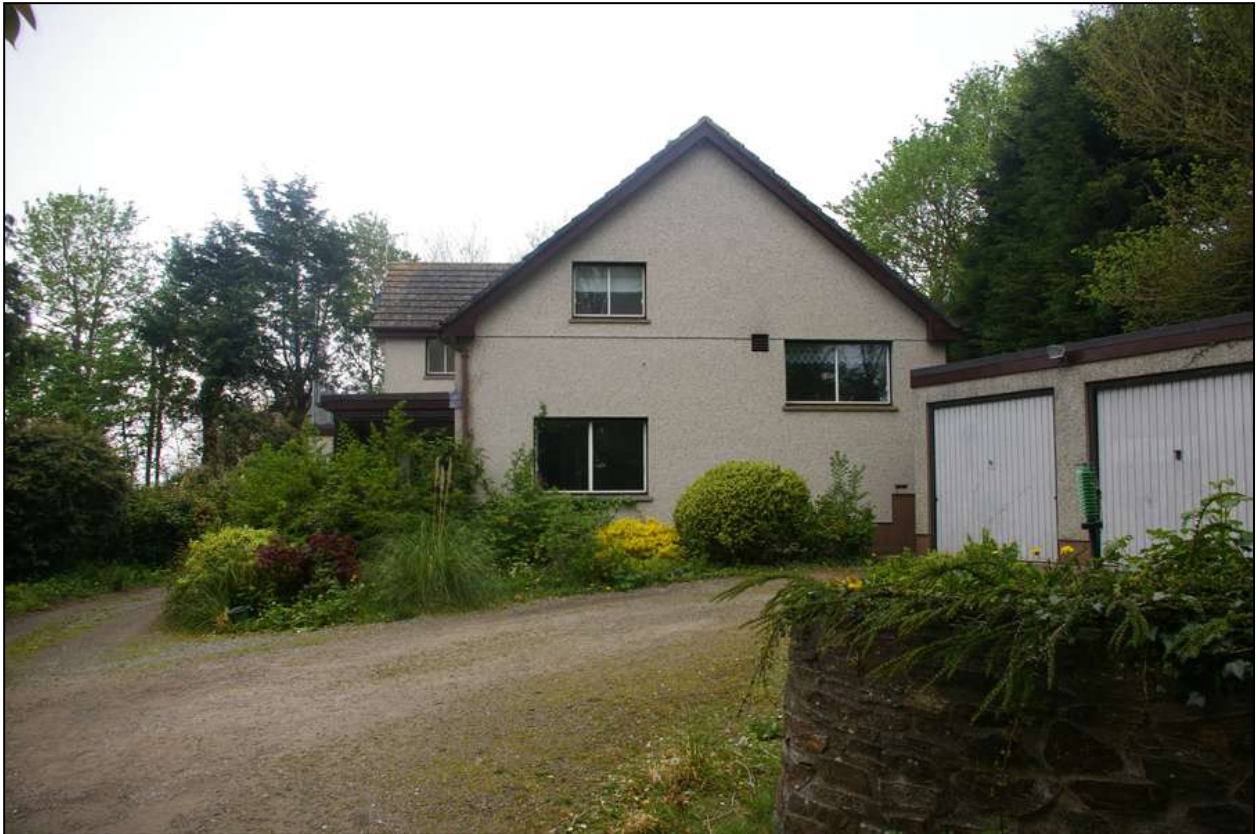
View of adjacent abandoned property, Trelowarth, the subject of an active planning application for 14 dwellings to be built on its site and garden; viewed from the east.