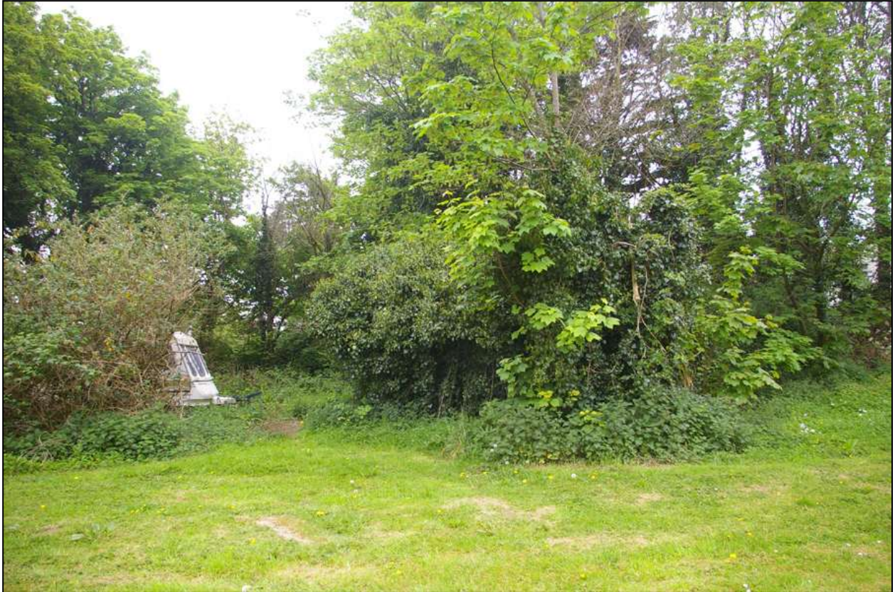
The ruined agricultural sheds and caravan, just on the edge of the scrub woodland, on the southern side of the site; viewed from the north.