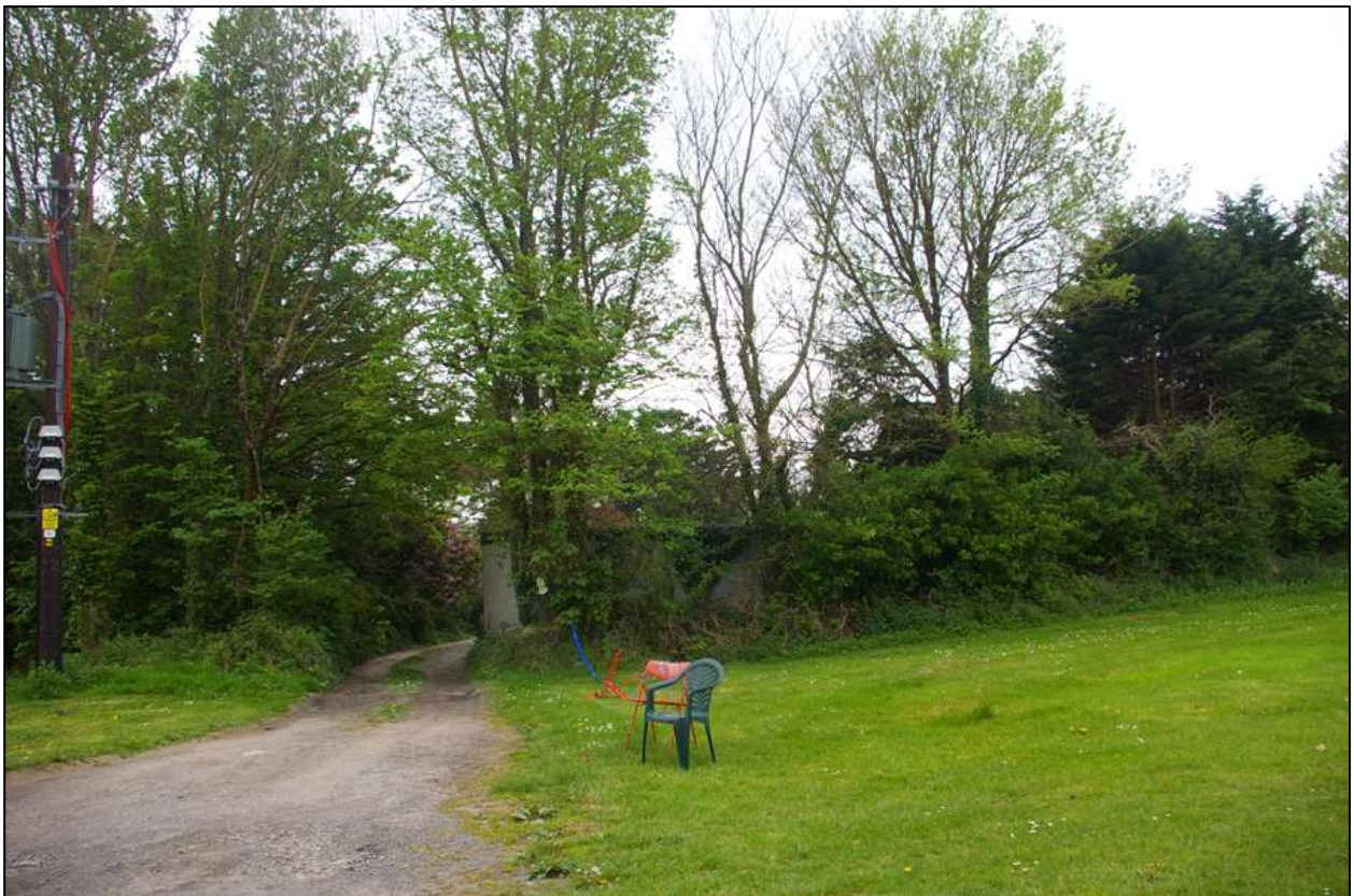
The track bisects the site and to access Trelowarth, the private property to the south-west, which lies within a large overgrown garden that borders the Scheduled Monument to the west; viewed from the north.