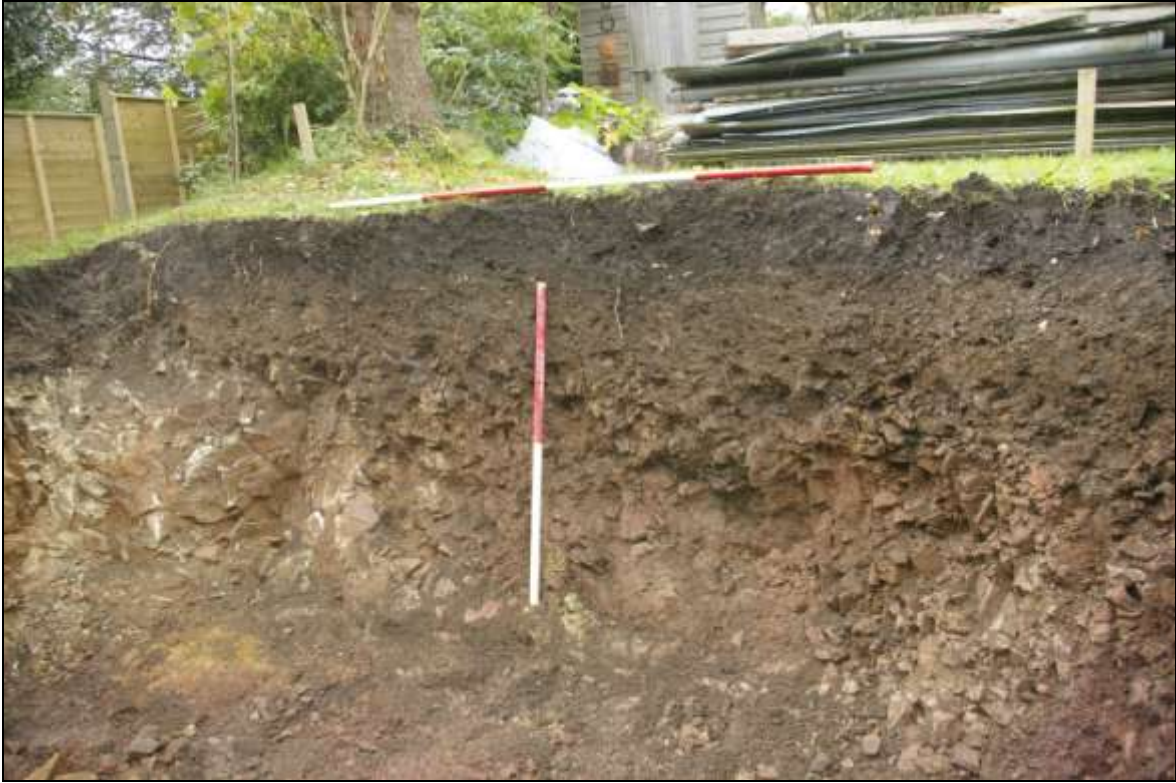
Figure 2: South-east facing section of area 1, oblique; viewed from the north-east (1m & 2m scales).