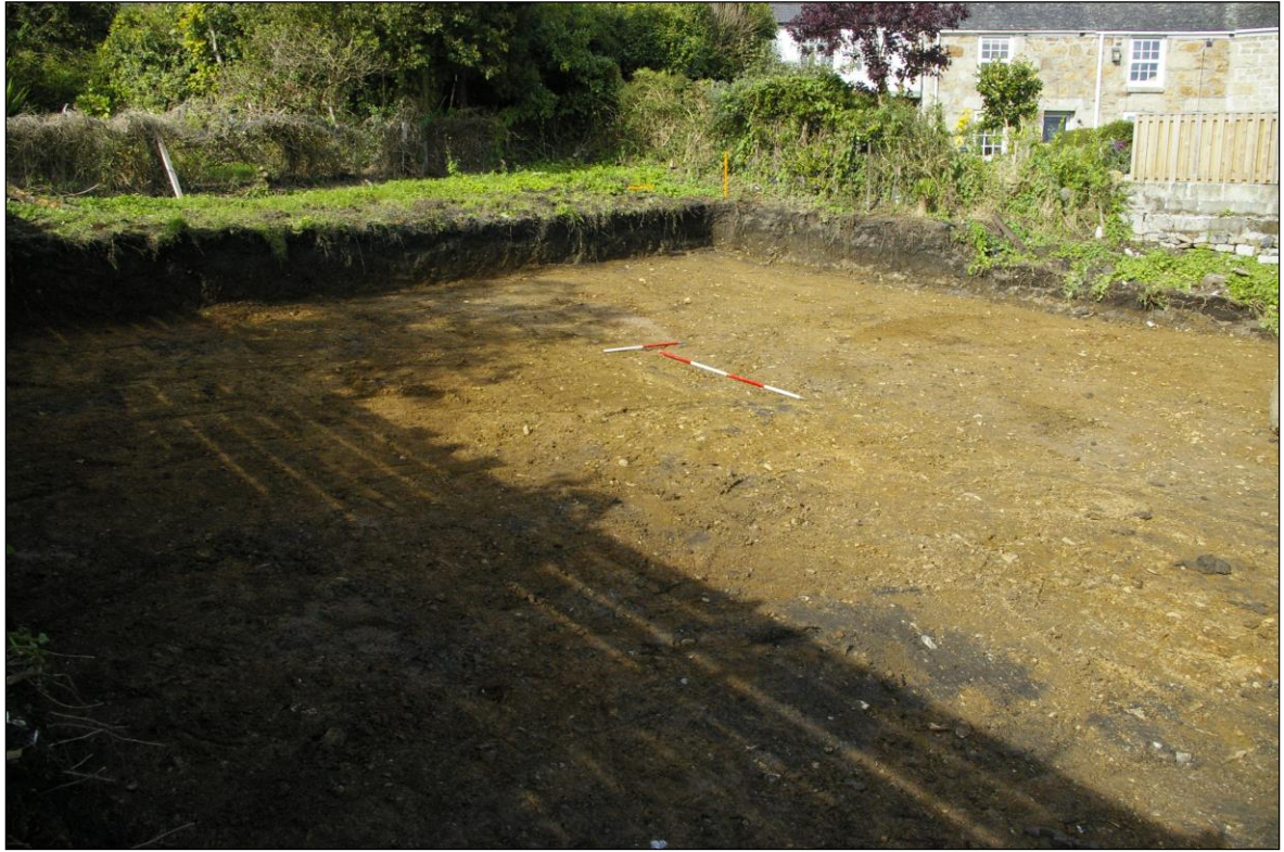
Figure 2: Area 1 post-excitation; viewed from the east (1m & 2m scales).