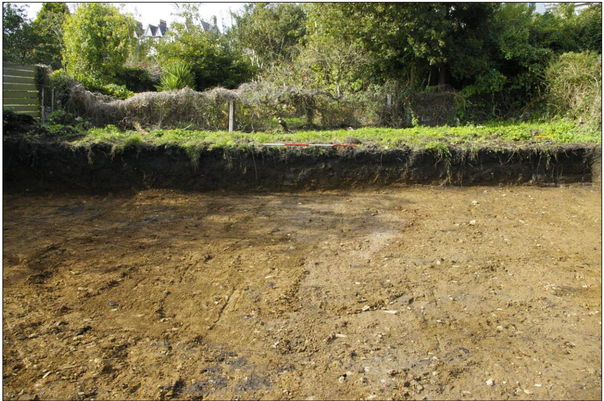
Figure 3: Area 01 north-east facing section; viewed from the north-east (2m scale).