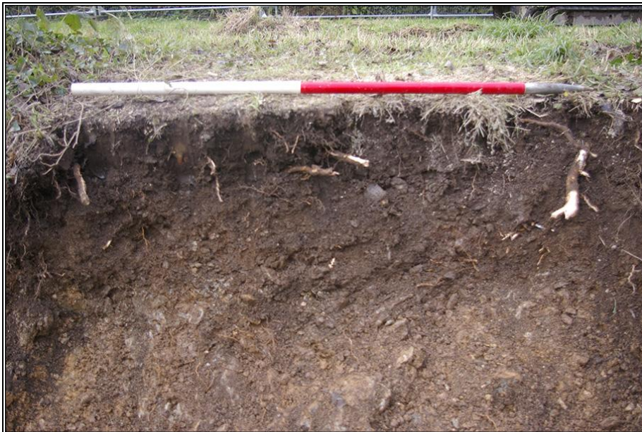
Figure 2: Sample Section; viewed from the north-east (scale 1m).