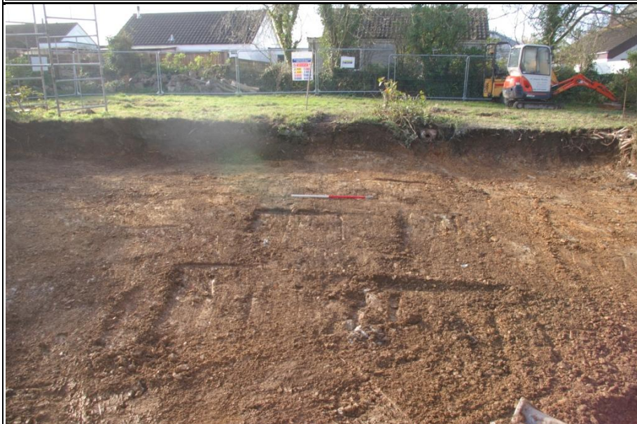
Figure 4: Site shot, post-excavation; viewed from the north-west (scale 1m)