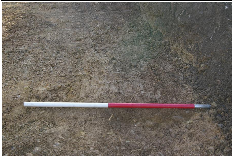
Figure 3: Ditch [104]; viewed from the north (scale 1m).