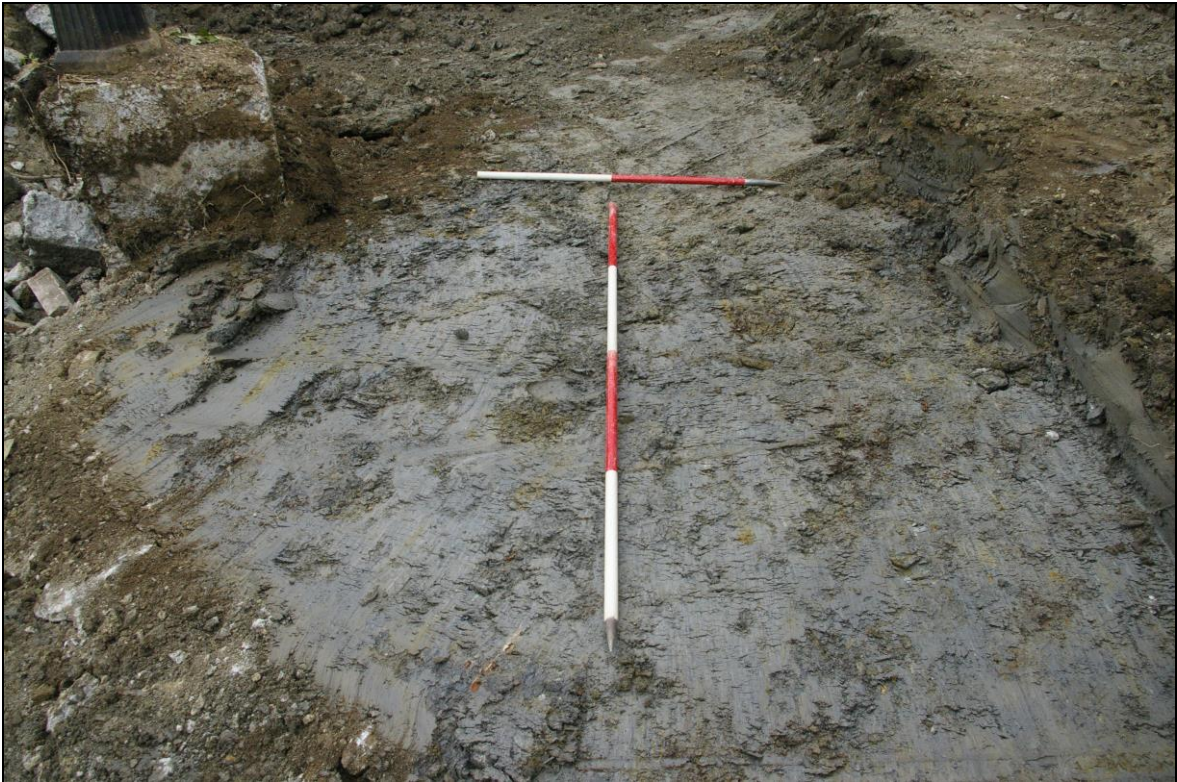
FIGURE 3: AREA 01, POST-EXCAVATION; VIEWED FROM THE EAST (SCALES 1M & 2M).