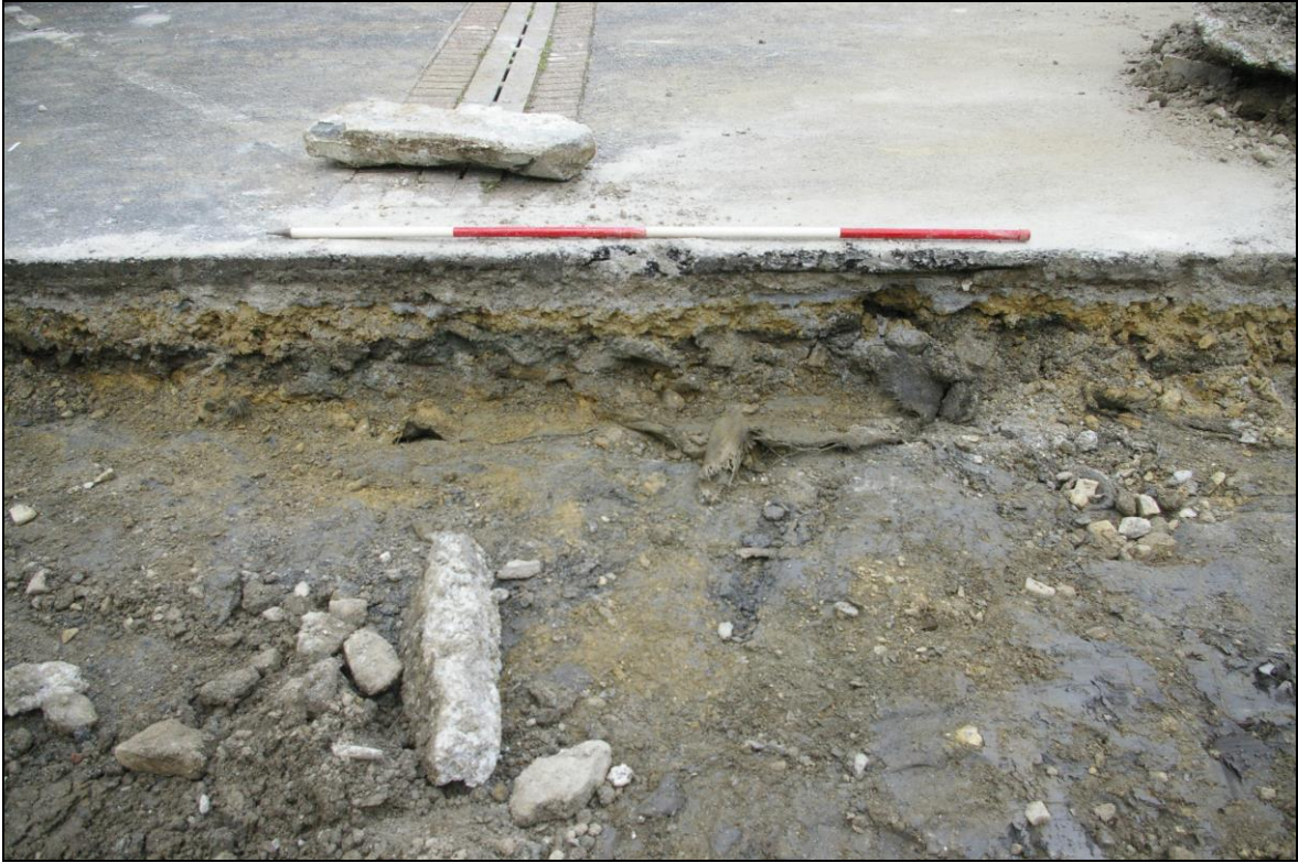
FIGURE 2: AREA 01, NORTH-EAST FACING SECTION BENEATH TARMAC CAR PARK; VIEWED FROM THE NORTH-EAST (SCALE 2M).