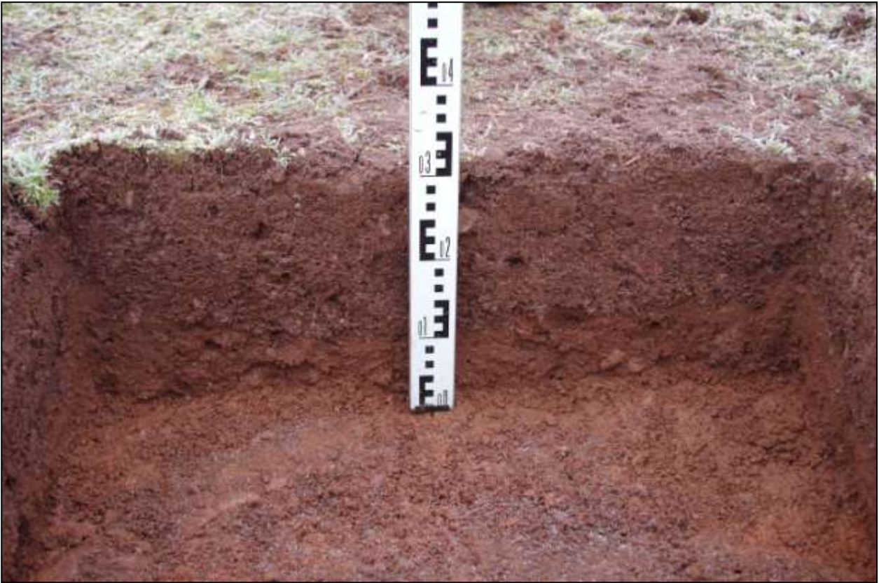
67. SOUTH-FACING SECTION OF TP#27; VIEWED FROM THE SOUTH.