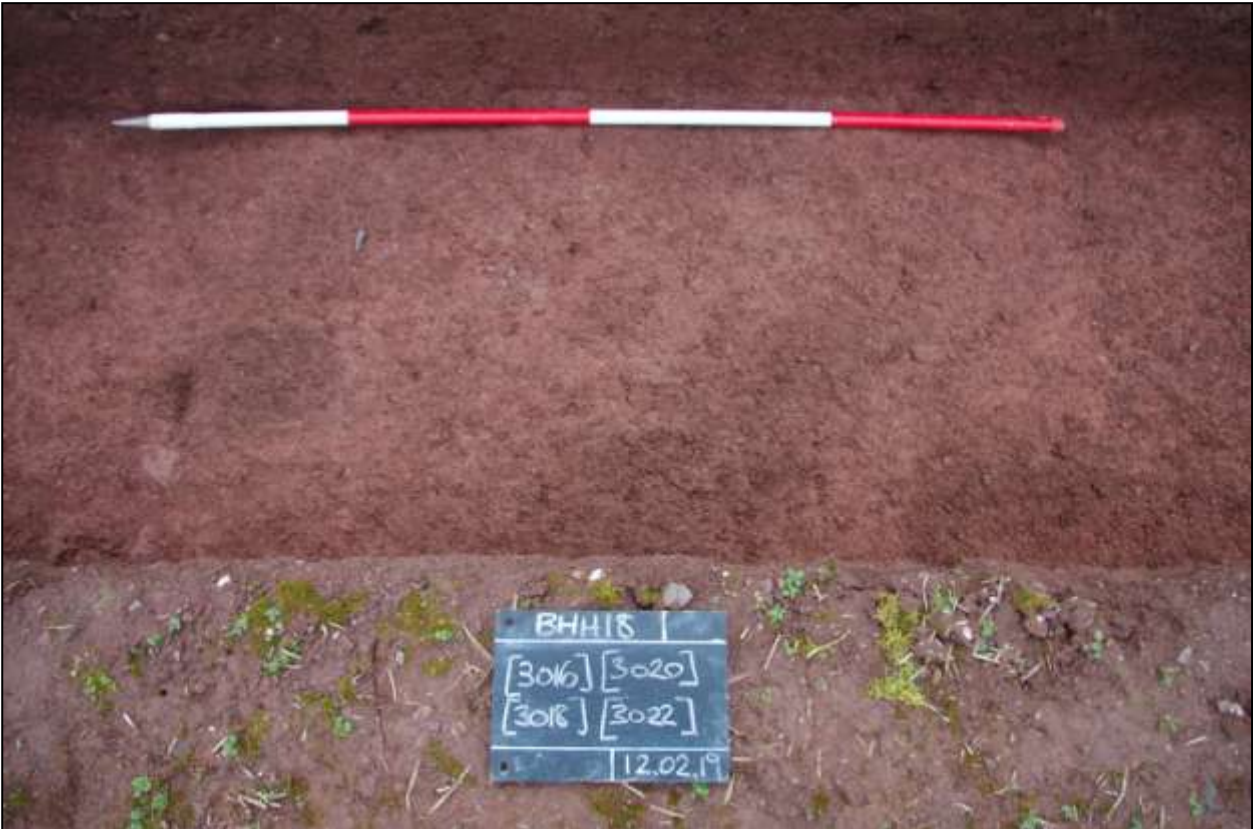
15. TRENCH #2, FEATURES [3016] [3018] [3020] AND [3022]; VIEWED FROM THE EAST (SCALE 2M).