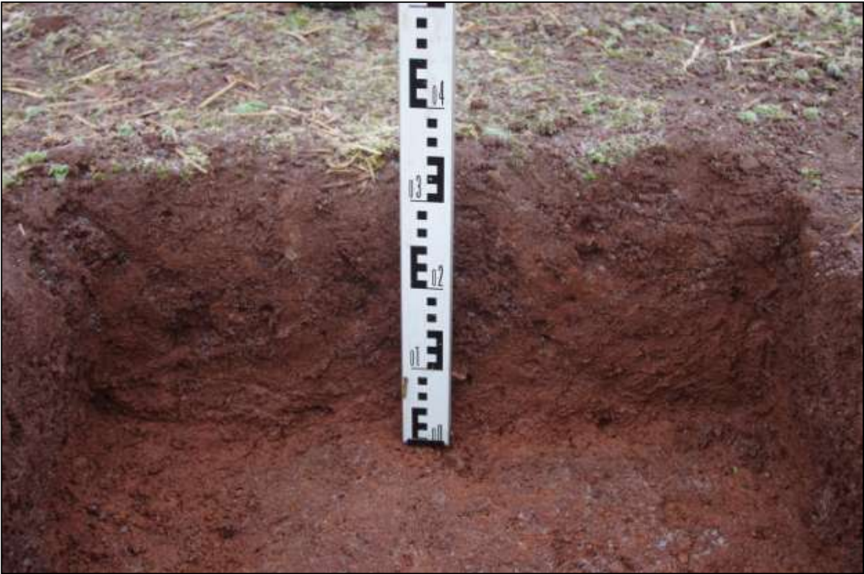
43. SOUTH-FACING SECTION OF TP#3; VIEWED FROM THE SOUTH.