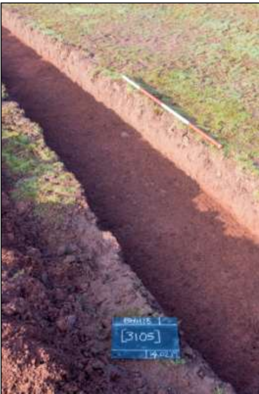
30. (LEFT) TRENCH #3, FEATURE [3105]; VIEWED FROM THE EAST (SCALE 2M).