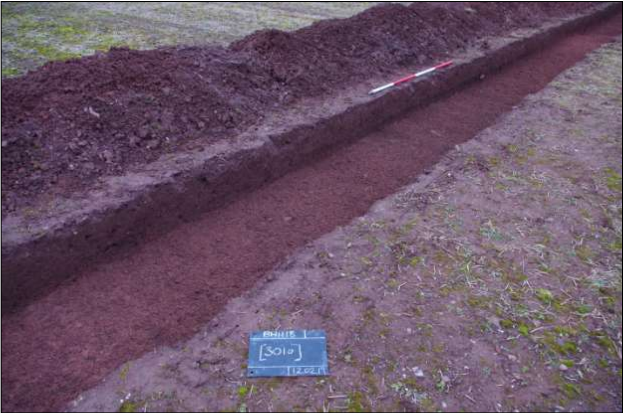
13. TRENCH #2, HENGE DITCH [3010]; VIEWED FROM THE SOUTH-EAST (SCALE 2M).