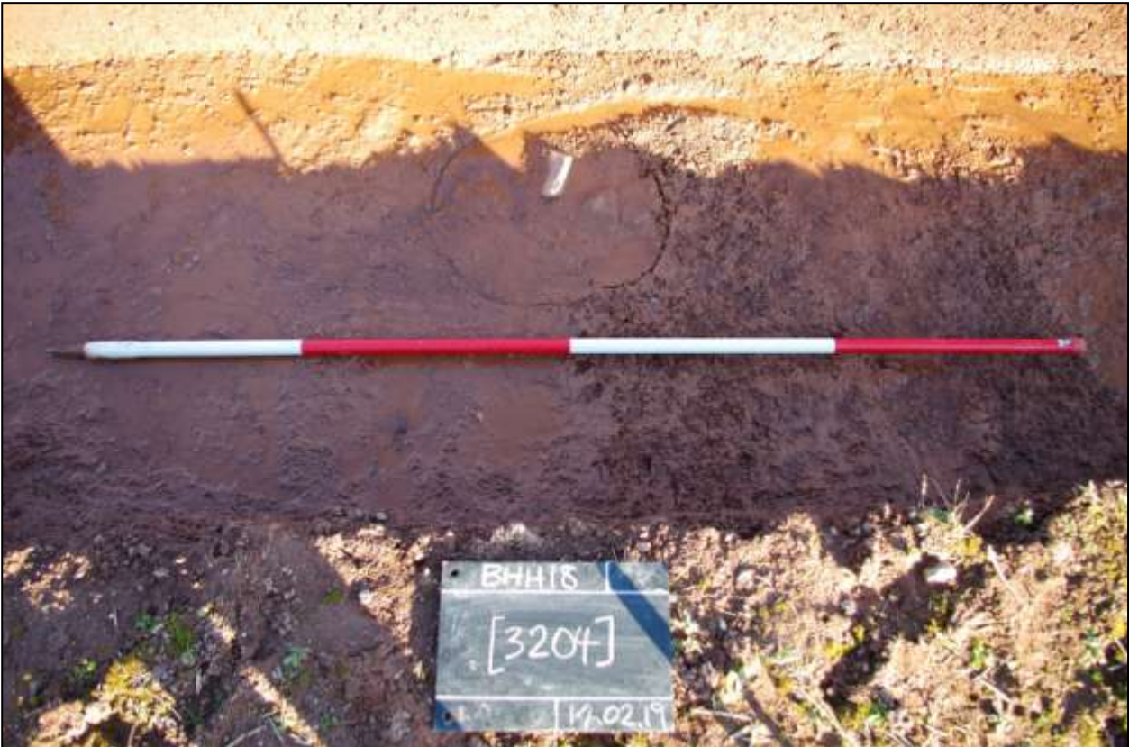
34. TRENCH #4, FEATURE [3204]; VIEWED FROM THE WEST (SCALE 2M).