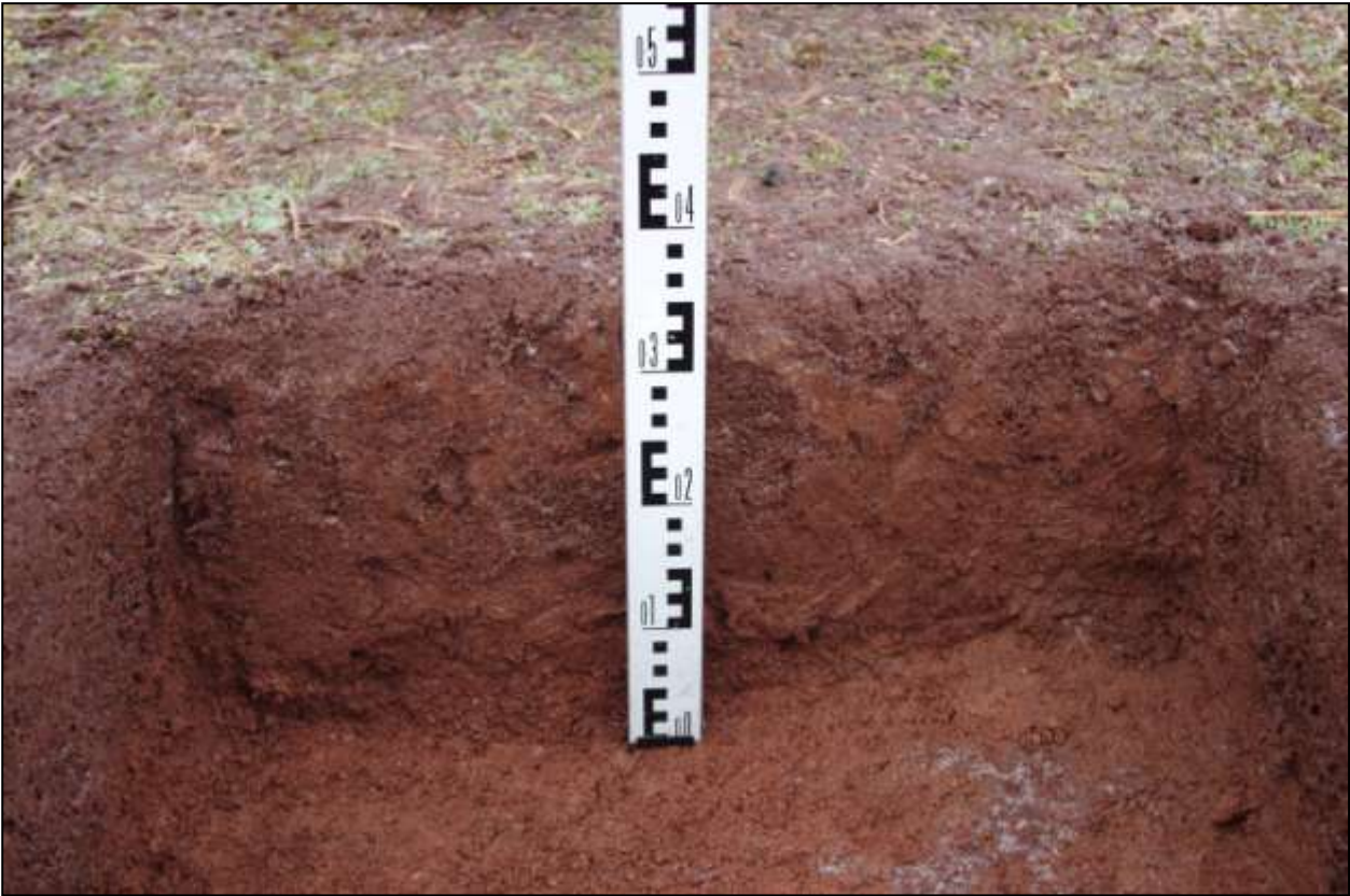
41. SOUTH-FACING SECTION OF TP#1; VIEWED FROM THE SOUTH.