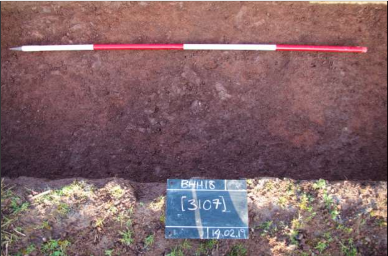
27. TRENCH #3, FEATURE [3107]; VIEWED FROM THE SOUTH-EAST (SCALE 2M).