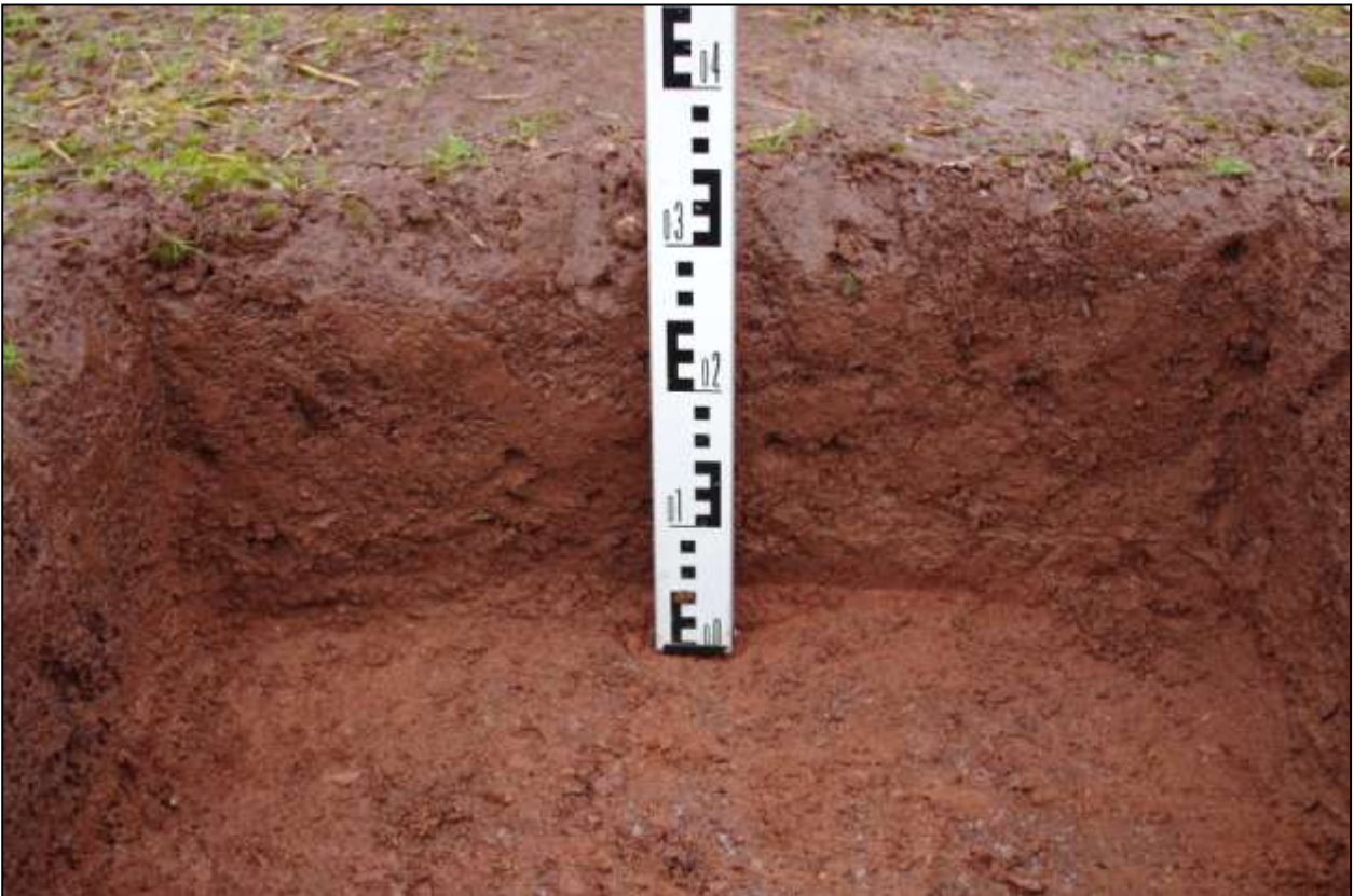
50. SOUTH-FACING SECTION OF TP#10; VIEWED FROM THE SOUTH.