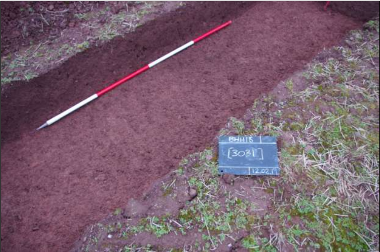
22. AS ABOVE, VIEWED FROM THE SOUTH-EAST (SCALE 2M).