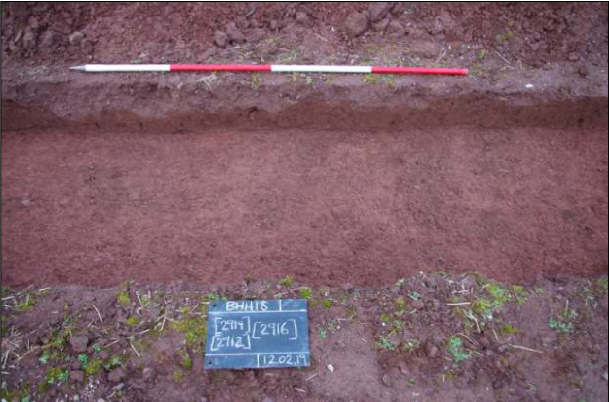
6. TRENCH #1, FEATURES [2912] [2914] AND [2916]; VIEWED FROM THE SOUTH (SCALE 2M).