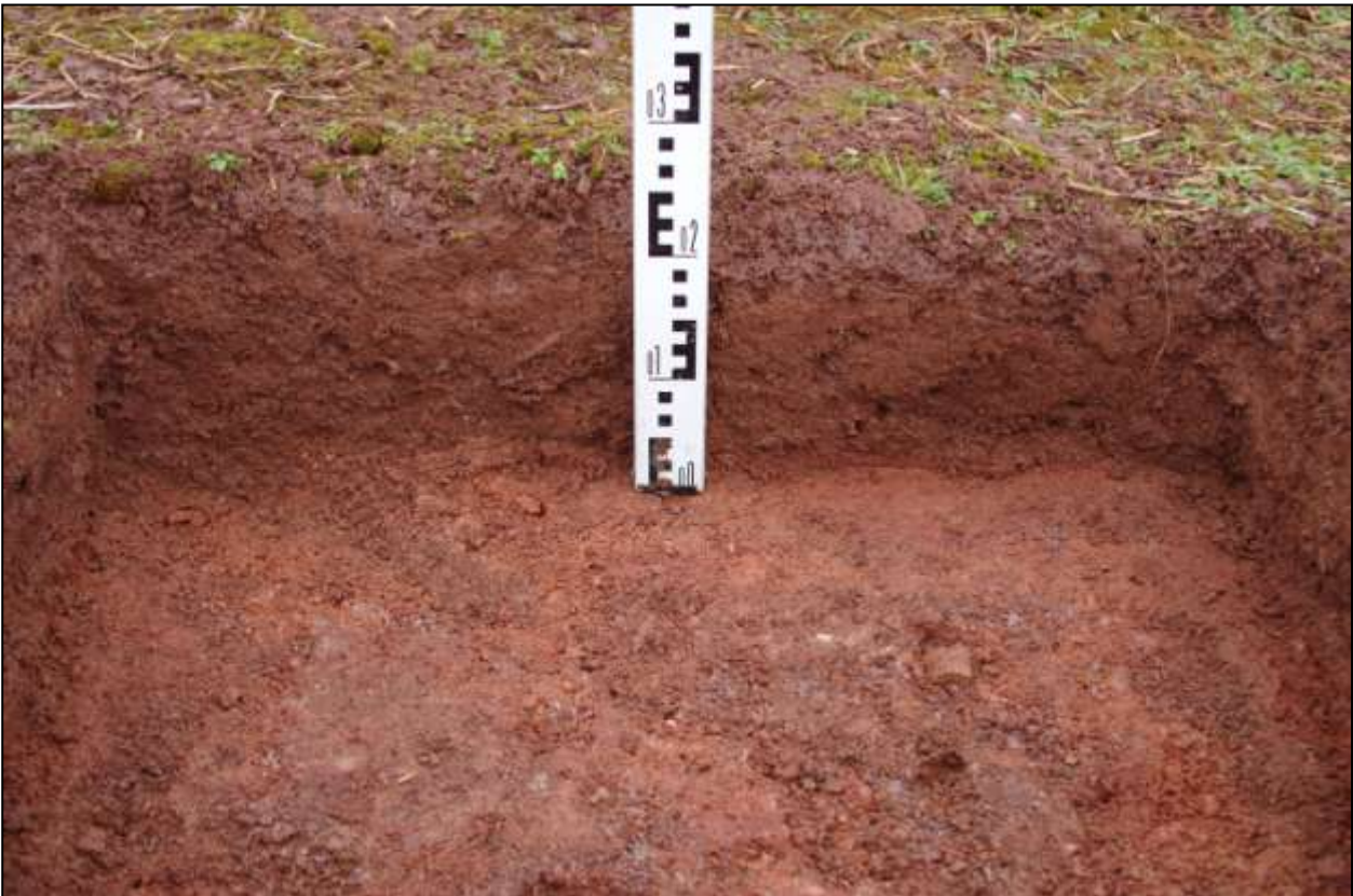
62. SOUTH-FACING SECTION OF TP#22; VIEWED FROM THE SOUTH.