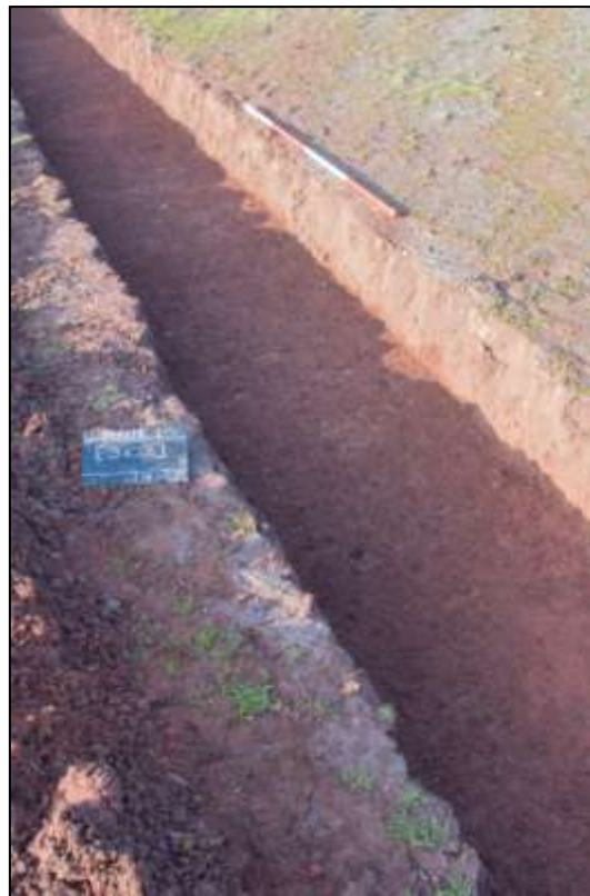
31. (RIGHT) TRENCH #3, FEATURE [3103]; VIEWED FROM THE EAST (SCALE 2M).