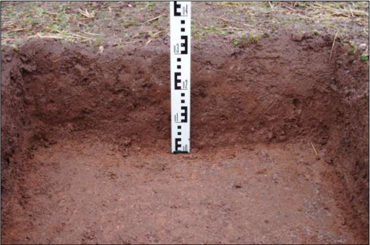
47. SOUTH-FACING SECTION OF TP#7; VIEWED FROM THE SOUTH.