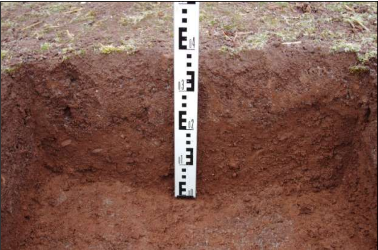
42. SOUTH-FACING SECTION OF TP#2; VIEWED FROM THE SOUTH.