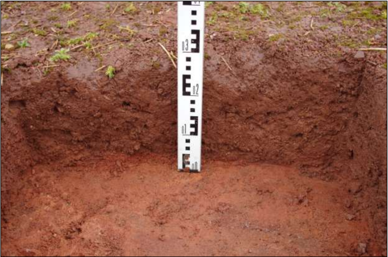
63. SOUTH-FACING SECTION OF TP#23; VIEWED FROM THE SOUTH.