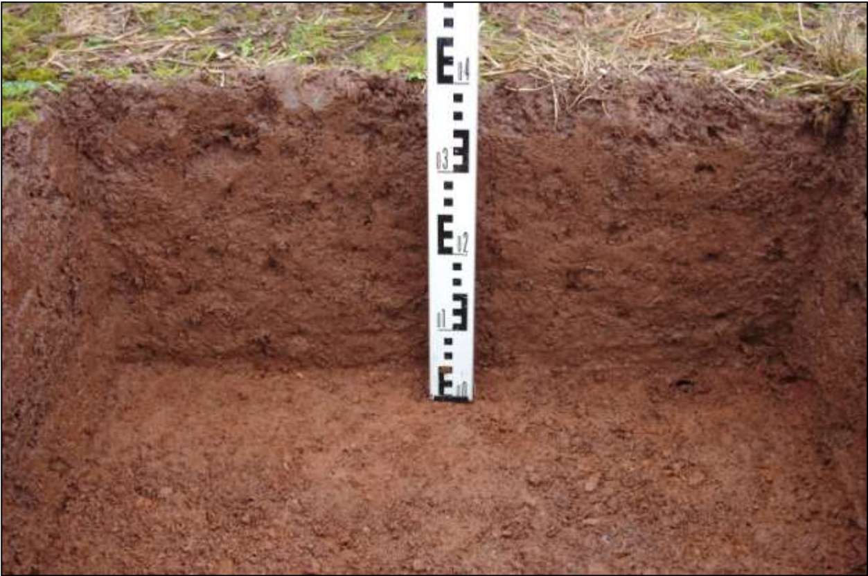
61. SOUTH-FACING SECTION OF TP#21; VIEWED FROM THE SOUTH.