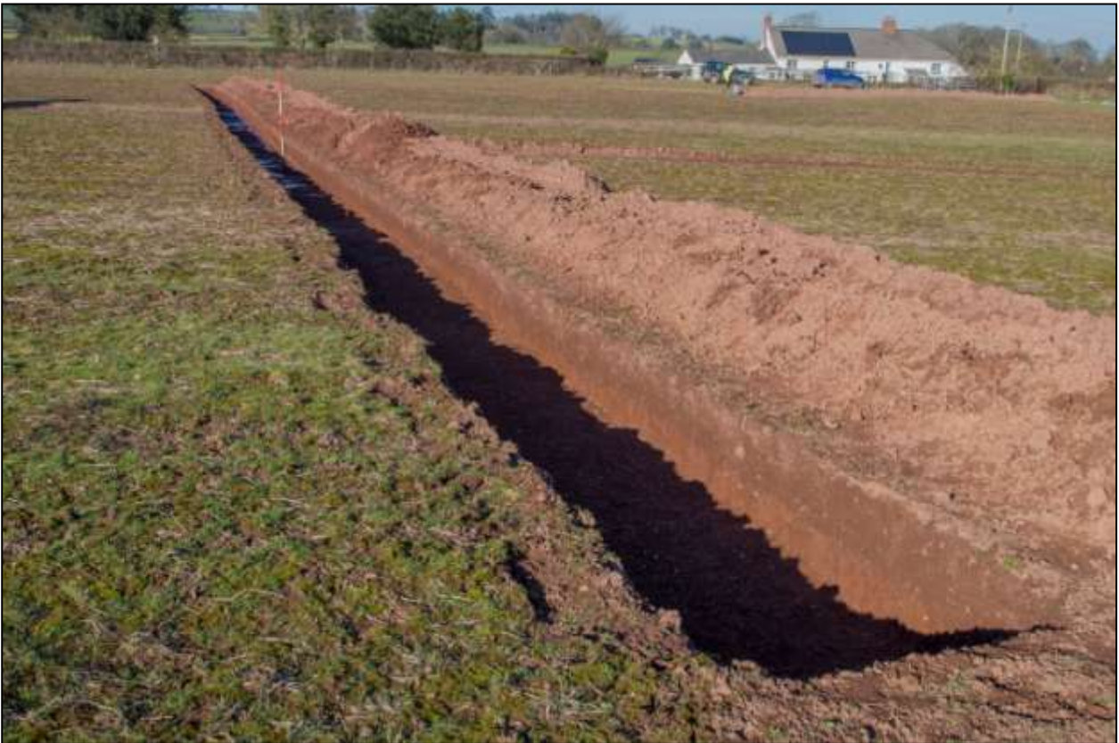
33. AS ABOVE, VIEWED FROM THE SOUTH-SOUTH-WEST (SCALE 2M).