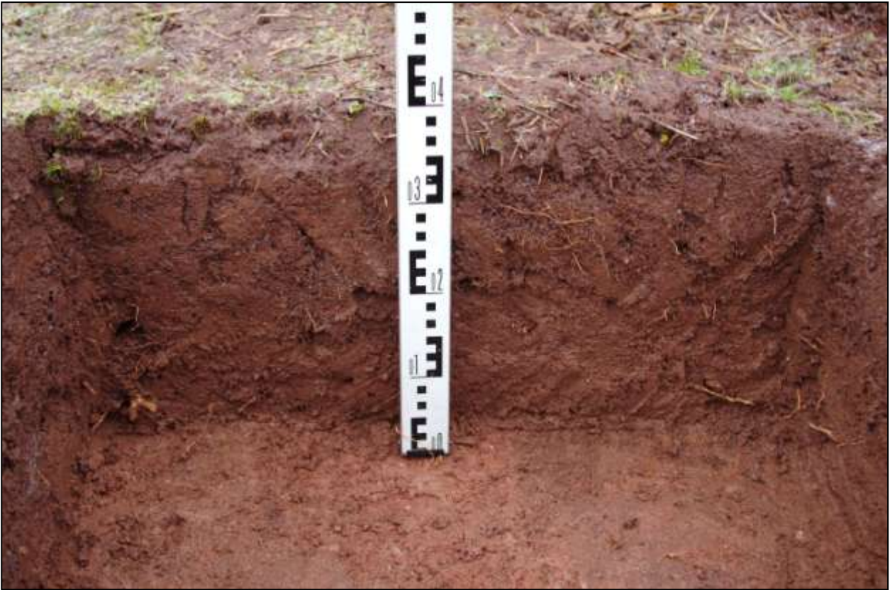
49. SOUTH-FACING SECTION OF TP#9; VIEWED FROM THE SOUTH.