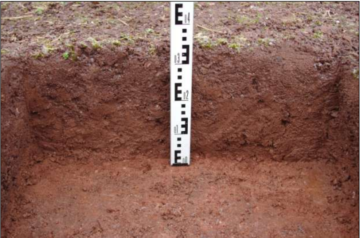
48. SOUTH-FACING SECTION OF TP#8; VIEWED FROM THE SOUTH.