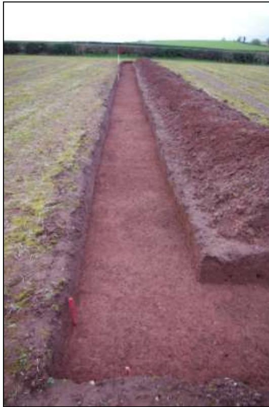
1. (LEFT) TRENCH #1; VIEWED FROM THE WEST (SCALE 2M). 2. (RIGHT) AS ABOVE, VIEWED FROM THE EAST (SCALE 2M).