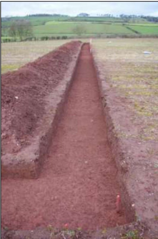
9. (LEFT) TRENCH #2, VIEWED FROM THE SOUTH (SCALE 2M).