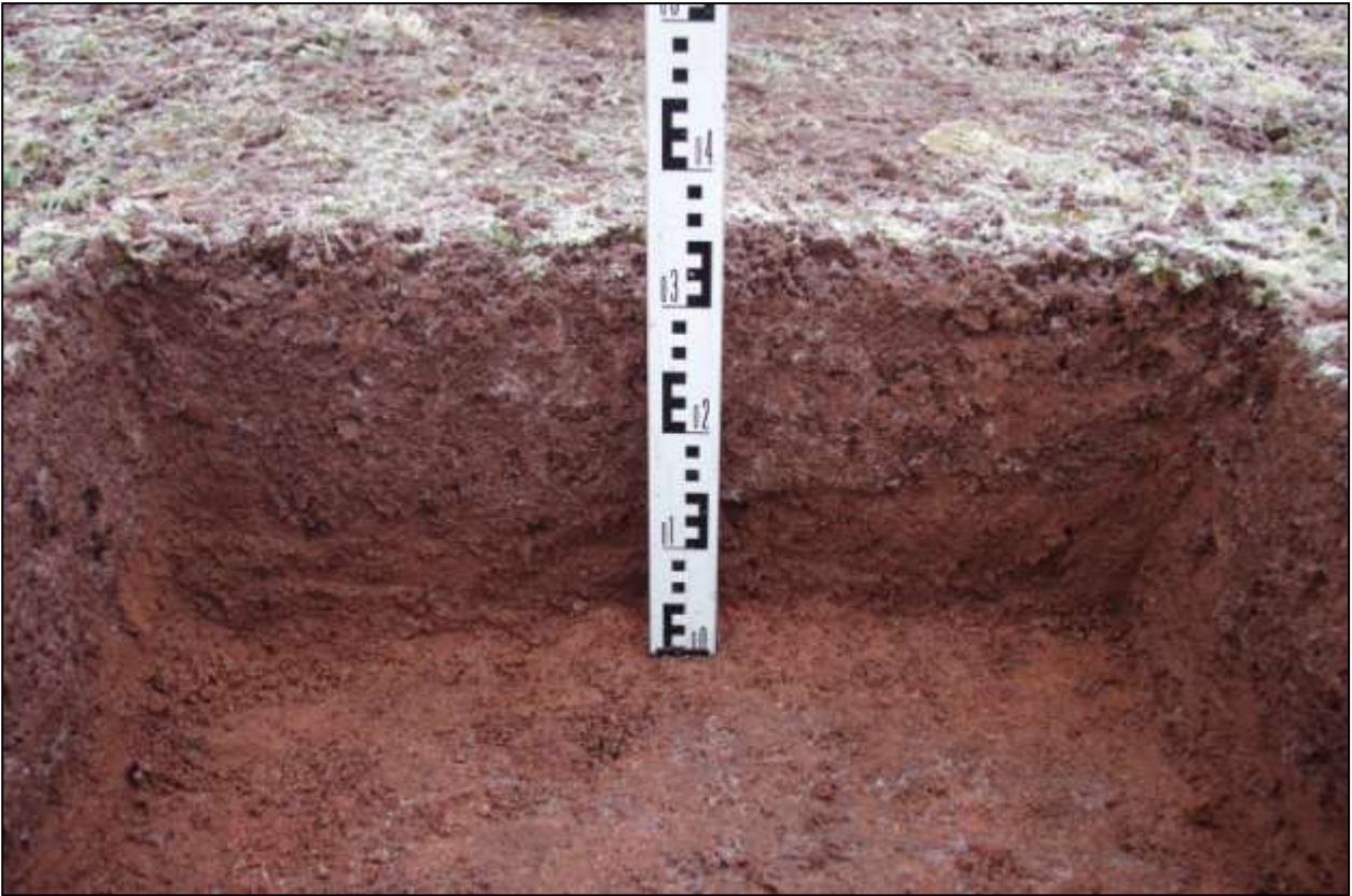
45. SOUTH-FACING SECTION OF TP#5; VIEWED FROM THE SOUTH.