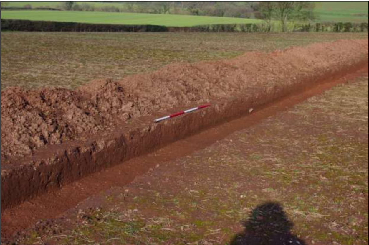
23. TRENCH #2, HENGE DITCH [3010]; VIEWED FROM THE SOUTH-EAST (SCALE 2M).