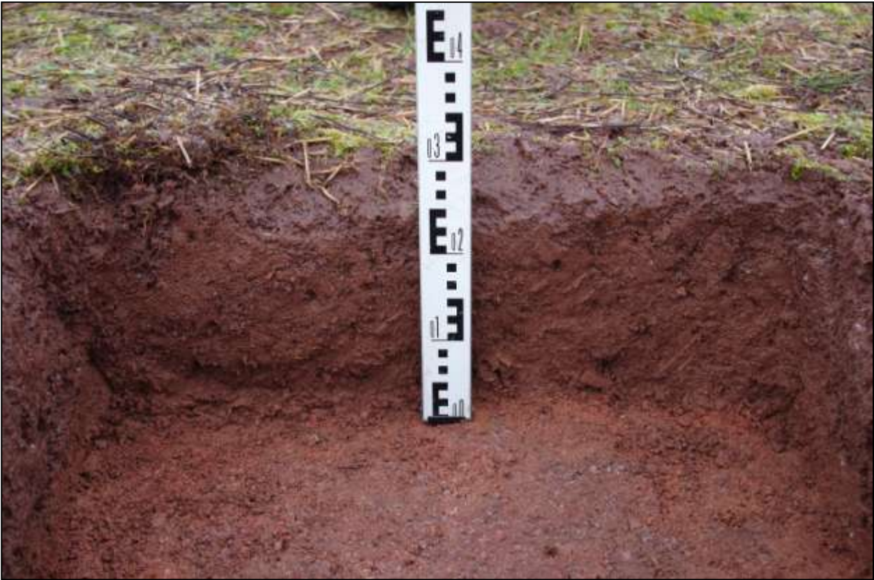
51. SOUTH-FACING SECTION OF TP#11; VIEWED FROM THE SOUTH.