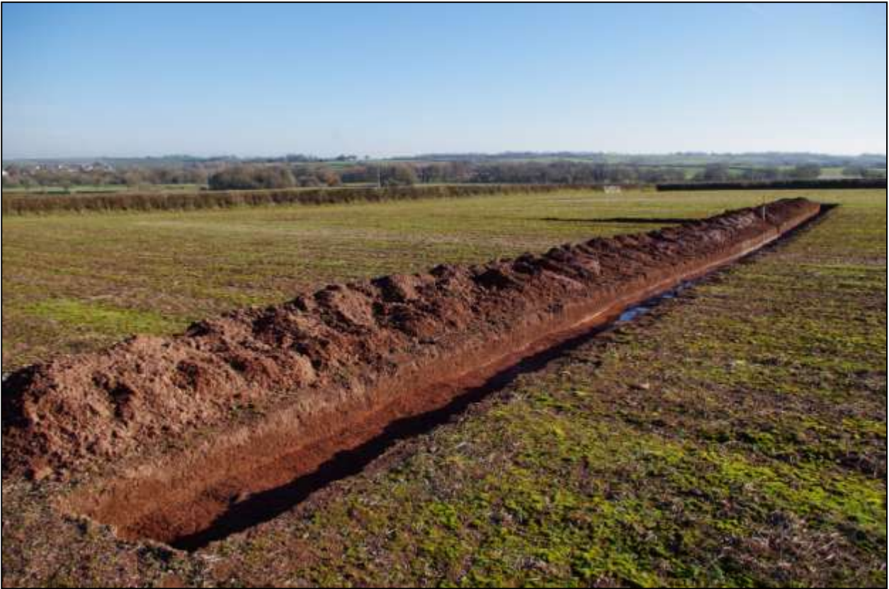
32. TRENCH #4, VIEWED FROM THE NORTH-NORTH-WEST (SCALE 2M).