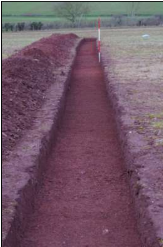
10. (RIGHT) AS ABOVE, DETAIL OF HENGE DITCH [3010]; VIEWED FROM THE SOUTH (SCALE 2M).