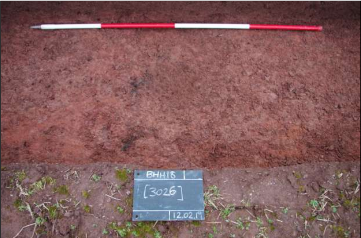
17. TRENCH #2, FEATURE [3026]; VIEWED FROM THE EAST (SCALE 2M).