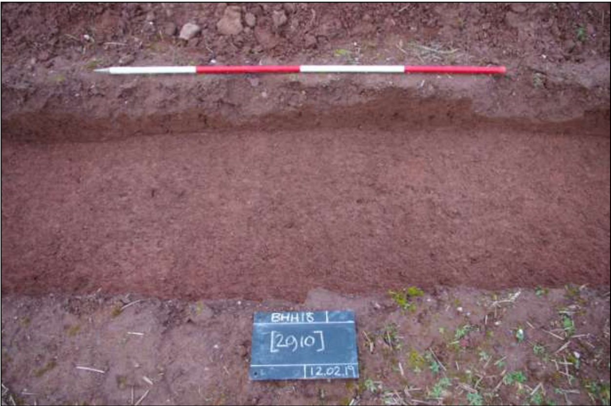
5. TRENCH #1, FEATURE [2910]; VIEWED FROM THE SOUTH (SCALE 2M).