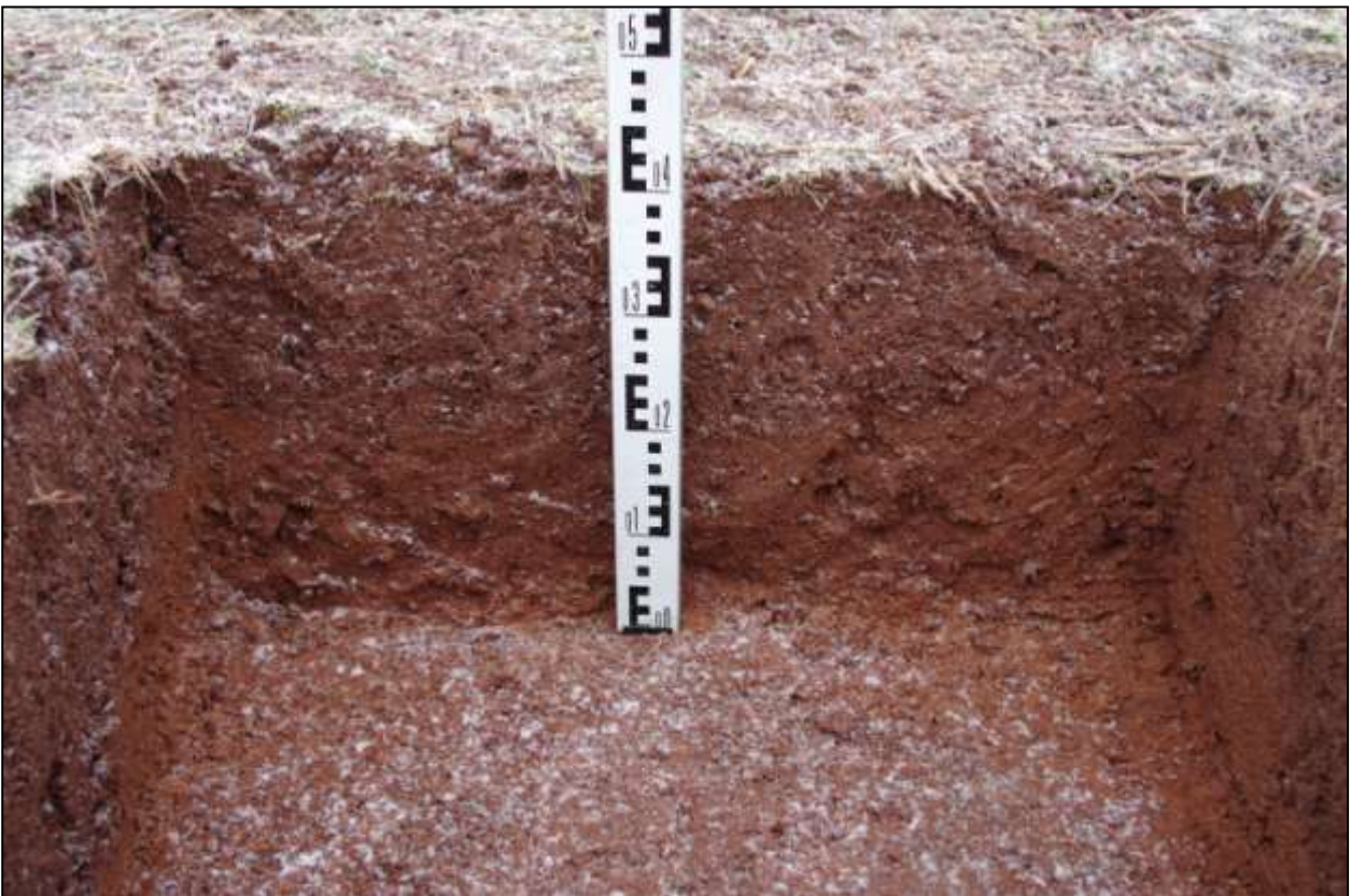
60. SOUTH-FACING SECTION OF TP#20; VIEWED FROM THE SOUTH.