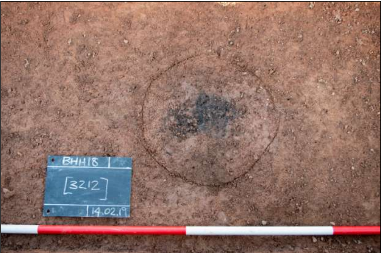
37. TRENCH #4, FEATURE [3212]; VIEWED FROM THE WEST (SCALE 2M).