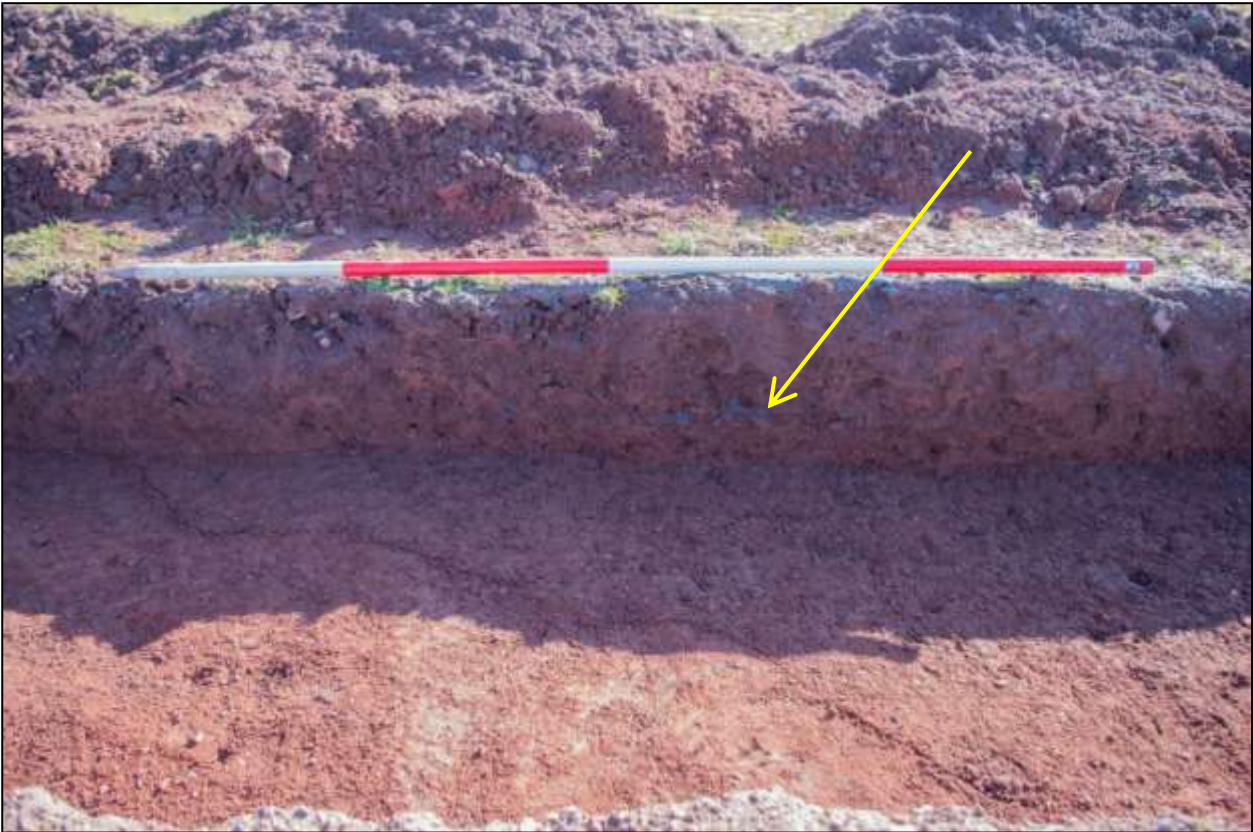
29. TRENCH #3, NORTH-WEST FACING SECTION TOWARDS THE WESTERN END, SHOWING THE GREY GRITTY SAND TO THE BASE OF THE PLOUGHSOIL (INDICATED); VIEWED FROM THE NORTH (SCALE 2M).