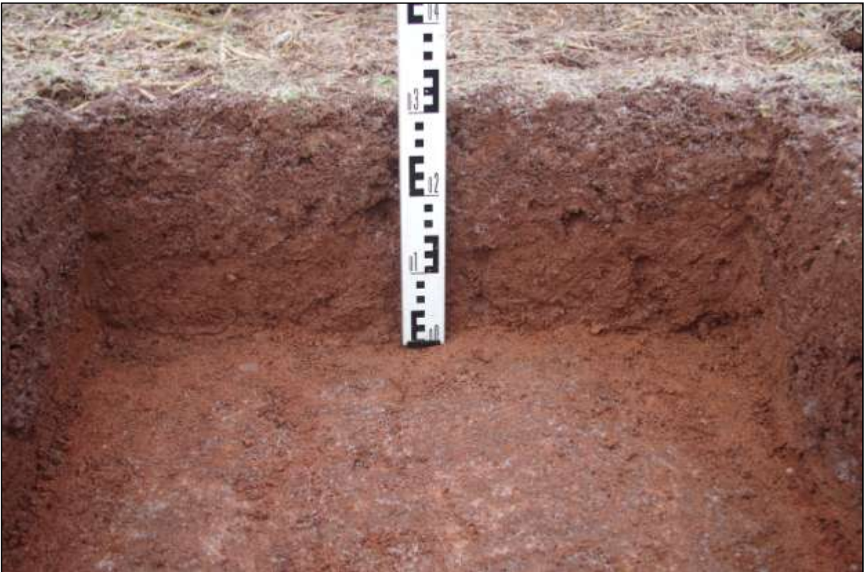
46. SOUTH-FACING SECTION OF TP#6; VIEWED FROM THE SOUTH.