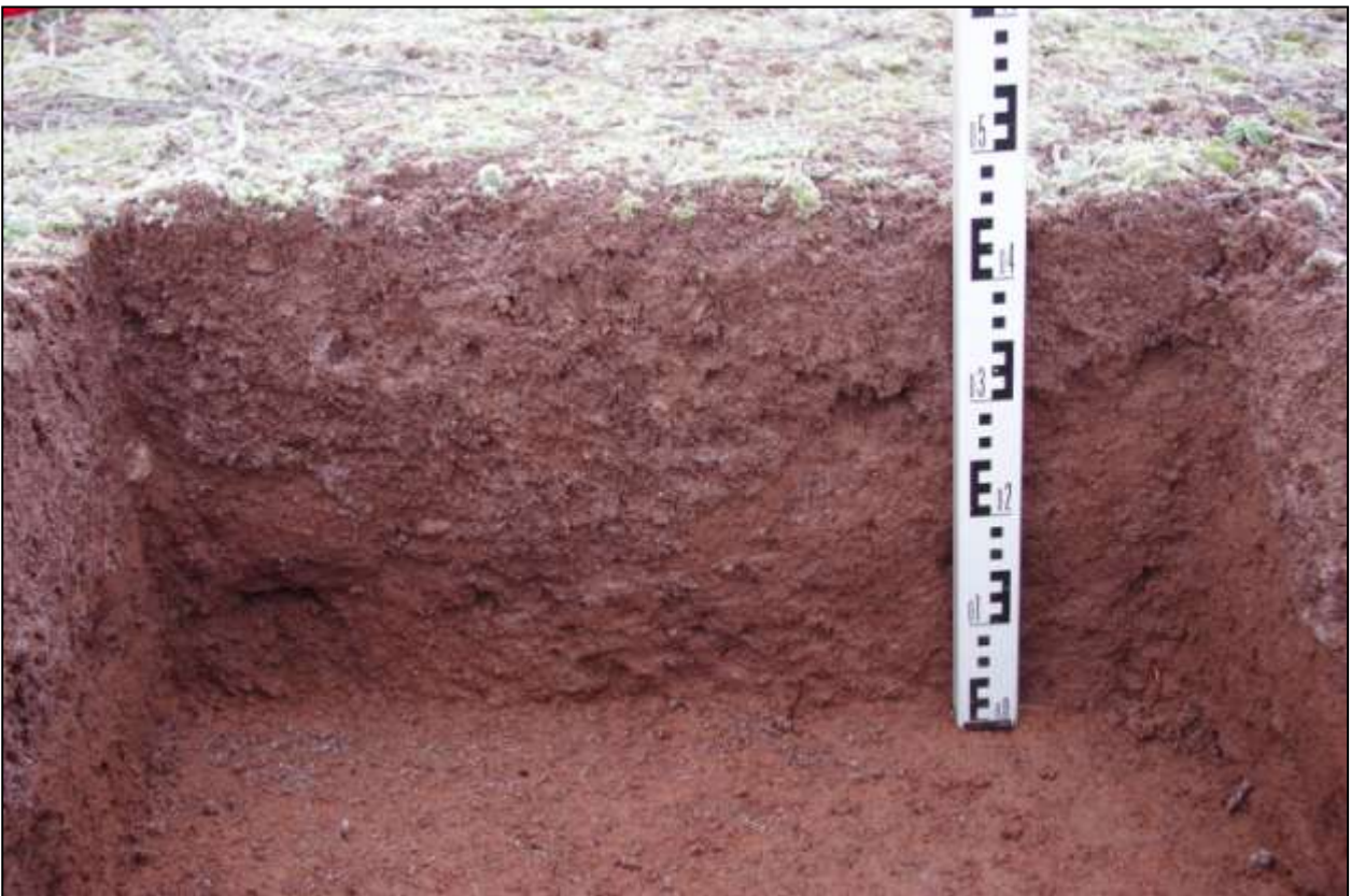
64. SOUTH-FACING SECTION OF TP#24; VIEWED FROM THE SOUTH.