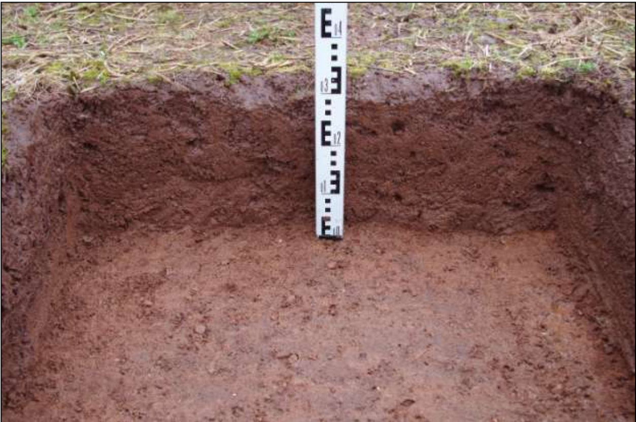
58. SOUTH-FACING SECTION OF TP#18; VIEWED FROM THE SOUTH.