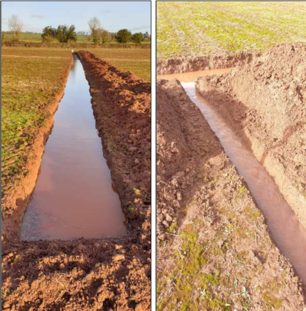
69. (LEFT) TRENCH #4 AFTER HEAVY RAIN; VIEWED FROM THE SOUTH.