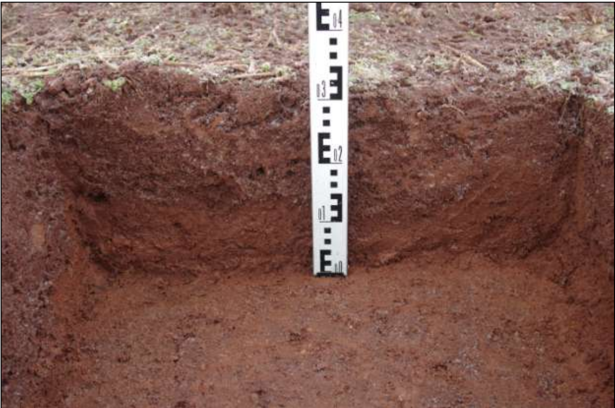
44. SOUTH-FACING SECTION OF TP#4; VIEWED FROM THE SOUTH.