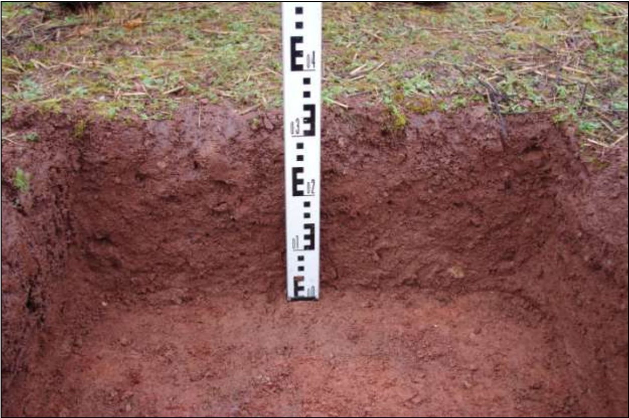
57. SOUTH-FACING SECTION OF TP#17; VIEWED FROM THE SOUTH.