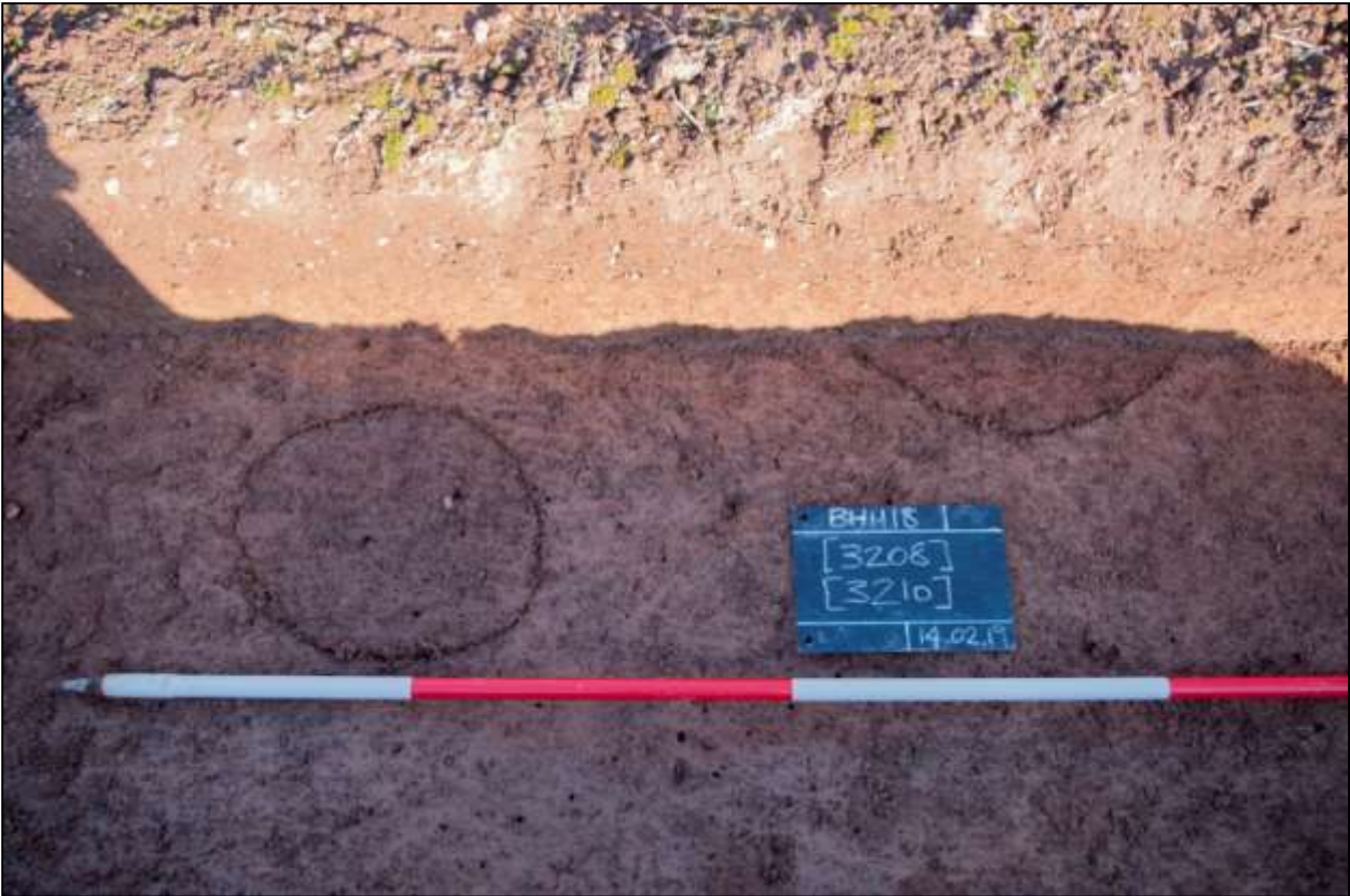
36. TRENCH #4, FEATURES [3208] AND [3210]; VIEWED FROM THE WEST (SCALE 2M).