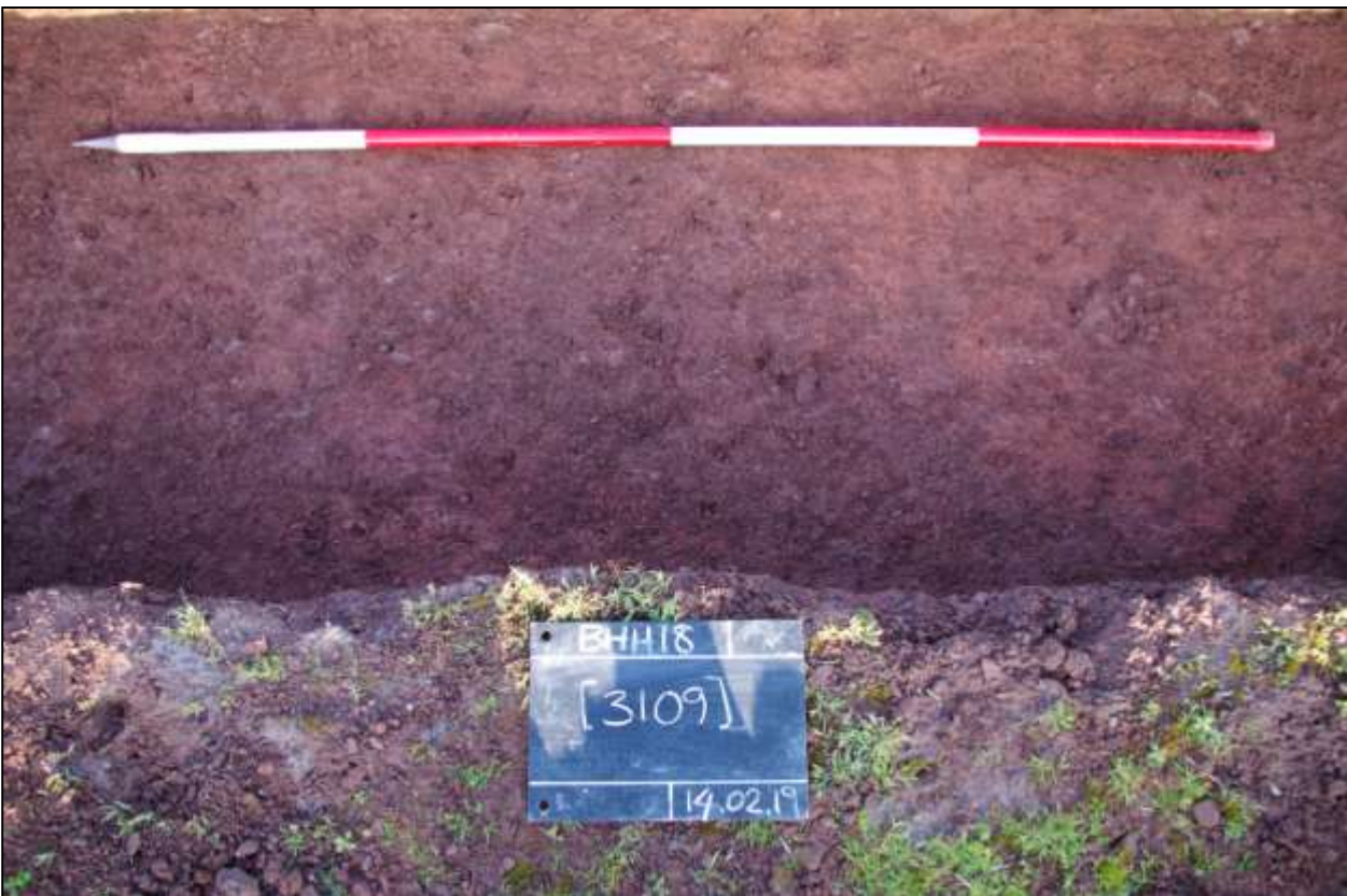
26. TRENCH #3, FEATURE [3109]; VIEWED FROM THE SOUTH-EAST (SCALE 2M).