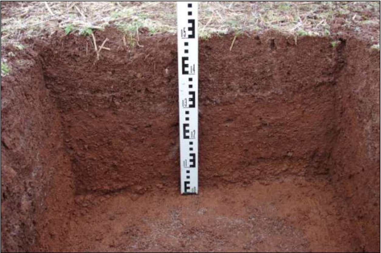
65. SOUTH-FACING SECTION OF TP#25; VIEWED FROM THE SOUTH.