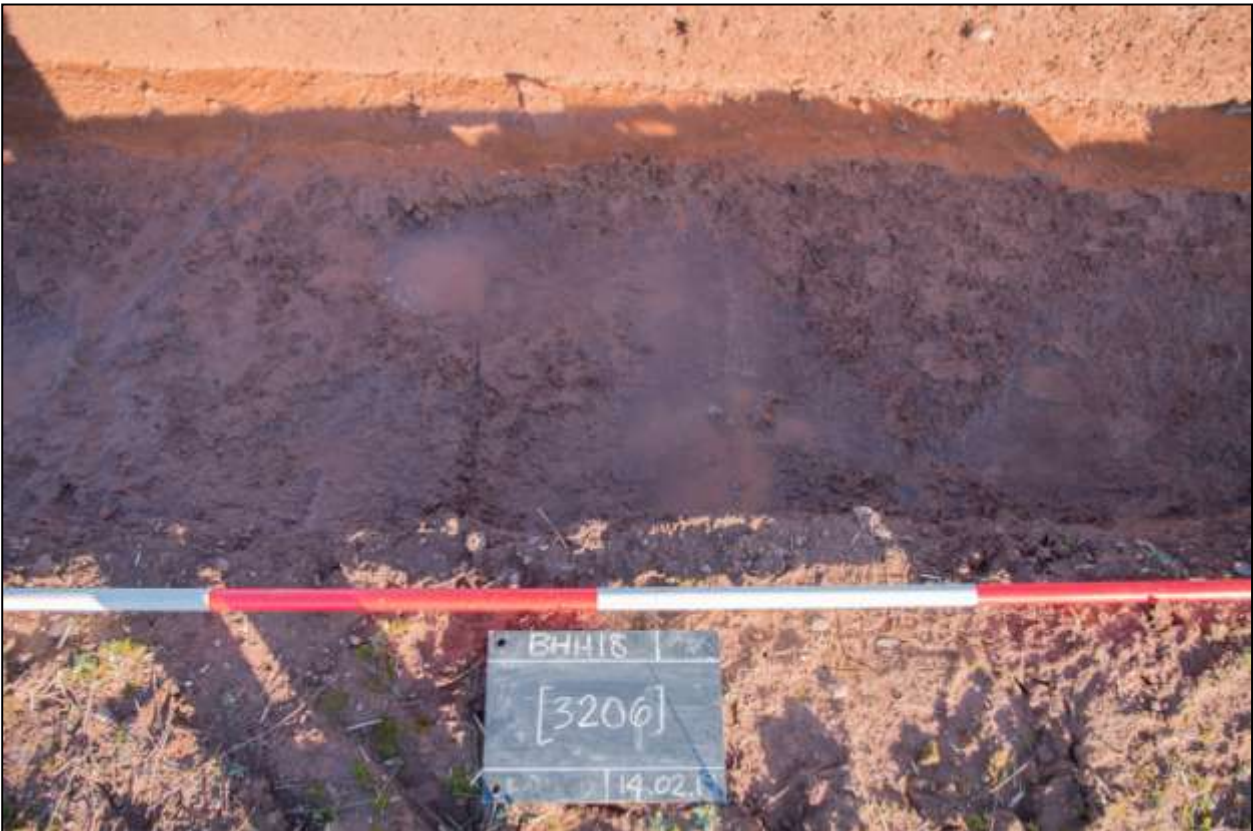
35. TRENCH #4, FEATURE [3206]; VIEWED FROM THE WEST (SCALE 2M).