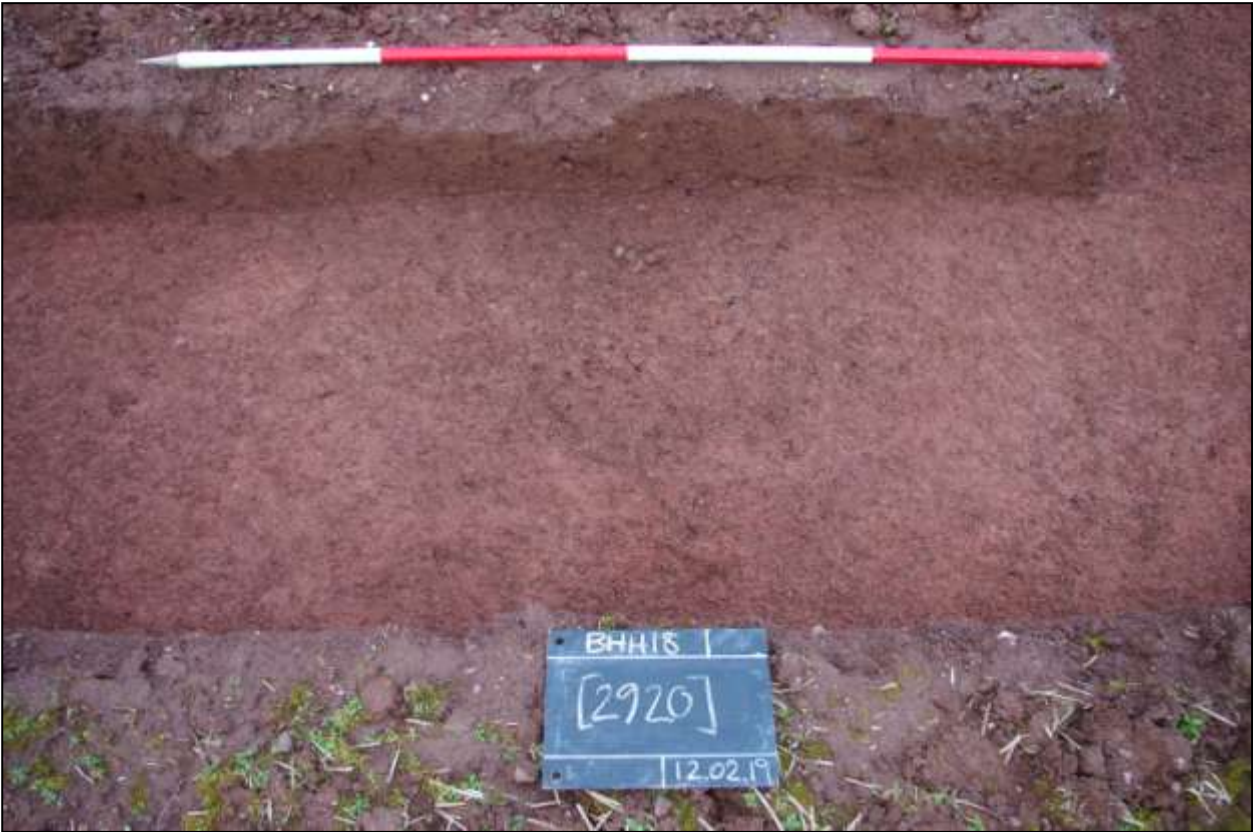
8. TRENCH #1, FEATURE [2920]; VIEWED FROM THE SOUTH (SCALE 2M).