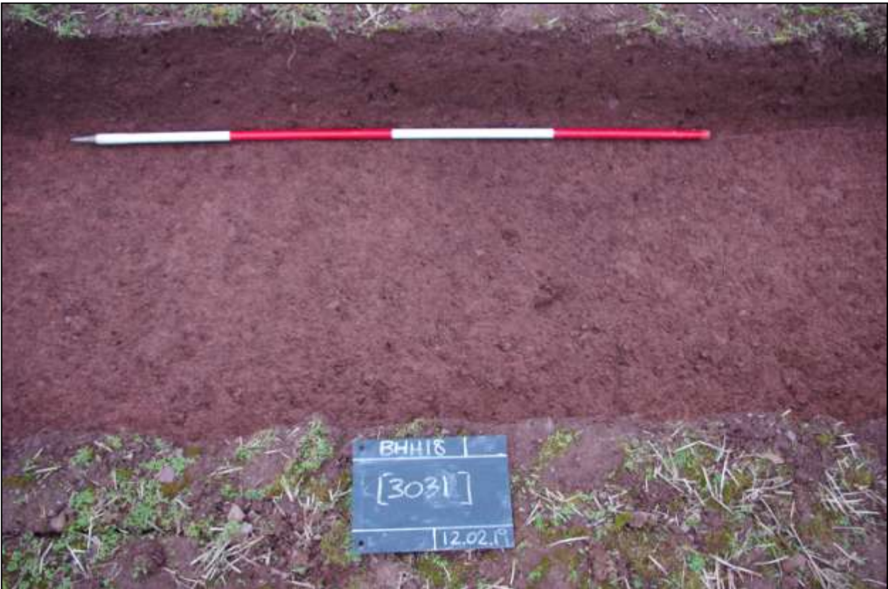
21. TRENCH #2, FEATURE [3031]; VIEWED FROM THE EAST (SCALE 2M).