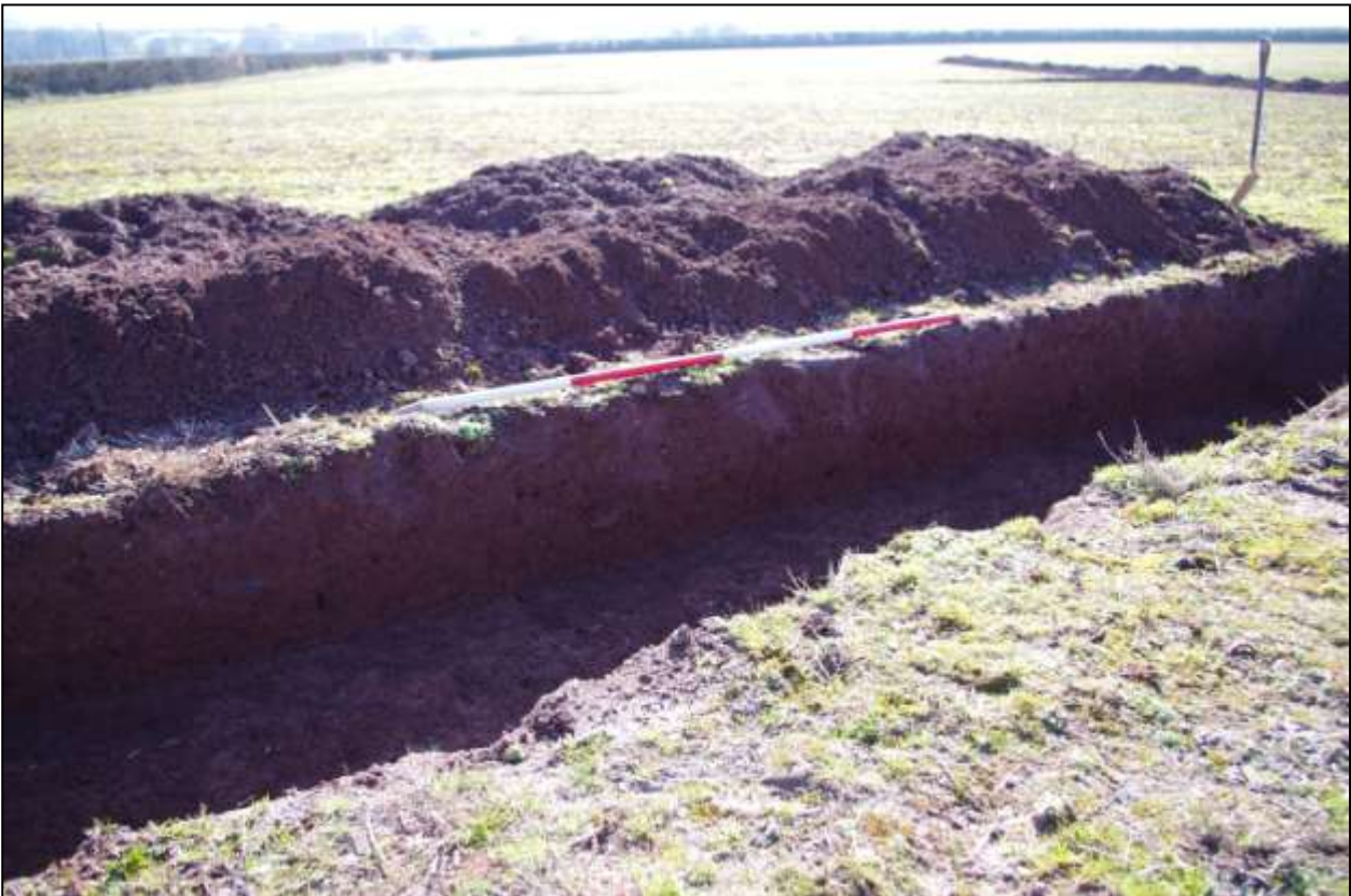
28. TRENCH #3, NORTH-WEST FACING SECTION AT THE WESTERN END, SHOWING LAYERS (3002) AND (3013); VIEWED FROM THE NORTH (SCALE 2M).