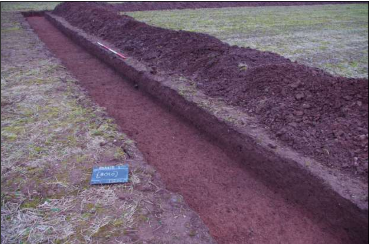
14. TRENCH #2, HENGE DITCH [3010]; VIEWED FROM THE NORTH-EAST (SCALE 2M).