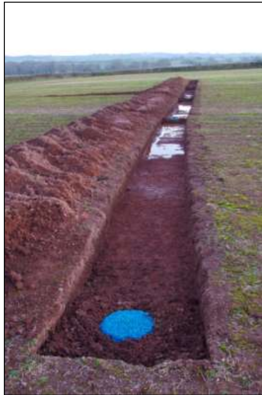
40. (RIGHT) TRENCH #4 WITH BLUE GLASS CHIPS IN PLACE; VIEWED FROM THE NORTH.