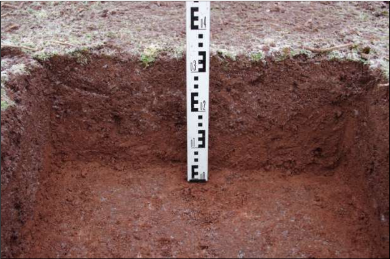
53. SOUTH-FACING SECTION OF TP#13; VIEWED FROM THE SOUTH.