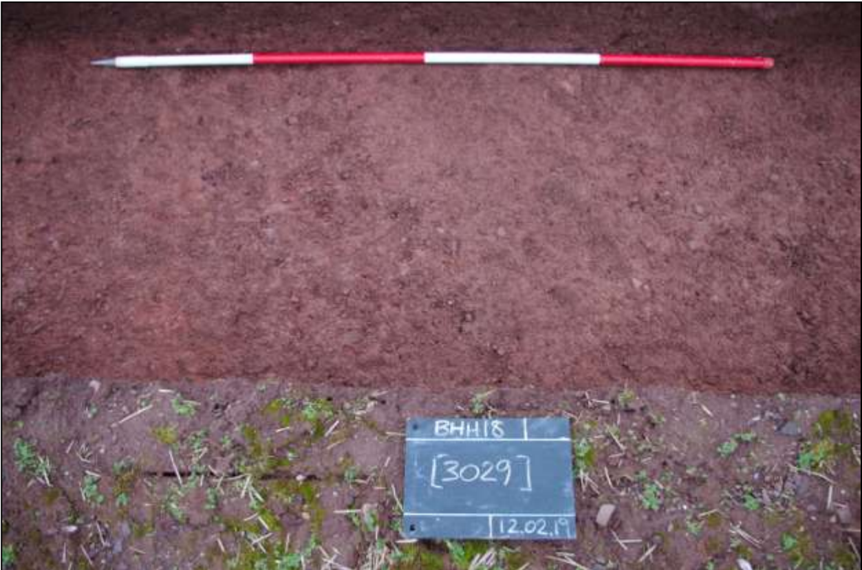
20. TRENCH #2, FEATURE [3029]; VIEWED FROM THE EAST (SCALE 2M).