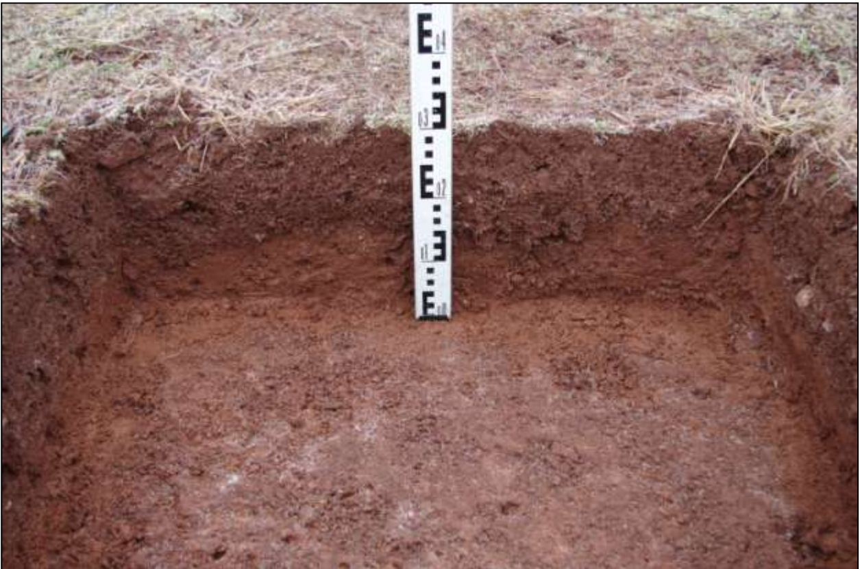
66. SOUTH-FACING SECTION OF TP#26; VIEWED FROM THE SOUTH.