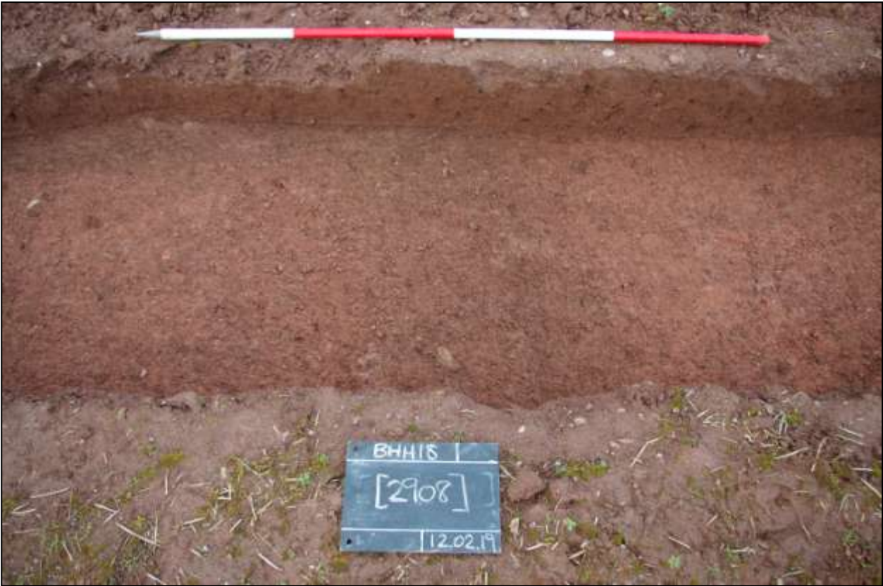
4. TRENCH #1, FEATURE [2908]; VIEWED FROM THE SOUTH (SCALE 2M).