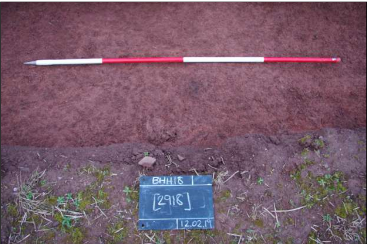
7. TRENCH #1, FEATURE [2918]; VIEWED FROM THE SOUTH (SCALE 2M).