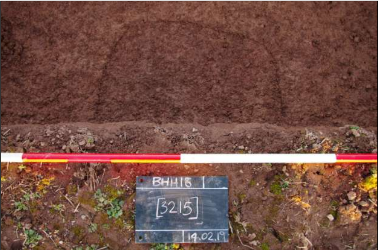
38. TRENCH #4, FEATURE [3215]; VIEWED FROM THE WEST (SCALE 2M).