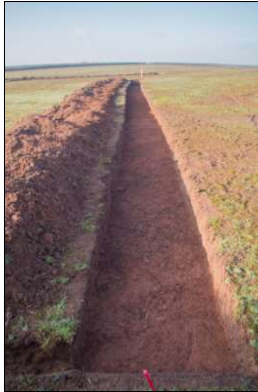
24. (LEFT) TRENCH #3, VIEWED FROM THE SOUTH-WEST (SCALE 2M). 25. (RIGHT) AS ABOVE, VIEWED FROM THE NORTH-EAST (SCALE 2M).