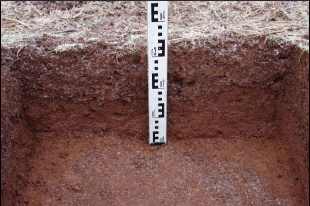
59. SOUTH-FACING SECTION OF TP#19; VIEWED FROM THE SOUTH.