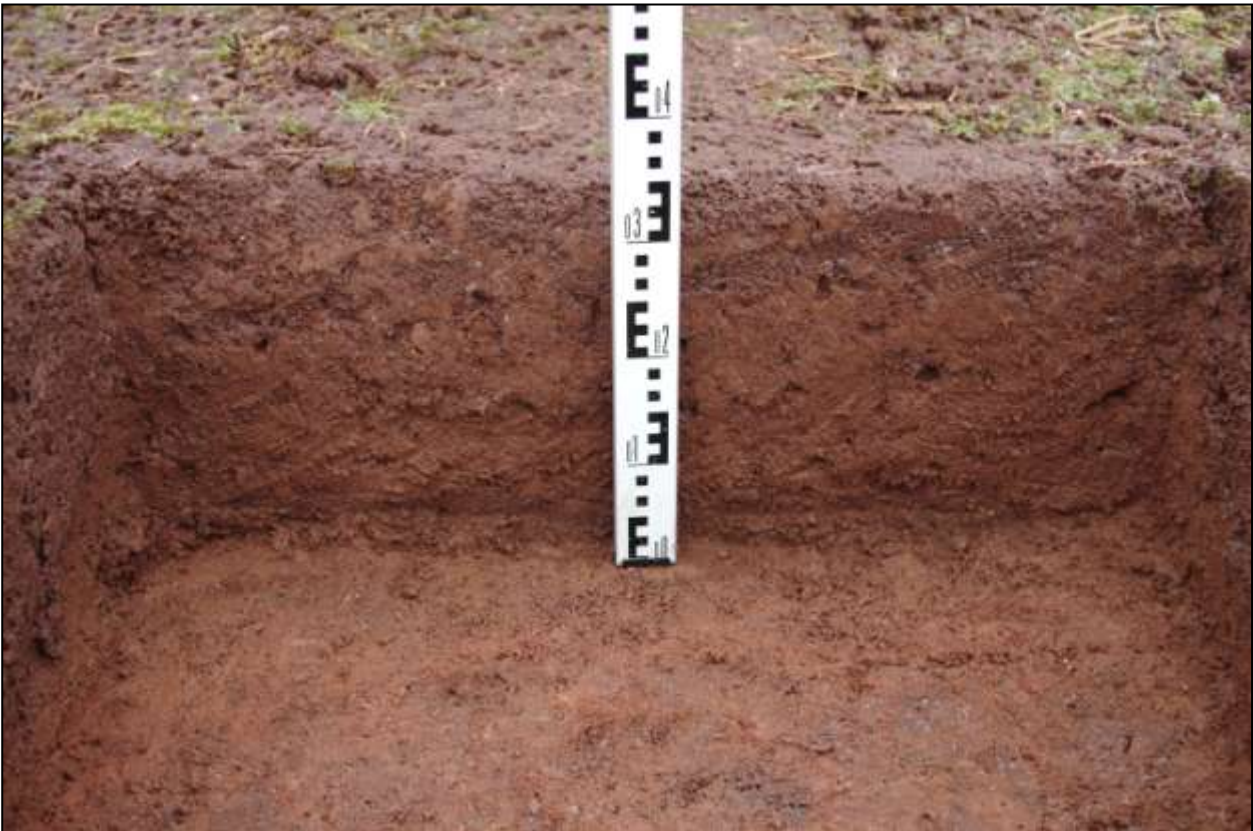
52. SOUTH-FACING SECTION OF TP#12; VIEWED FROM THE SOUTH.