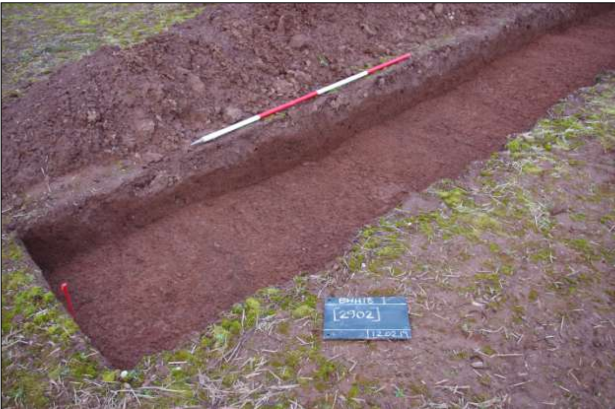
3. TRENCH #1, THE WESTERN END OVER THE TERMINUS OF THE HENGE DITCH [2902]; VIEWED FROM THE SOUTH-WEST (SCALE 2M).