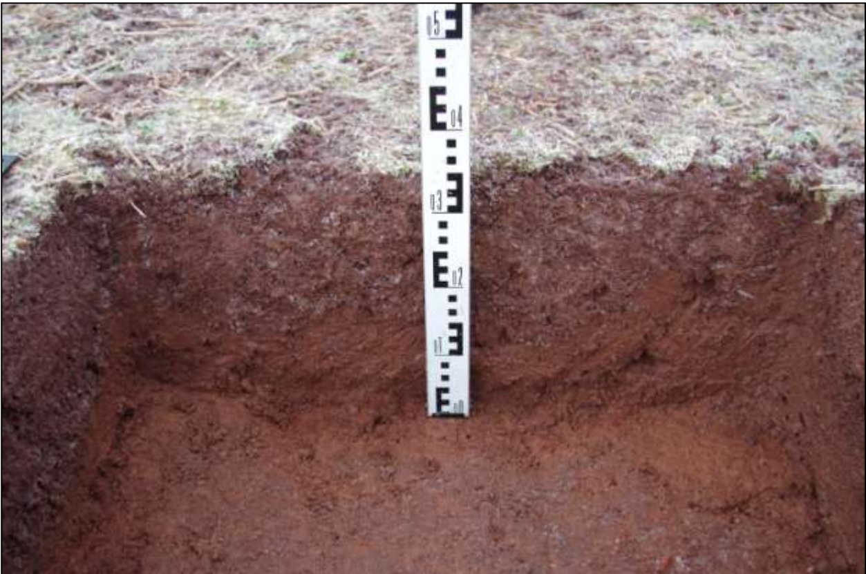
54. SOUTH-FACING SECTION OF TP#14; VIEWED FROM THE SOUTH.