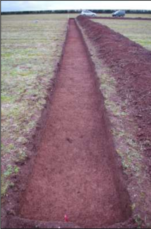
11. TRENCH #2, VIEWED FROM THE NORTH (SCALE 2M).