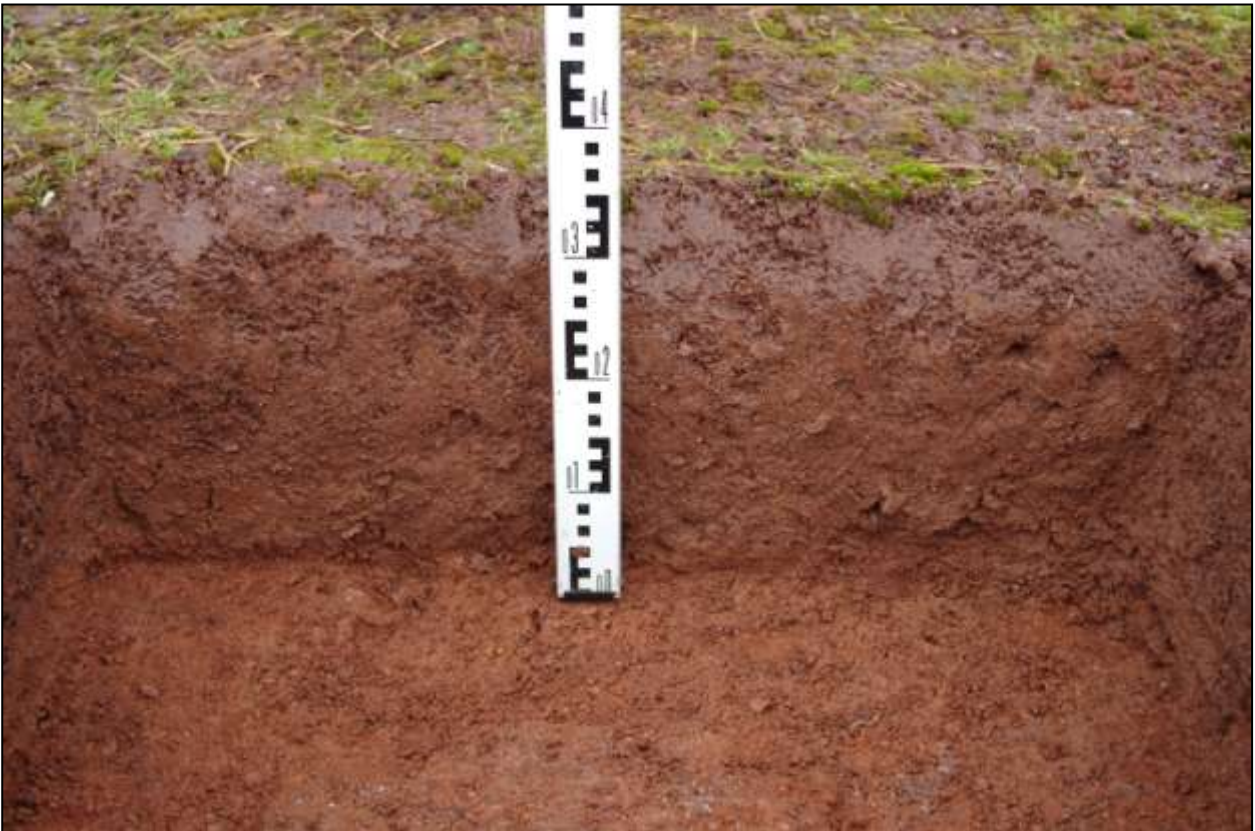
56. SOUTH-FACING SECTION OF TP#16; VIEWED FROM THE SOUTH.