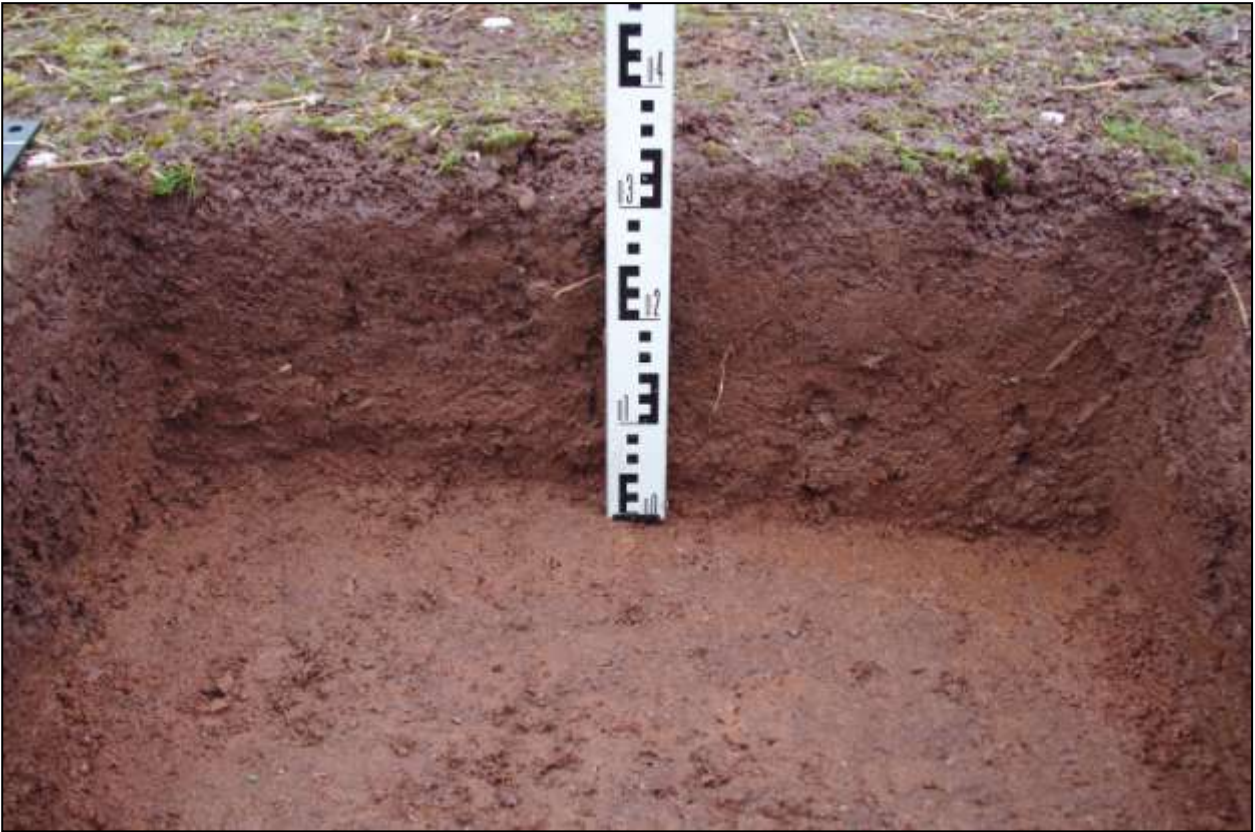
55. SOUTH-FACING SECTION OF TP#15; VIEWED FROM THE SOUTH.