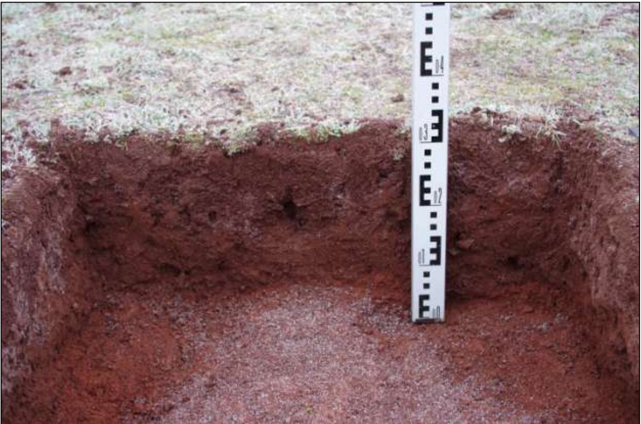
68. SOUTH-FACING SECTION OF TP#28; VIEWED FROM THE SOUTH.