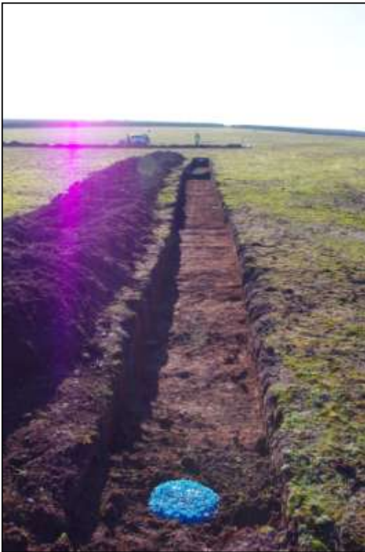
39. (LEFT) TRENCH #3 WITH BLUE GLASS CHIPS IN PLACE; VIEWED FROM THE NORTH-EAST.