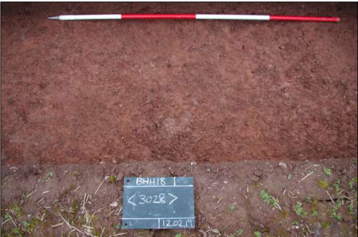
18. TRENCH #2, GROUP <3028>; VIEWED FROM THE EAST (SCALE 2M).