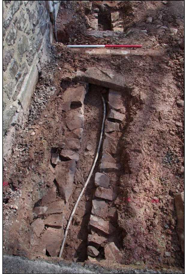
LEFT FIGURE 2: STONE DRAIN {106} RUNNING ALONG THE WEST SIDE OF THE VILLAGE HALL; VIEWED FROM THE NORTH (SCALE 1M). RIGHT: FIGURE 3: AS ABOVE, WITH THE CAPPING STONES REMOVED AND SHOWING THE BLACK ALKATHENE WATER PIPE.