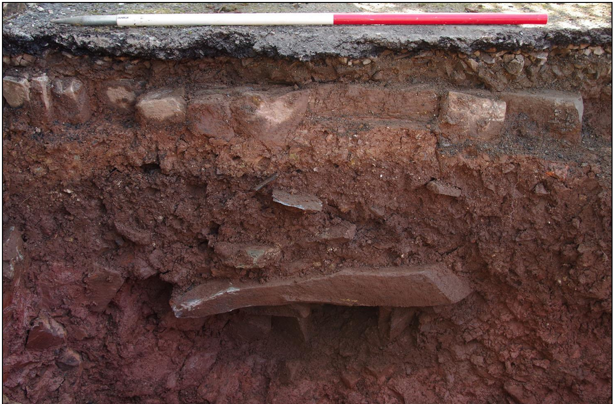
FIGURE 4: NORTH-FACING SECTION OF STONE DRAIN {106} (SCALE 1M).