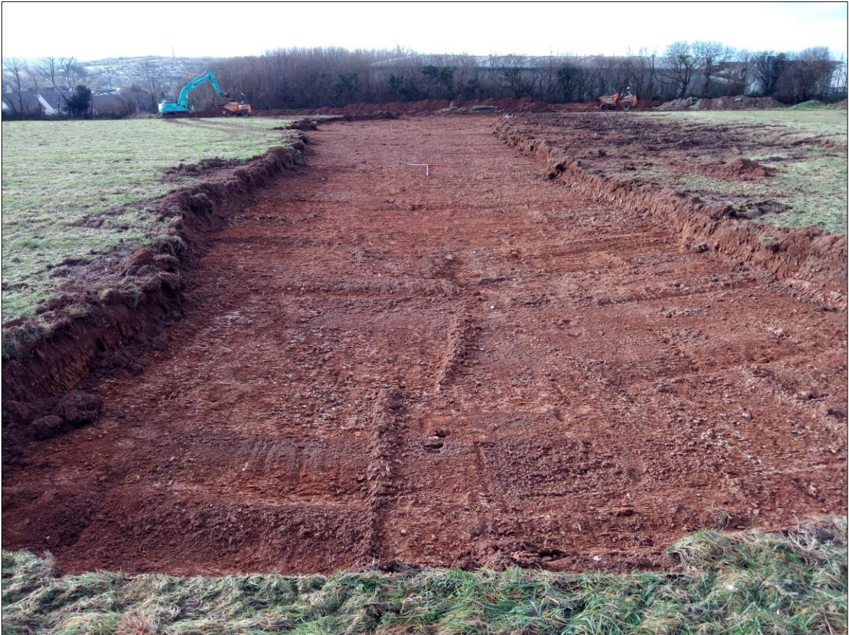
FIGURE 3: PLAN OF THE SITE; FROM THE EAST (1M + 2M SCALE).