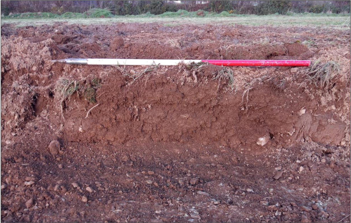
FIGURE 2: SOUTH-EAST FACING SAMPLE SECTION; FROM THE SOUTH-EAST (1M SCALE).