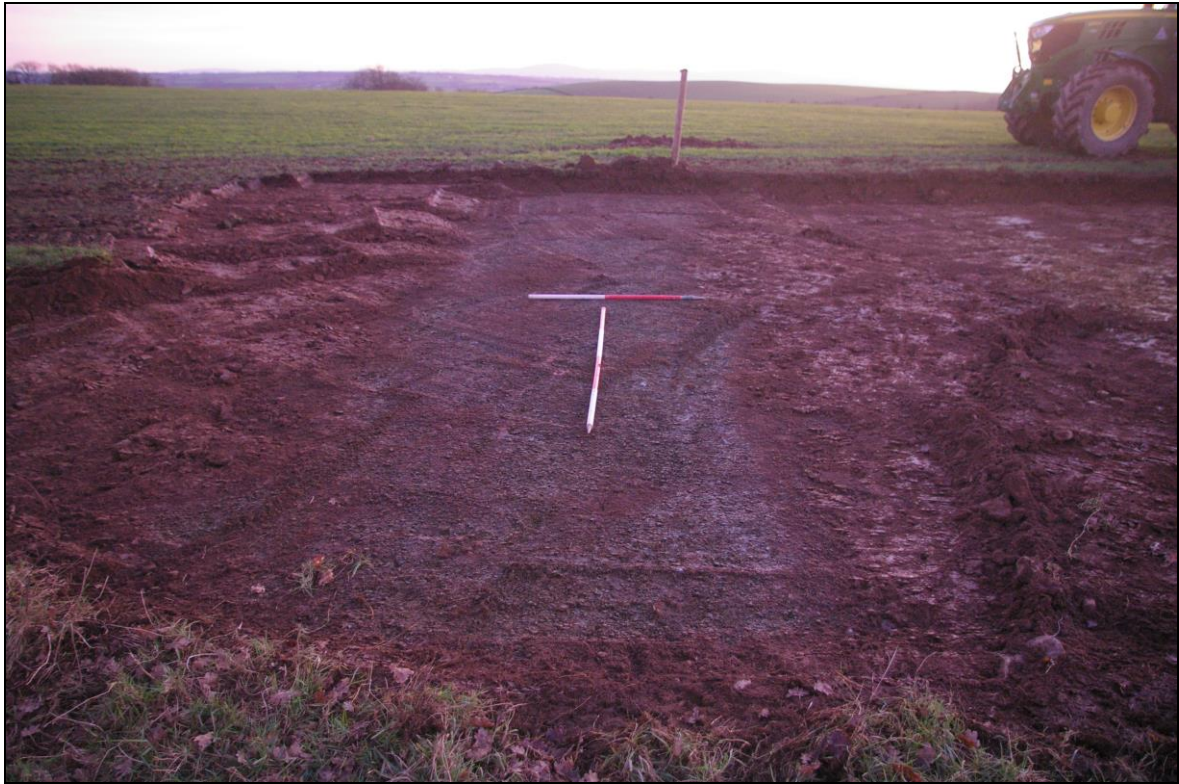
FIGURE 2: ROAD [110]; VIEWED FROM THE NORTH-NORTH-EAST (1M & 2M SCALES).