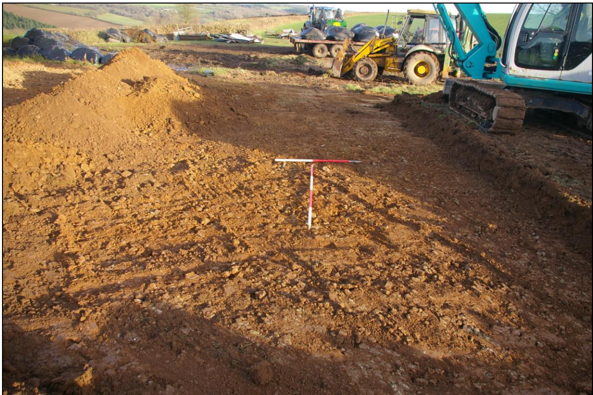
FIGURE 3: GENERAL SITE SHOT, MID-EXCAVATION; VIEWED FROM THE WEST (1M & 2M SCALES).