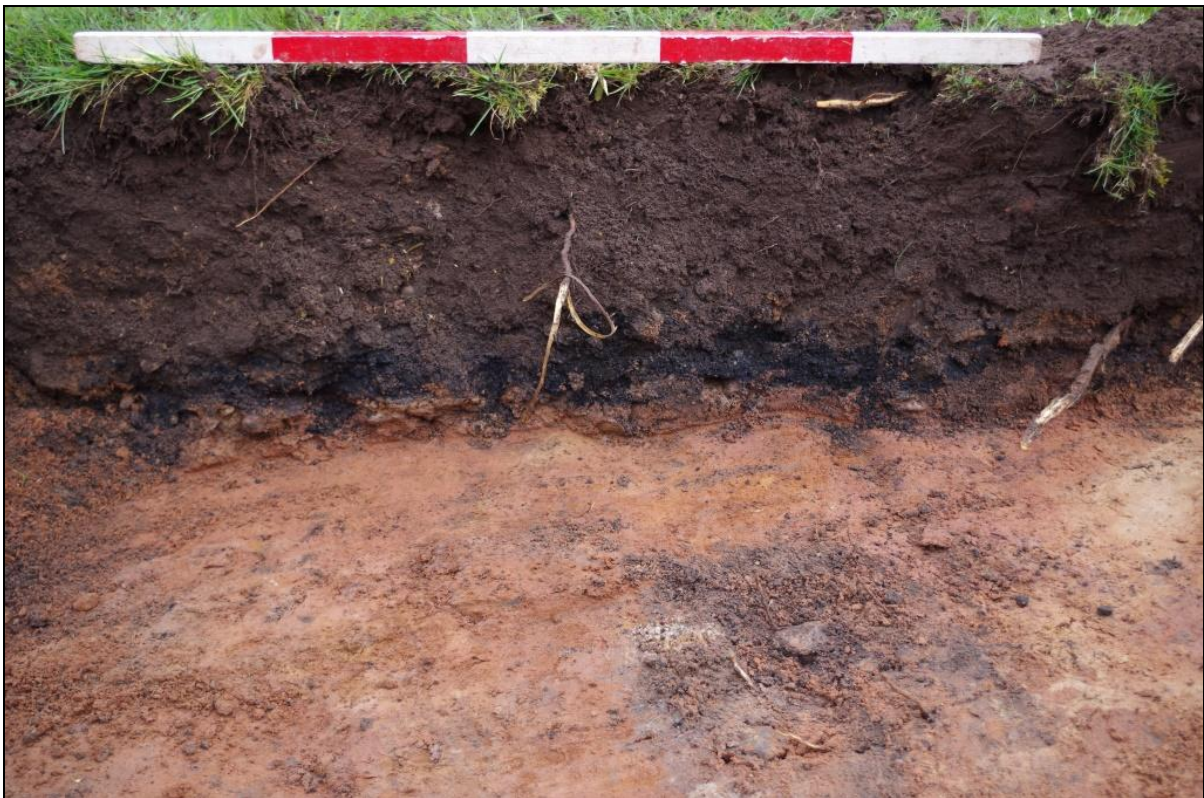
FIGURE 3: SOUTH FACING SAMPLE SECTION, VIEWED FROM THE SOUTH (1M SCALE).