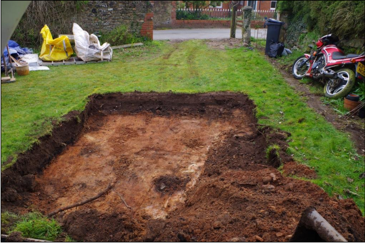
FIGURE 2: POST-EX SHOT, VIEWED FROM THE WEST (NO SCALE).