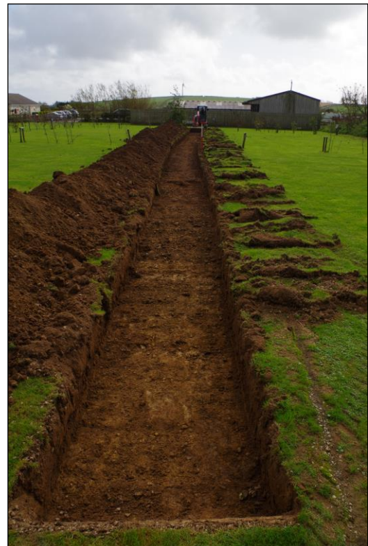
Figure 3: (left) Trench 03, post-excavation; viewed from the east-south-east (1m scale).