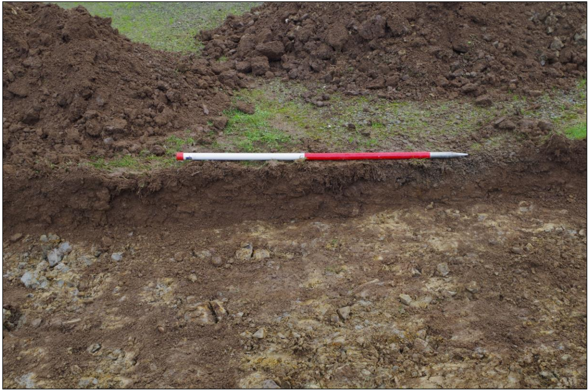
Figure 2: Trench 02, representative south-west facing; viewed from the south-west (1m scale).