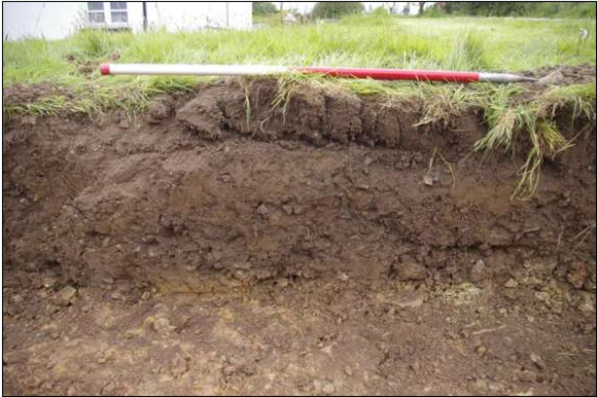
FIGURE 2: NORTH FACING REPRESENTATIVE SITE SECTION; VIEWED FROM THE NORTH (1M SCALE).