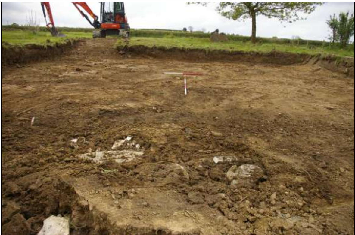
FIGURE 3: AREA 01 POST-EXCAVATION; VIEWED FROM THE EAST (1M & 2M SCALES).