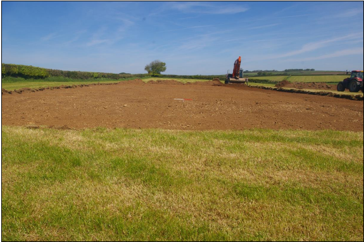
FIGURE 2: AREA 01 POST-EXCAVATION; VIEWED FROM THE SOUTH (1M & 2M SCALES).