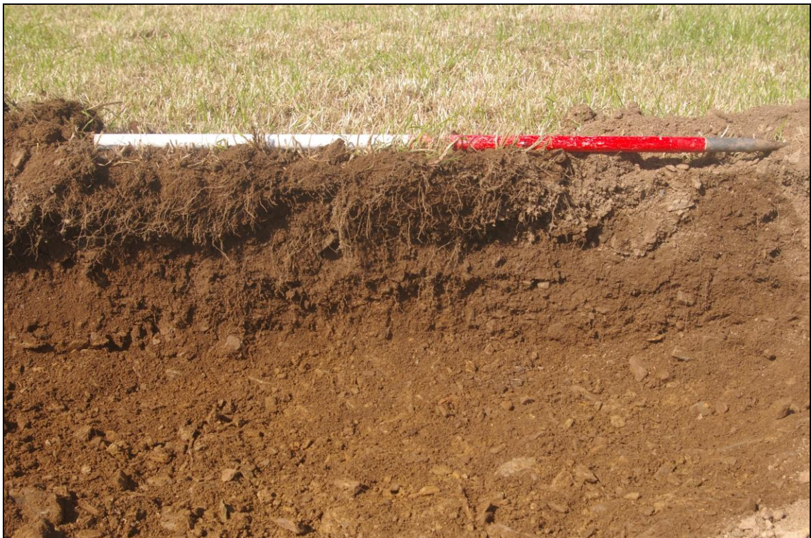
FIGURE 3: AREA 01, REPRESENTATIVE SECTION; VIEWED FROM THE EAST-NORTH-EAST (1M SCALE).