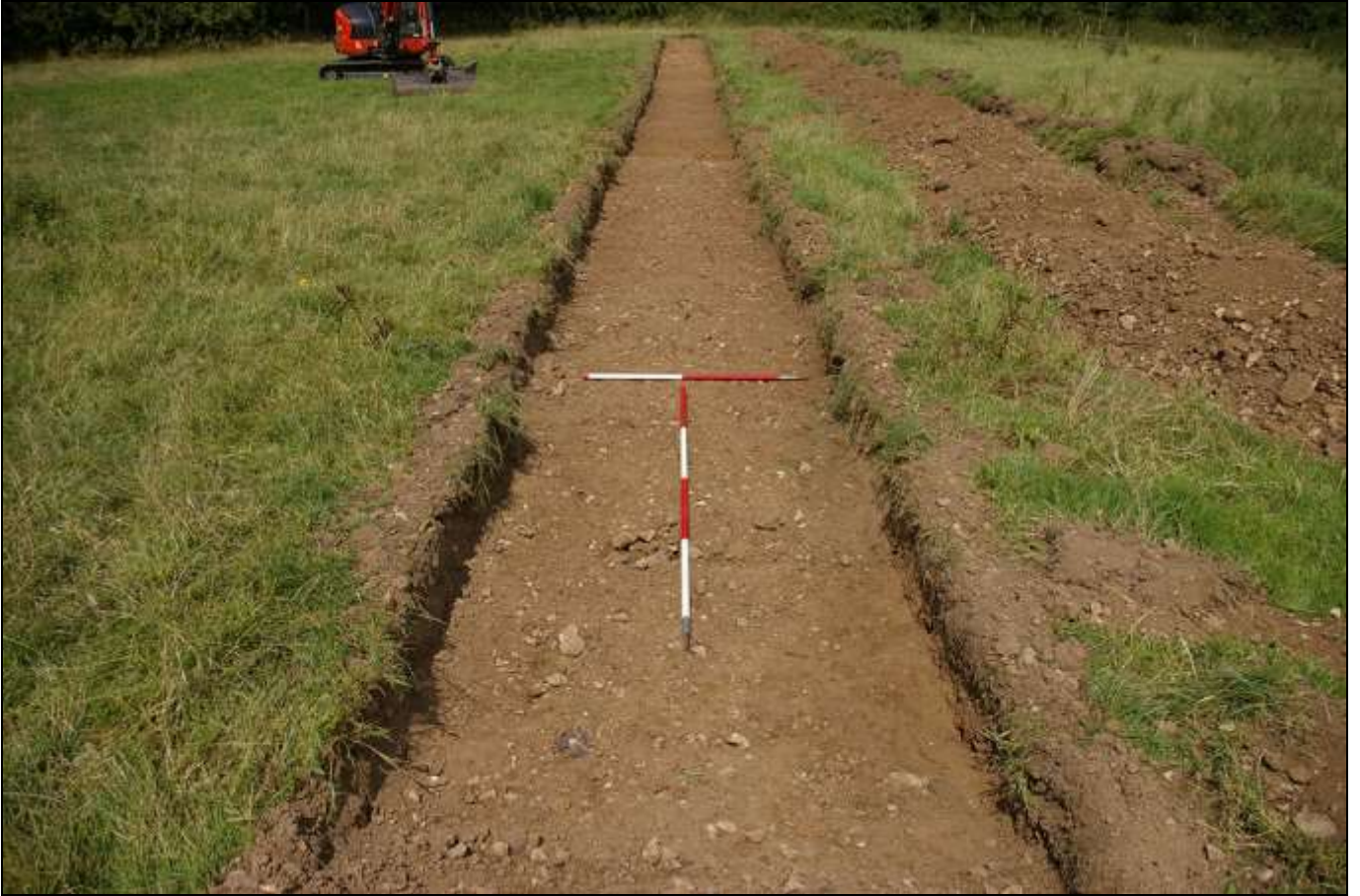
FIGURE 2: VIEW OF THE WHOLE TRENCH, FACING NORTH (1M & 2M SCALES).