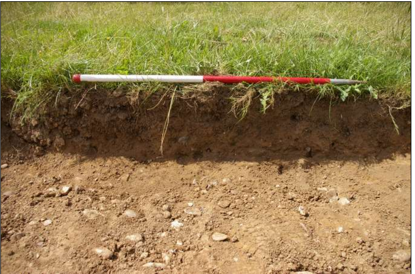
FIGURE 3: SAMPLE SECTION AT NORTH END OF TRENCH (1M SCALE).