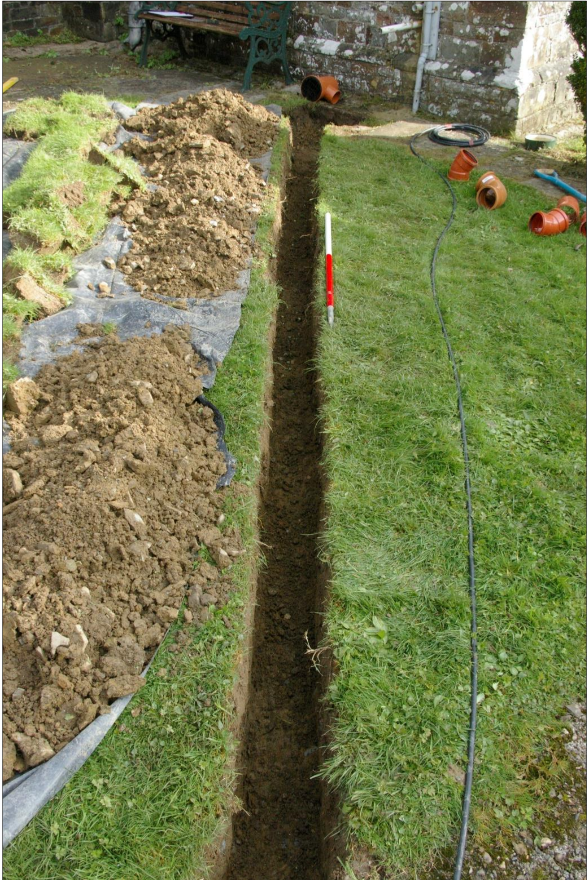
FIGURE 2: EXCAVATED TRENCH WITH DRILLED HOLES IN BACKGROUND; FROM THE SOUTH-WEST (1M SCALE).