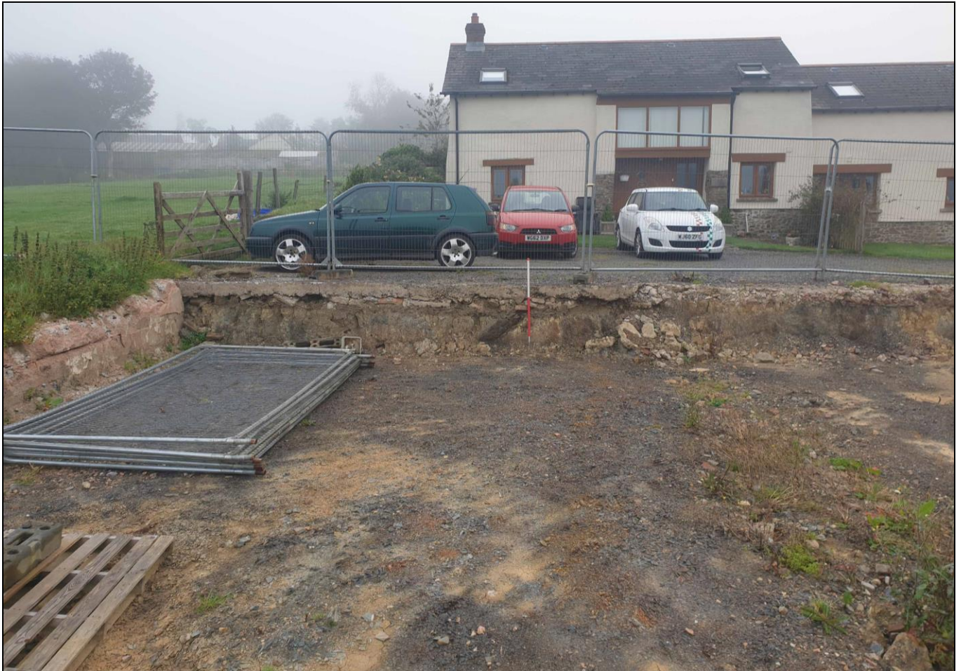
FIGURE 2: POST-EX SHOT OF THE NORTHERN PART OF THE SITE; VIEWED FROM THE EAST (1M SCALE).