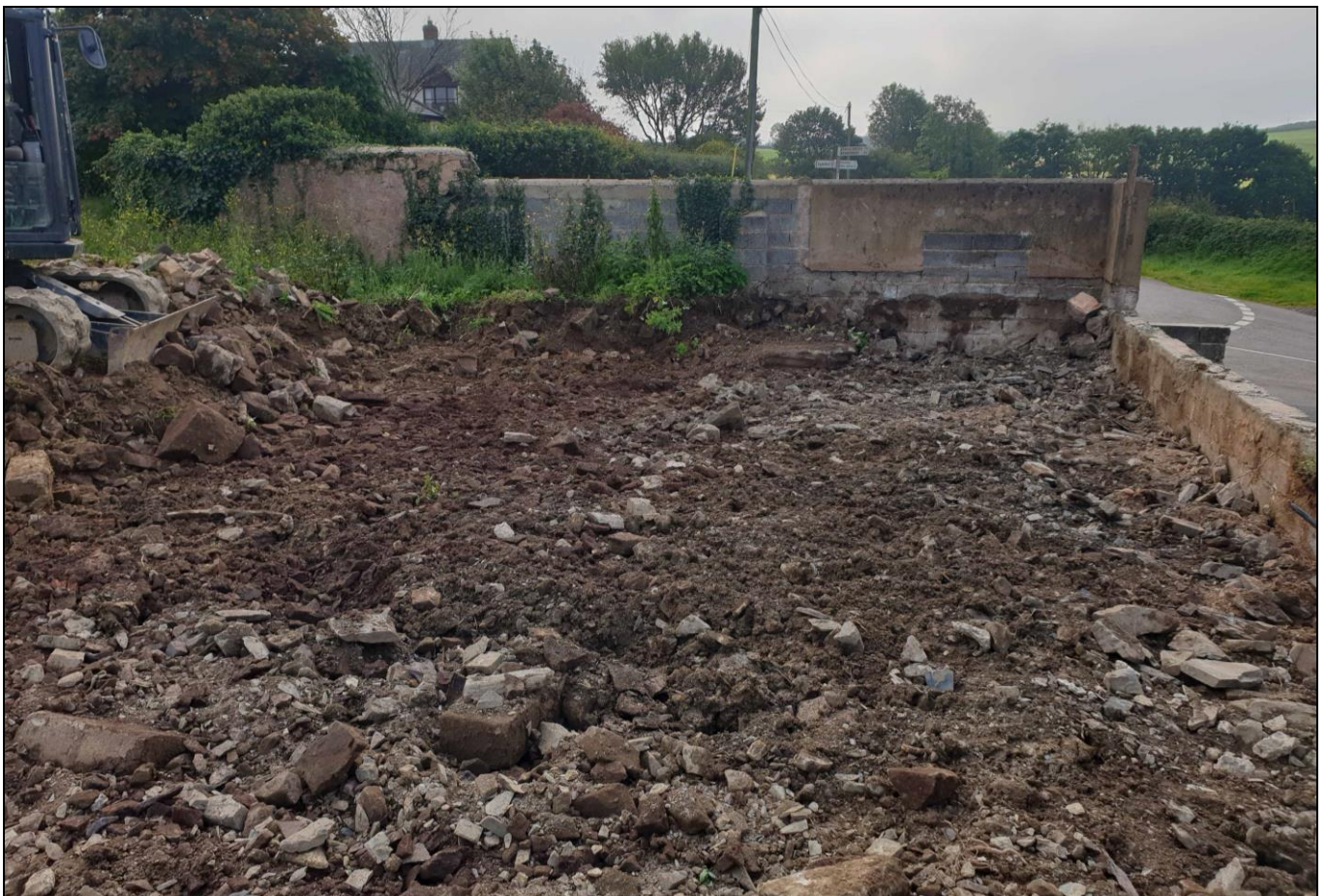
FIGURE 3: THE MADE-GROUND DEPOSIT TO THE EASTERN SIDE OF THE SITE; VIEWED FROM THE NORTH (NO SCALE).