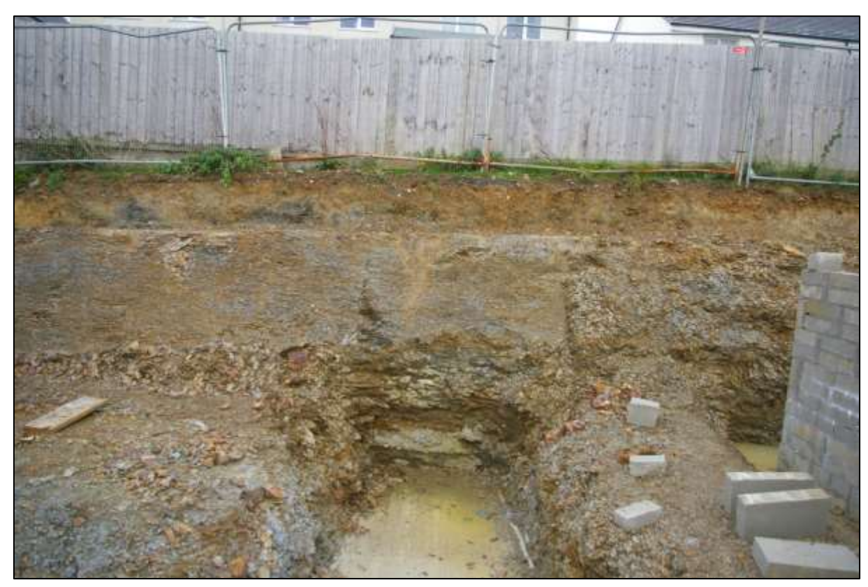
3. DETAIL OF EXCAVATED FOUNDATION TRENCHES DEMONSTRATING THIN LAYERS OF TOPSOIL AND SUBSOIL OVERLYING NATURAL BEDROCK; VIEWED FROM THE SOUTH.