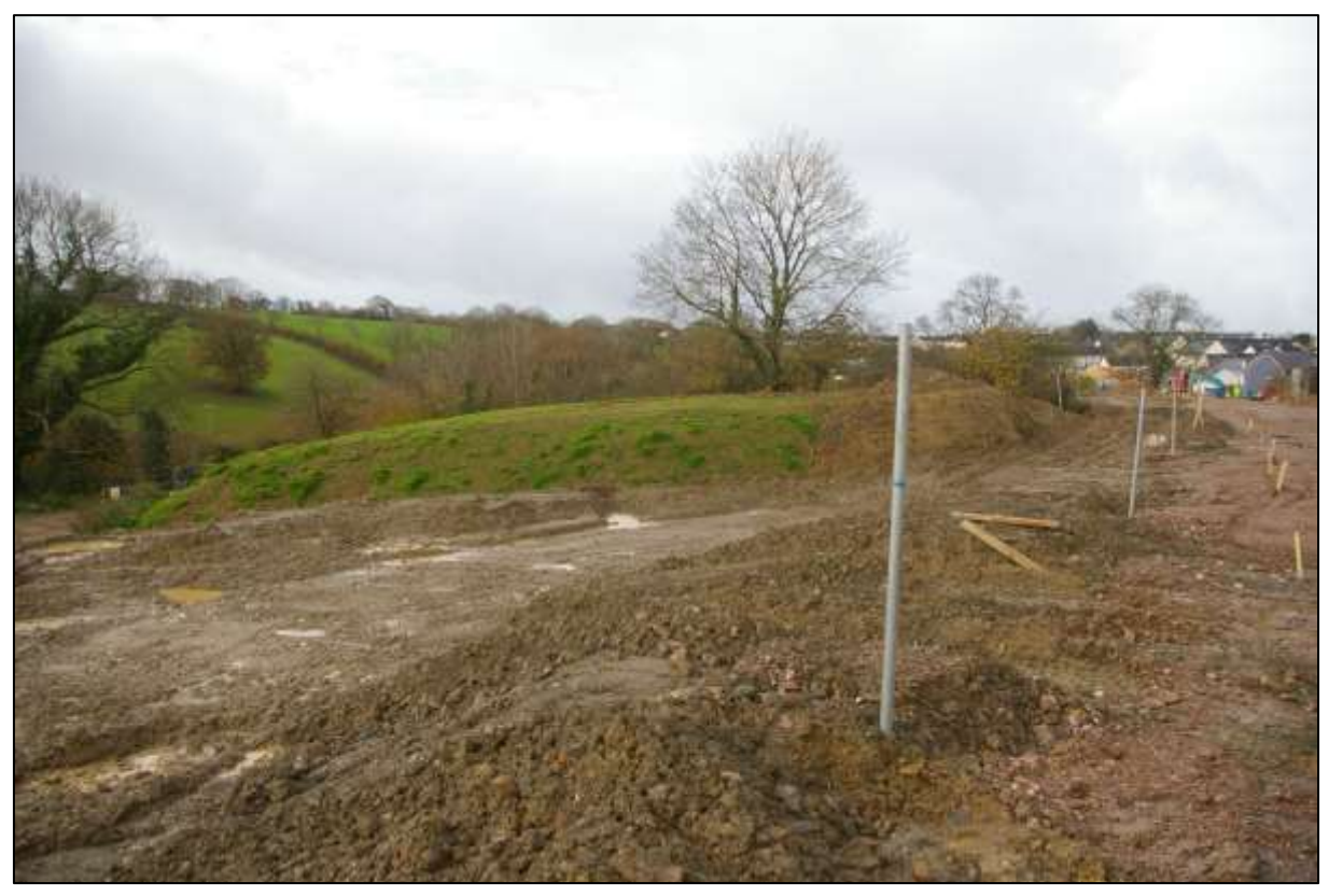
7. DETAIL OF ONE OF THE SPOIL STORAGE AREAS TO THE SOUTH OF THE ROAD STRIP; VIEWED FROM THE NORTH-EAST.