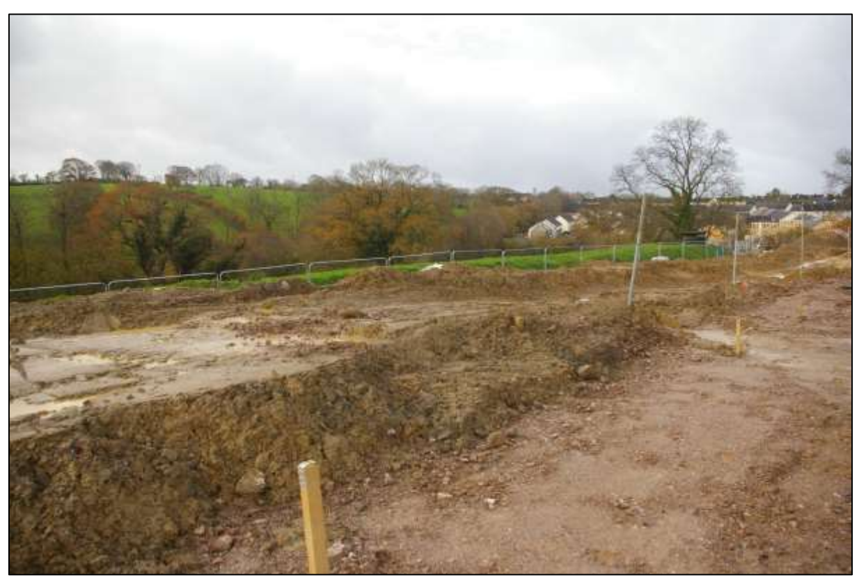
6. \quad \text{Detail of the made ground to the south of the road strip; viewed from the north-east. } \\