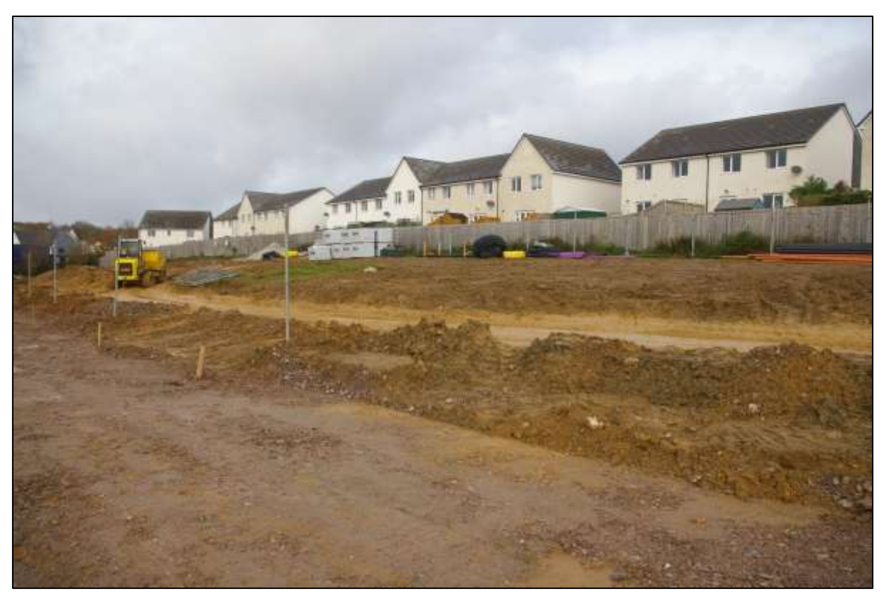
4. VIEW OF THE UN-STRIPPED AREA ALONG THE NORTHERN BOUNDARY OF THE SITE; VIEWED FROM THE SOUTH-EAST.