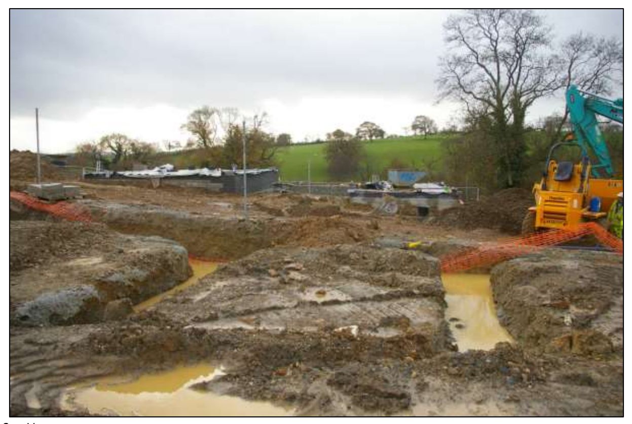
2. VIEW ACROSS AREAS OF ALREADY EXCAVATED HOUSE PLOTS AT THE WESTERN END OF THE SITE; VIEWED FROM THE NORTH.