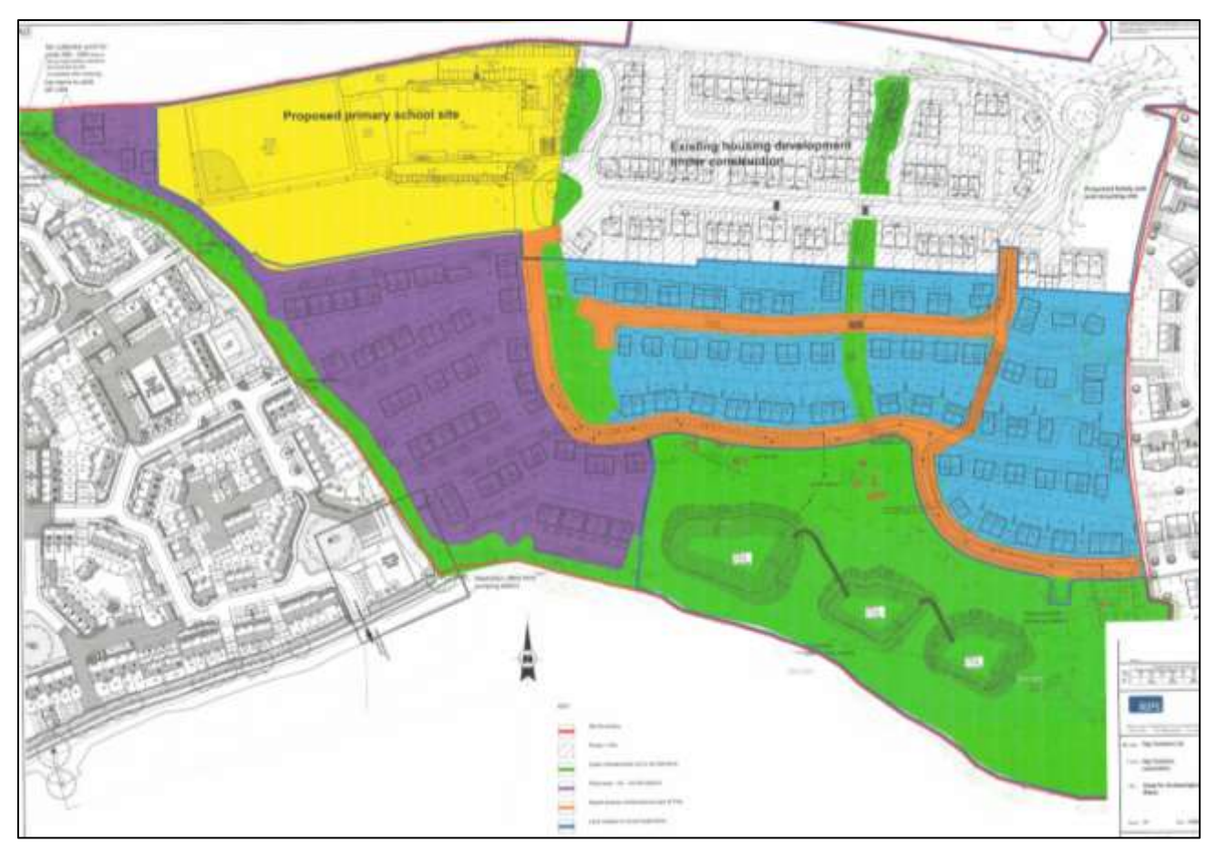
FIGURE 1: SITE PLAN. THE AREA SHOWN IN BLUE IS THE PART OF THE SITE RELELVANT TO THIS REPORT.

South West Archaeology Ltd. (SWARCH) was commissioned by a Private Client to undertake a site visit on land at Hay Common, south of Hay Parc, Launceston under the conditions of the Written Scheme of Investigation (Valentin 2015) to establish the level of potential survival of archaeological remains following the commencement of ground works associated with a secondary phase of residential development (hereafter 'the site'). A geophysical survey had been previously carried out across the wider development area (Sabin & Donaldson 2010) identifying a series of curving linear anomalies indicating former (possibly medieval) field boundary divisions associated with historic agriculture; as well as several further anomalies which may or may not be natural in origin. No records for other archaeological work across the site have been established although it is presumed that the phase 1 development area was subject to the required watching brief. This Phase 1 works may have included monitoring of works in some of the Phase 2 area as it had been stripped, at least in part, presumably during compond construction and of material storage.