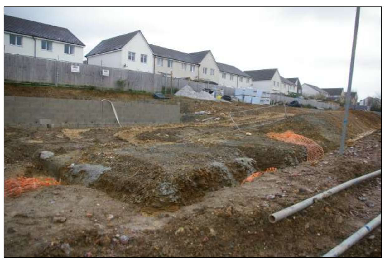
1. VIEWS ACROSS AREAS OF ALREADY EXCAVATED HOUSE PLOTS TOWARDS THE NORTH-WEST CORNER OF THE SITE; VIEWED FROM THE SOUTH-WEST.