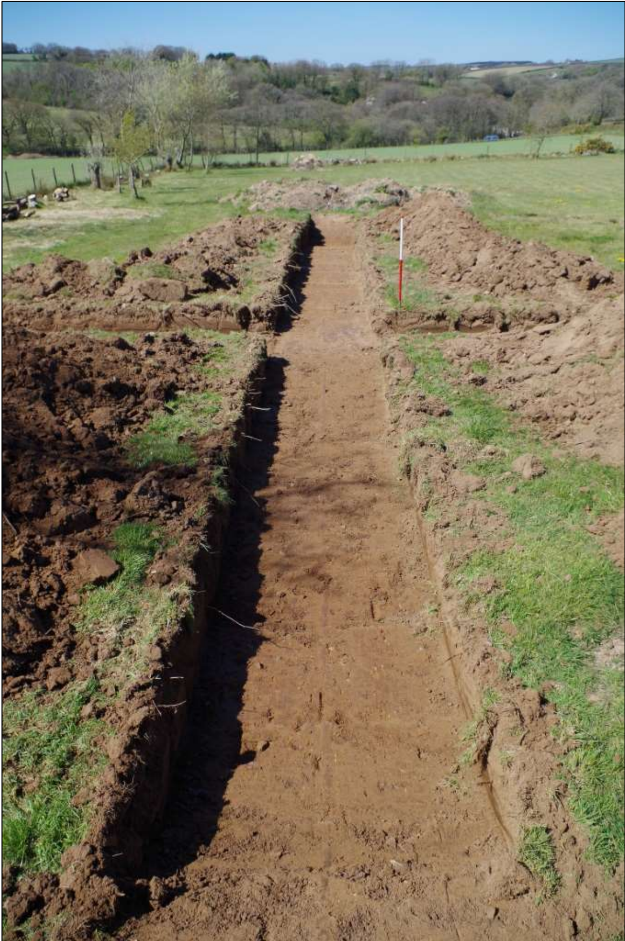
FIGURE 2: TRENCHES VIEWED FROM THE EAST (1M SCALE).