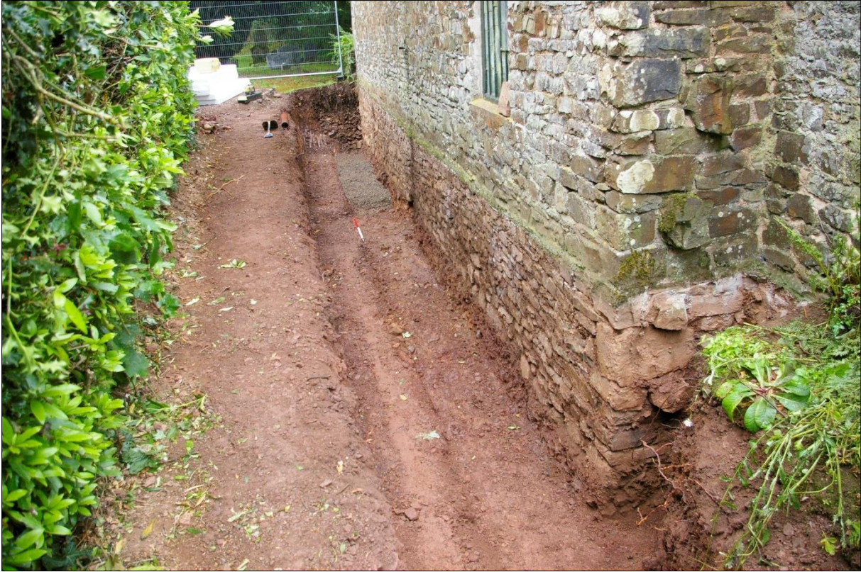
FIGURE 2: EXCAVATED TRENCH; FROM THE WEST (1M SCALE).