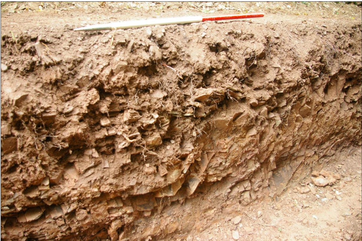
FIGURE 3: SAMPLE TRENCH SECTION; FROM THE SOUTH-WEST (1M SCALE).