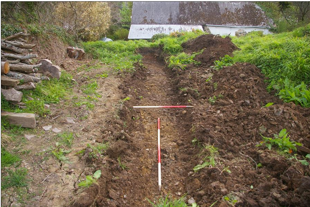
FIGURE 3: TRENCH 01, POST-EXCAVATION SHOWING LIMITED DEPTH OF TOPSOIL ACROSS PARTS OF THE SITE; VIEWED FROM THE SOUTH-WEST (1M & 2M SCALES).