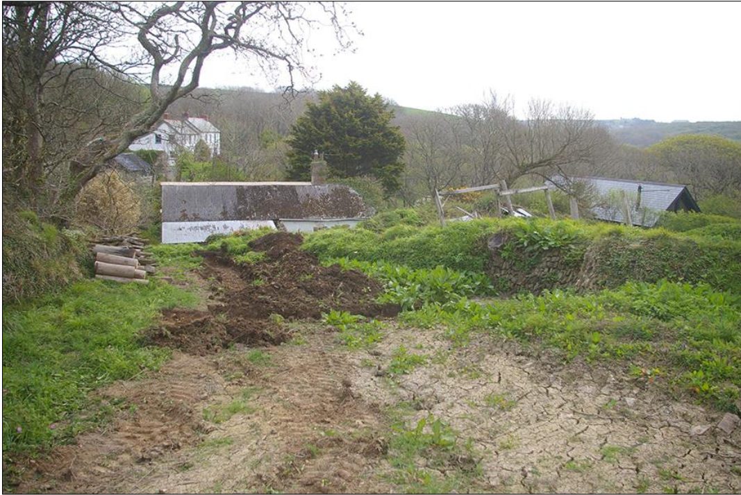
FIGURE 2: VIEW ACROSS THE AREA OF THE PROPOSED NEW BUILD; VIEWED FROM THE SOUTH-WEST (NO SCALE).