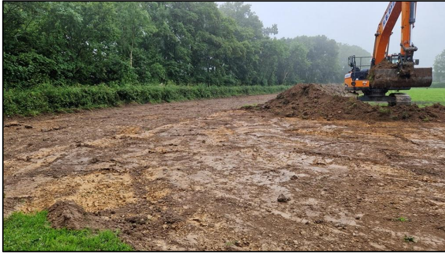
FIGURE 3: EXCAVATED AREA, VIEWED FROM THE NORTH-WEST (NO SCALE).