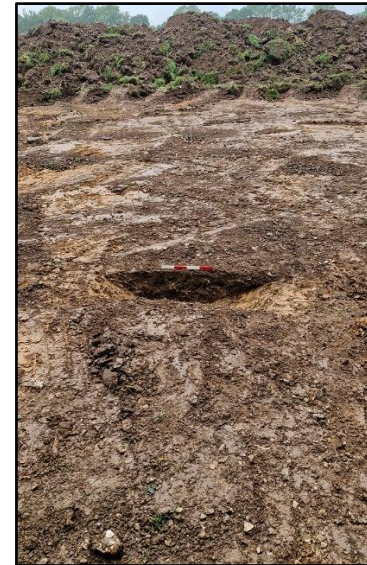
FIGURE 6: PLAN SHOT OF DITCH [102] FROM SOUTH-EAST (0.4M SCALE).