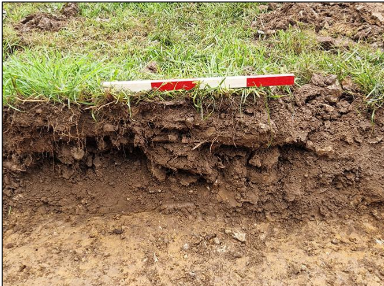
FIGURE 4: SAMPLE SECTION, VIEWED FROM THE NORTH-EAST (SCALE 0.4M).