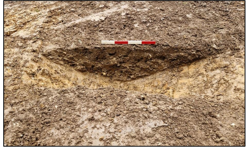
FIGURE 5: SOUTH-EAST FACING SECTION OF DITCH [102], FROM SOUTH-EAST (0.4M SCALE).