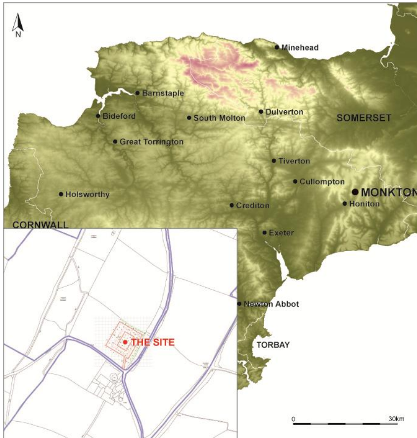
FIGURE 1: SITE PLAN SHOWING LOCATION OF SITE (INSET SUPPLIED BY THE CLIENT)