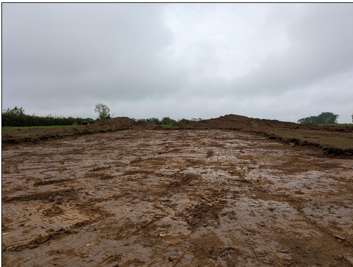
FIGURE 4. THE EXCAVATED AREA, VIEWED FROM THE NORTH-EAST.