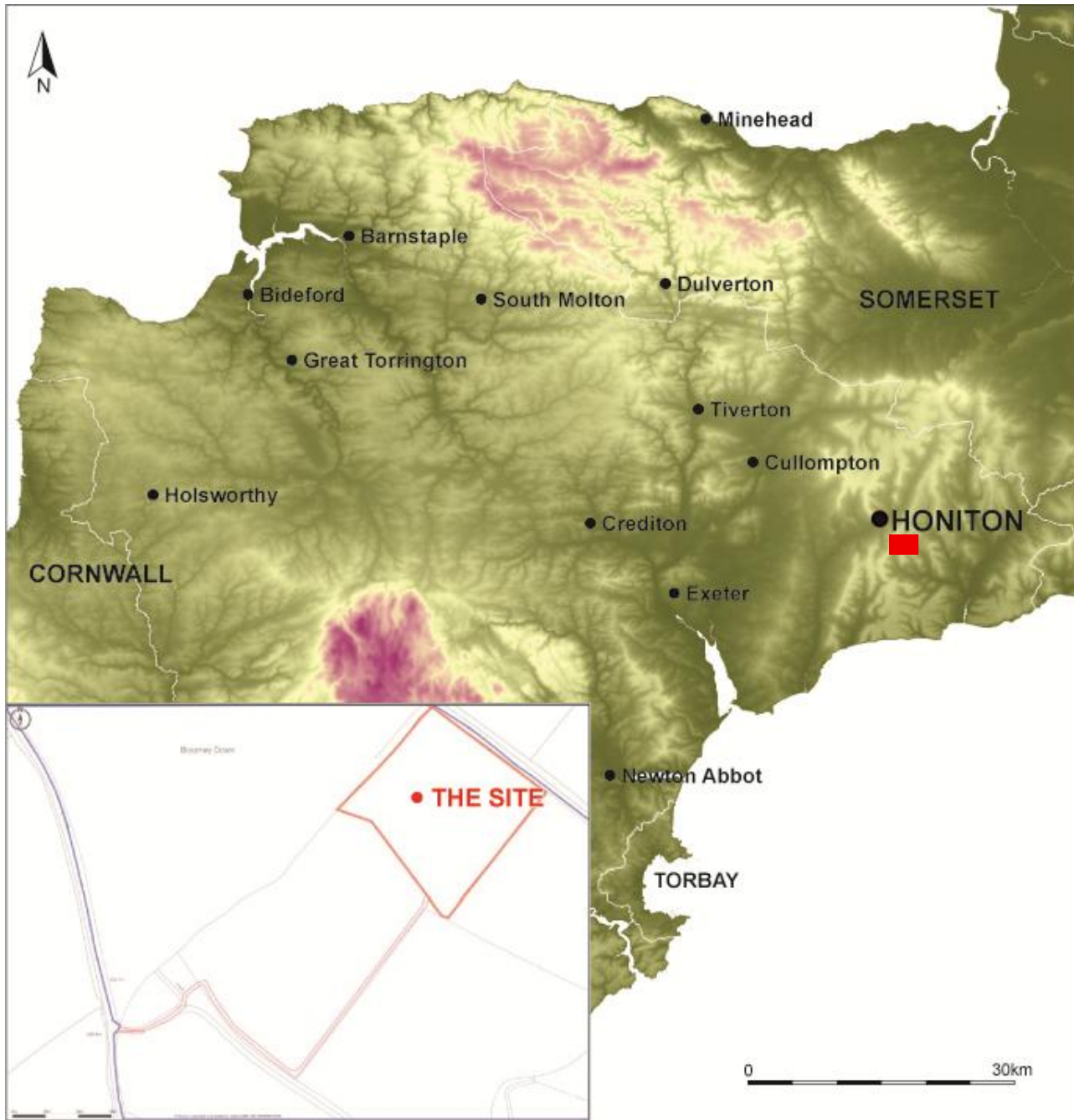
FIGURE 1. LOCATION OF PROJECT AREA REGARDING THE WIDER LANDSCAPE. INSERT TAKEN FROM CLIENT PLANNING ILLUSTRATIONS