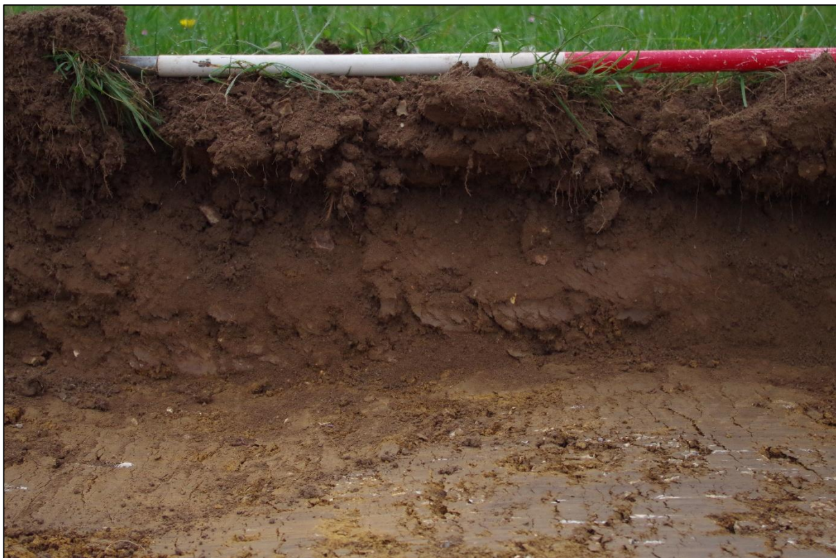
FIGURE 3. SITE STRATIGRAPHY FROM THE NORTH-WEST FACING BAULK (SCALE: 1M HORIZONTAL)