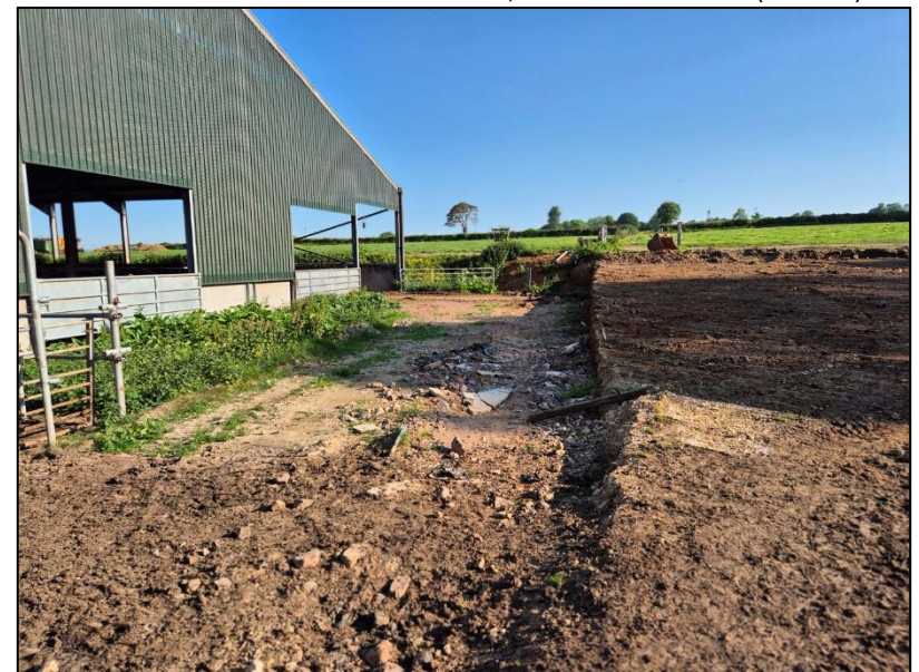
FIGURE 6: EXCAVATION AREA AND TERRACE FOR EXISTING DAIRY, VIEWED FROM THE SOUTH (SCALE 1M).