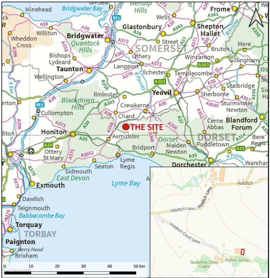
FIGURE 1: LOCATION MAP.