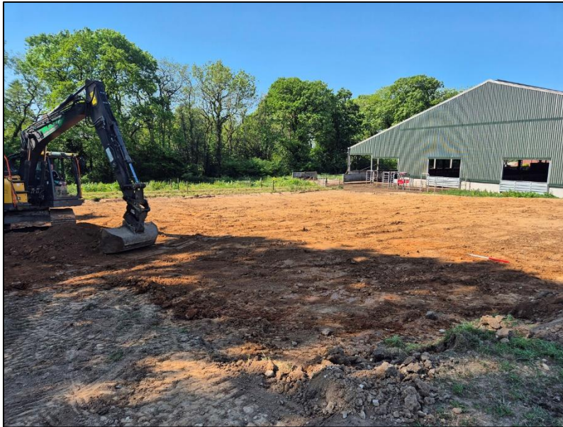
FIGURE 4: EXCAVATION AREA AND EXISTING BARN, VIEWED FROM THE NORTH-EAST (SCALE 1M).