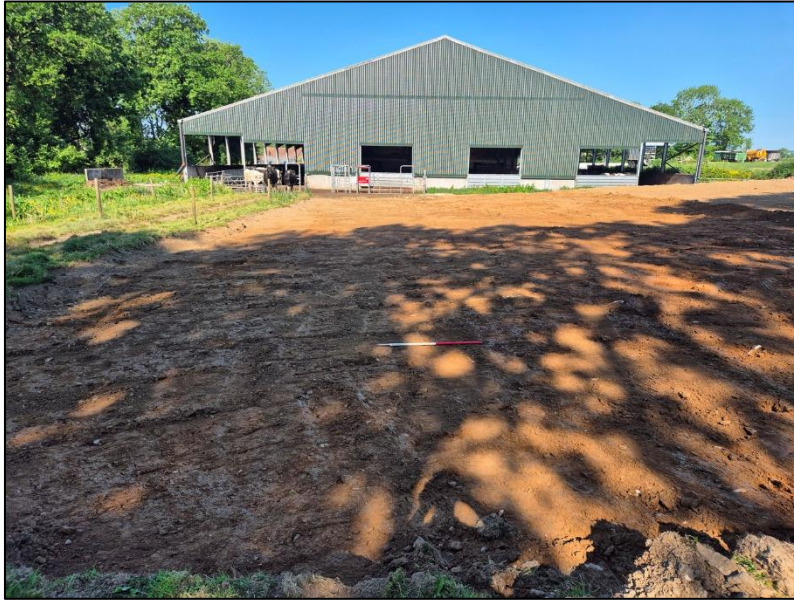
FIGURE 3: EXCAVATION AREA AND EXISTING BARN, VIEWED FROM THE EAST (SCALE 1M).