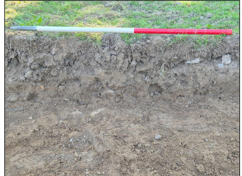
FIGURE 5: SAMPLE OF SECTION AT EDGE OF EXCAVATION, VIEWED FROM THE SOUTH (SCALE 1M).