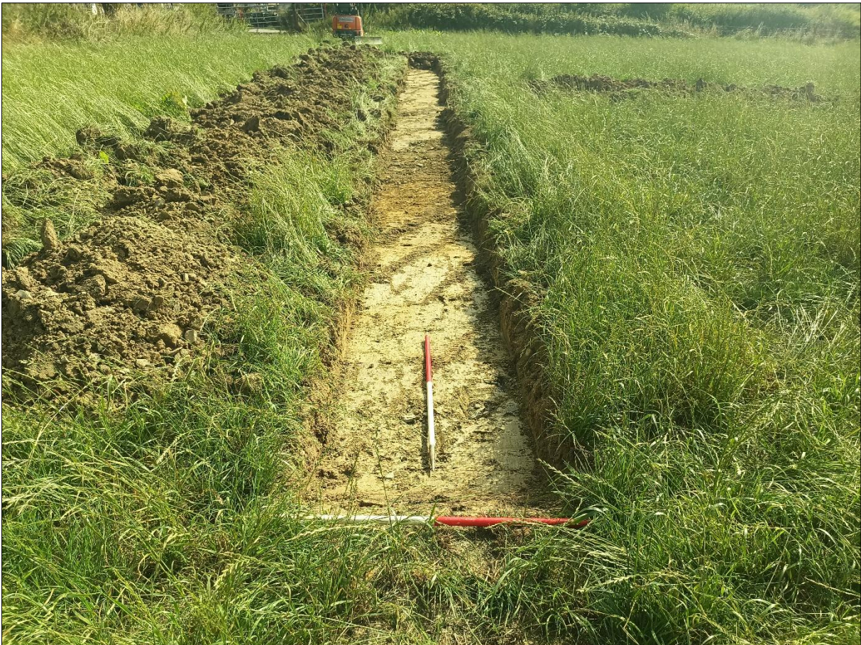
FIGURE 3: EAST-WEST TRENCH POST-EXCAVATION; FROM THE WEST-SOUTH-WEST (1M + 1M SCALE).