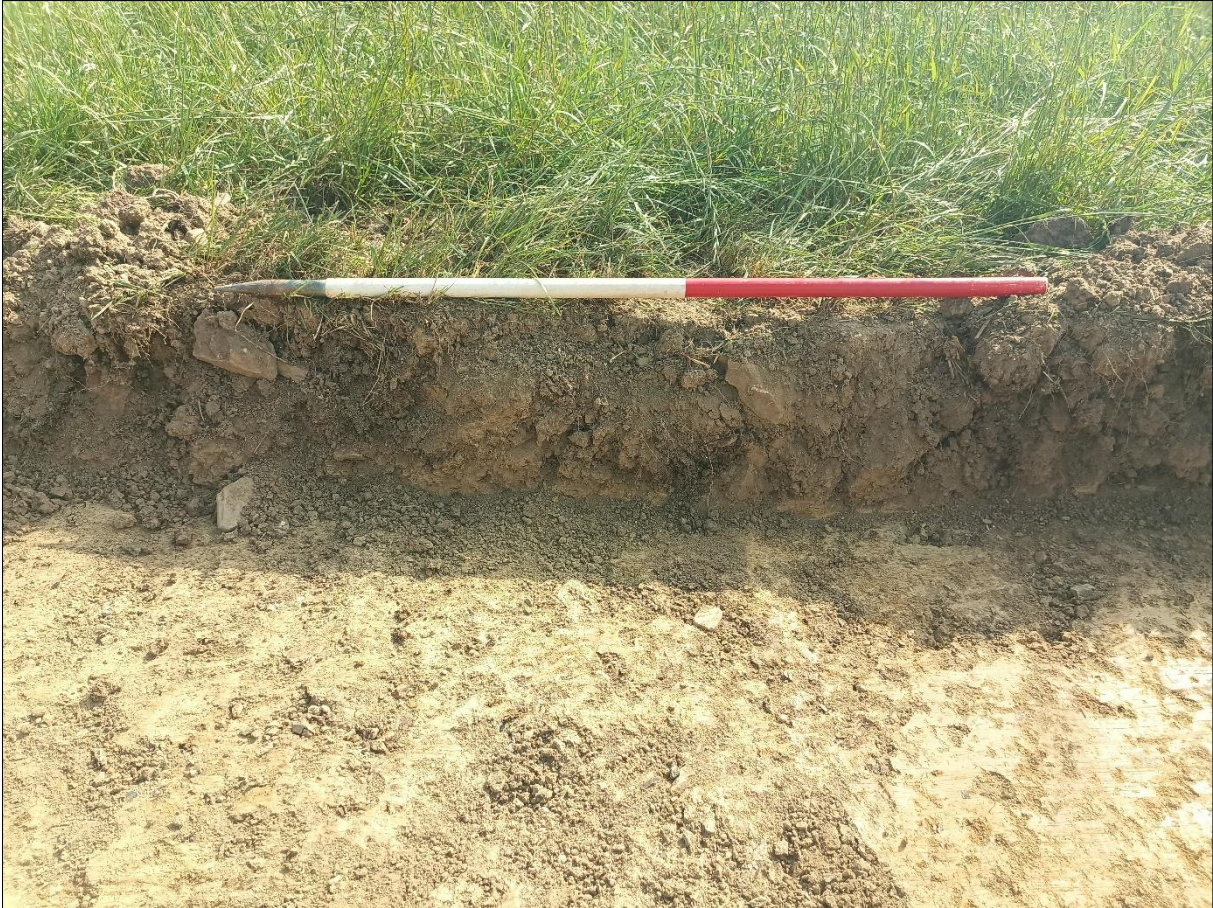
FIGURE 2: WEST-SOUTH-WEST FACING SAMPLE SECTION; FROM THE WEST-SOUTH-WEST (1M SCALE).