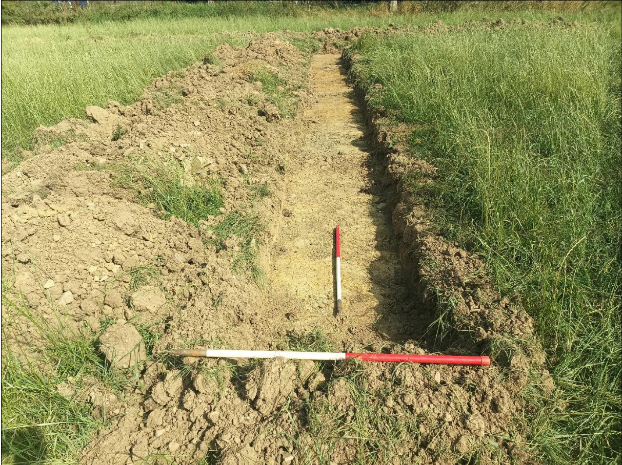
FIGURE 4: NORTH-SOUTH TRENCH POST-EXCAVATION; FROM THE SOUTH-SOUTH-EAST (1M + 1M SCALE).