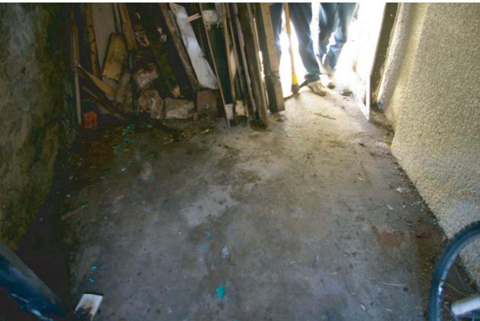
Site of Trench Two, pre-excitation from west