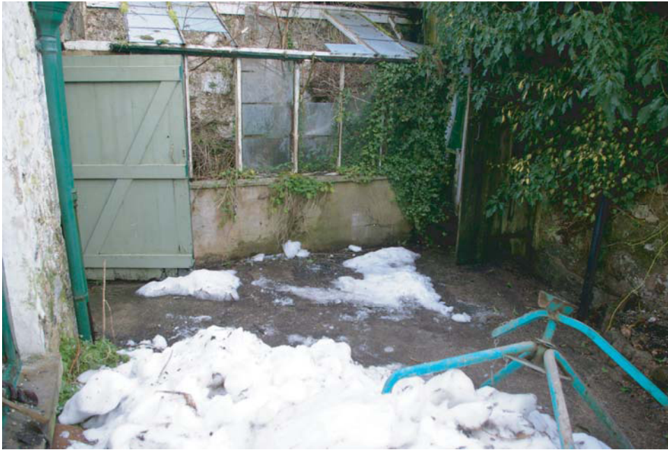
Site of Trench One, pre-excitation from south