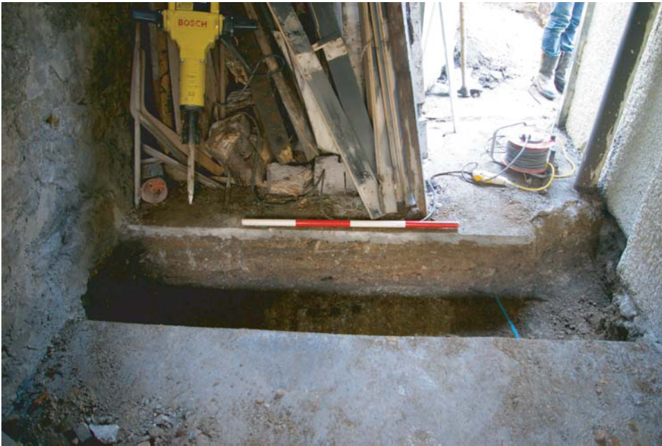
Trench Two, post-excavation from west; 1m scale