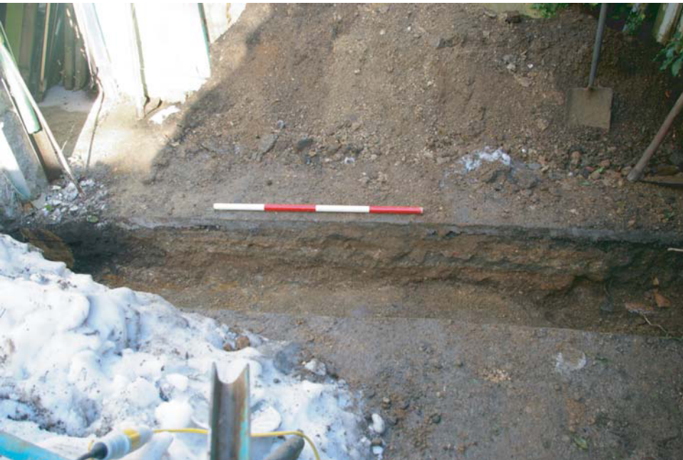
Trench One post-excitation from south; 1m scale