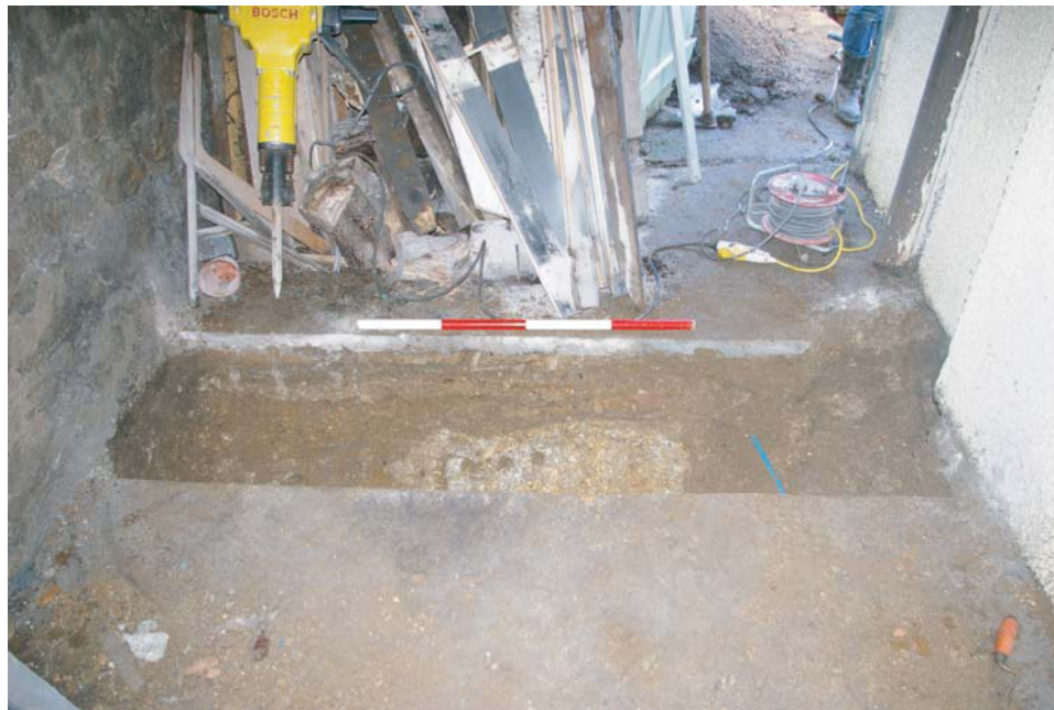
Trench Two post-excavation from west (with flash); 1m scale