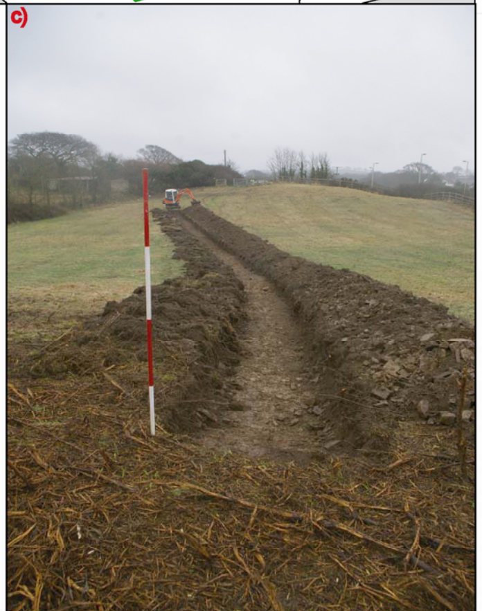
Figure 1: a) Location map. b) Plan of feature [205]. c) Photo of the trench from the north (2m scale).