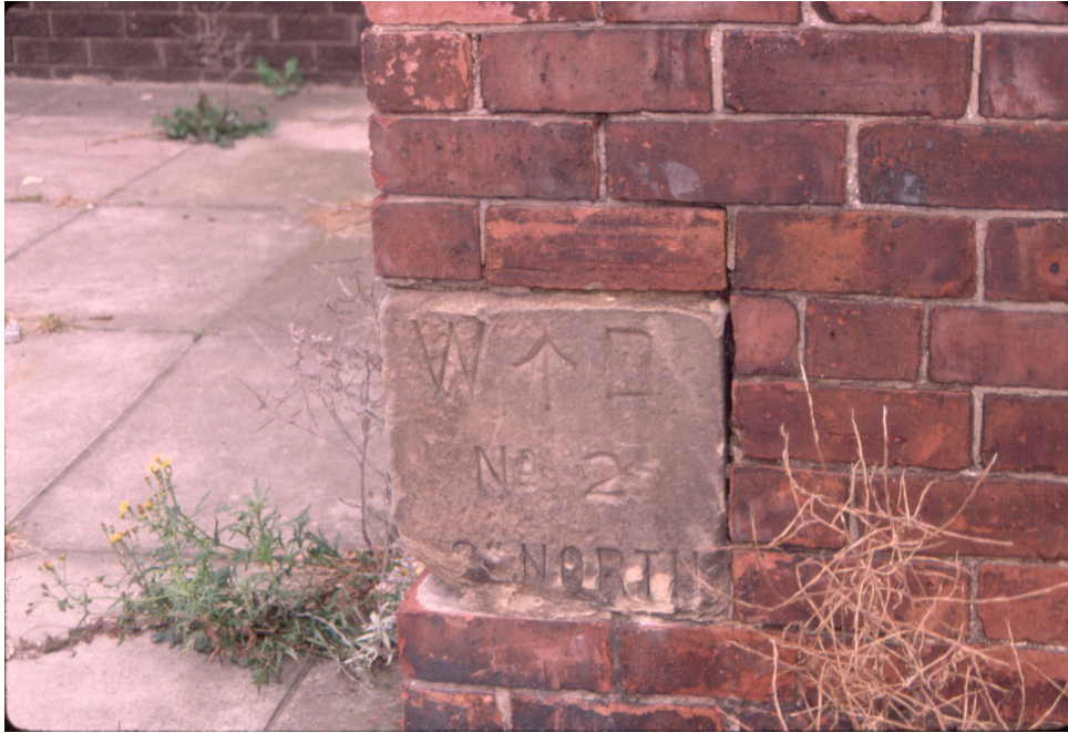
Plate 7: War Department Boundary Stone at Bright Street.

HER 4379. War Department Boundary Stone at Bright Street. Possibly from the turn of the 20 th century. This was presumably one of a series marking a military depot.