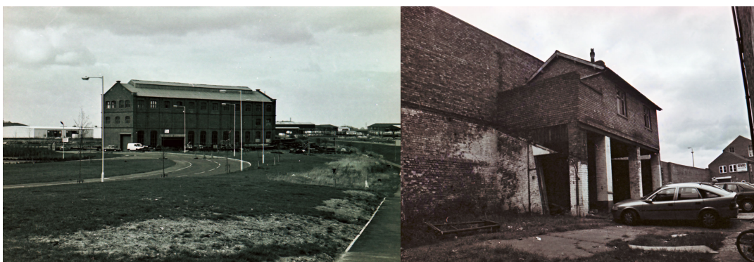
Plate 6: Left – Britannia Steel Test House; Right – Coal Depot, School Croft.

HER 3919. Britannia Steel Testing House, Romaldkirk Road (see Plate 5). Early 20 th century brick building housing testing machinery used on steel sections for the Sydney Harbour Bridge.