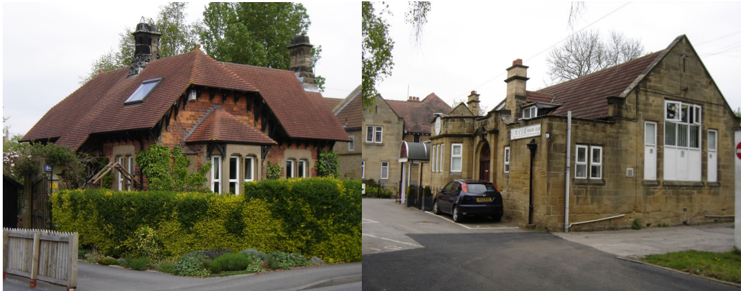
Plate 9: Left – 84 Gunnergate Lane; Right – The Old School, Nunthorpe

HER 3900. Nunthorpe Train Station, Guisborough Road. An original building contemporary with the Middlesbrough to Guisborough line of 1853.