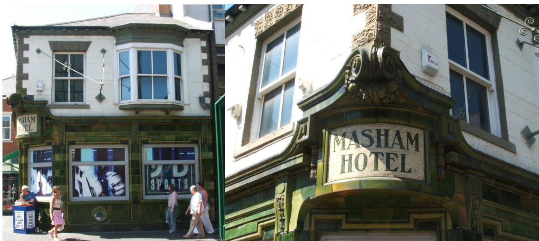
Plate 2: Left – shoppers pass by the Masham Hotel (now JD Sports) on Linthorpe Road; Right – Mosaic and tile detail above entrance.

A compact Sony DSC 5.1 megapixel digital camera was used for the photographic recording. Photographic index sheets were maintained for each area and are reproduced as Appendix 1. The full photographic archive is included on the CD-ROM (Appendix 2) which accompanies this report.