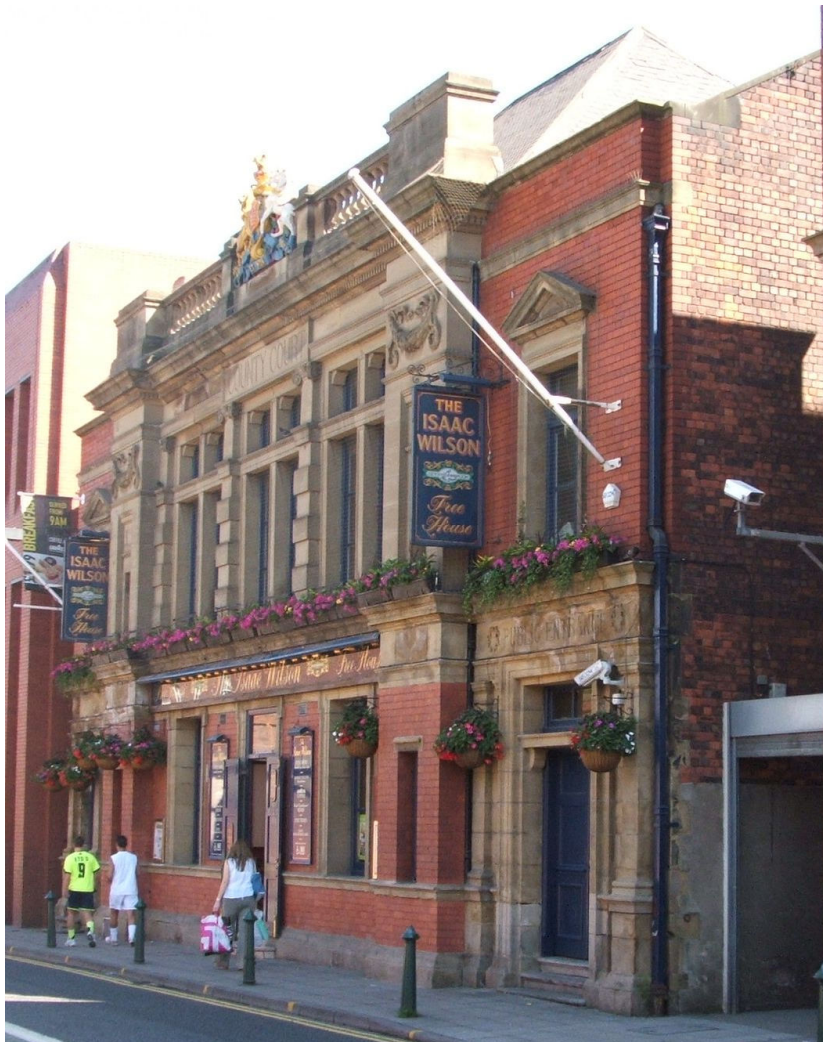
Plate 4: The Isaac Wilson, Wilson Street

Sir Isaac Wilson Public House, Wilson Street (see Plate 4). Former County Court building and next door to Listed Grade II 'Showboat Social Club' (LBS no. 59811). It is presumed that this had Crown exemption at the time of the 1988 resurvey and was not listed for that reason. It has been in use as a Public House since 1991.