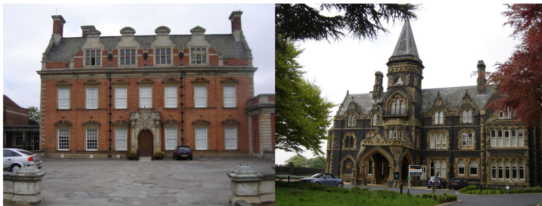
Plate 1: Left – Acklam Hall, Middlesbrough's only Grade I listed building; Right – Grey Towers, Nunthorpe, recently upgraded to Grade II*.

In the early 1990s all Grade I and II* Listed Buildings were added to the SMR. However the majority of listings (at least 90%), mainly at Grade II, were not. The SMR continued to focus on documenting archaeological sites and finds and creating new archaeological datasets to assist in conservation and development control. The Grade II listings missing from the SMR represent domestic residences, commercial properties, schools, memorials and even telephone boxes and mainly date from the late 19 th century or the 20 th century and archaeologically speaking had a low priority for inclusion on the record.