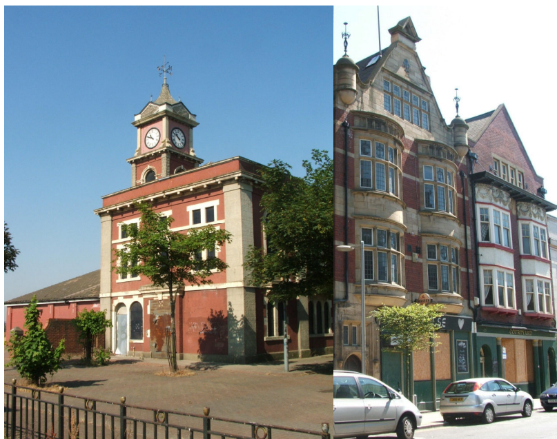
Plate 3: Left – The Old Town Hall and Clock Tower; Right – 34 & 38-40 Albert Road.

38-40 Albert Road, Middlesbrough (LBS no. 59680)