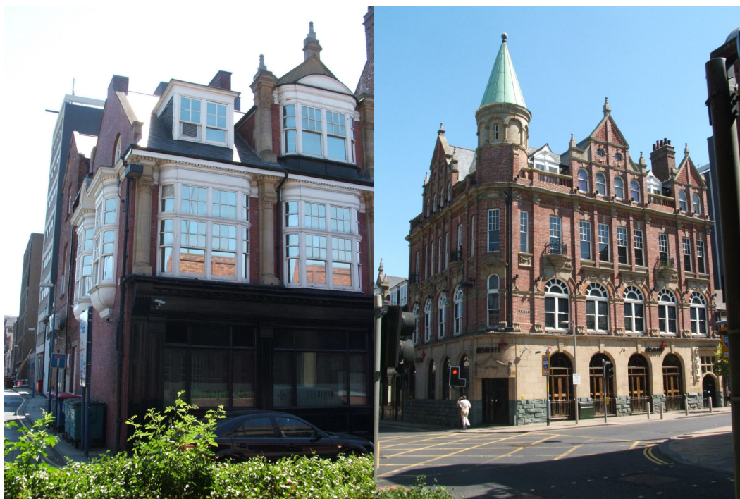
Plate 5: Left - Lloyds Bank Chambers; Right - 2-4 Albert Road, Middlesbrough (the eastern end of Lloyds Bank Chambers can just be seen at the left of the picture).

The principal sources of information consulted during the survey were the Greenback document (DoE, 1988) and Listed Buildings online (English Heritage, 2006-07). In both cases the listing description for Lloyds Bank Chambers, 2 Albert Road is ambiguous. The description details the two storey building with dormers fronting Wilson Street (see Plate 4 – left). However the adjoining 2-4 Albert Road (see Plate 4 - right) is not covered by the description and may even be excluded as a 'Former bank premises... not of special interest' (DoE, 1988, p. 3). Approaches have been made to the Regional English Heritage Team at Newcastle and the National Monuments Record who believe the complete block to be listed but the description is open to interpretation. The listing should be reviewed to confirm the situation. For the purposes of the HER the building is presumed to be listed.