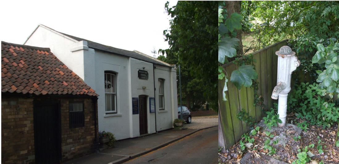
Plate 8: Left – Stainton Methodist Chapel; Right – Thornton Water Pump

HER 6070. Stainton Methodist Chapel, Meldyke Lane (see Plate 6) – Built in 1840. An example of a local non-conformist facility still in use for worship.