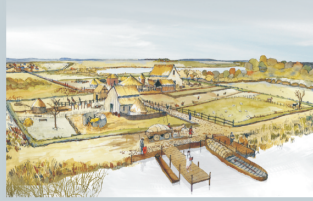
Reconstructions Of The Earth and Needingworth Sites