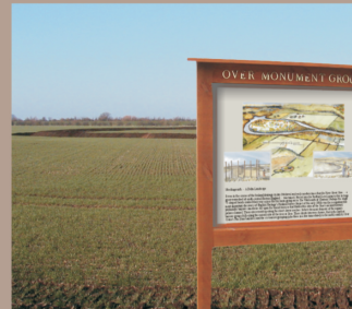
The Over Monuments Group

Finally, there is the Over Monuments Group at Hanson's Needingworth Quarry at which visitors are welcome. In addition to the restoration of the largest man-made wetland bird reserve in Europe, a 'monument park' has been established in order to ensure the preservation of an important group of upstanding Bronze Age barrow mounds. The circle of a great settlement enclosure of the period has also been restored. Together, these form one of the most impressive prehistoric monument settings in Southeast England.