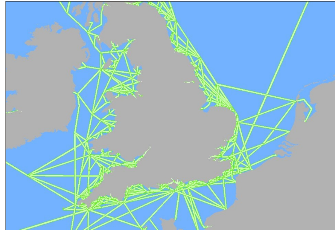
B: 5-Kilometre buffers were then placed around the route lines, which are used to hypothesise the traffic path in a particular sailing direction.