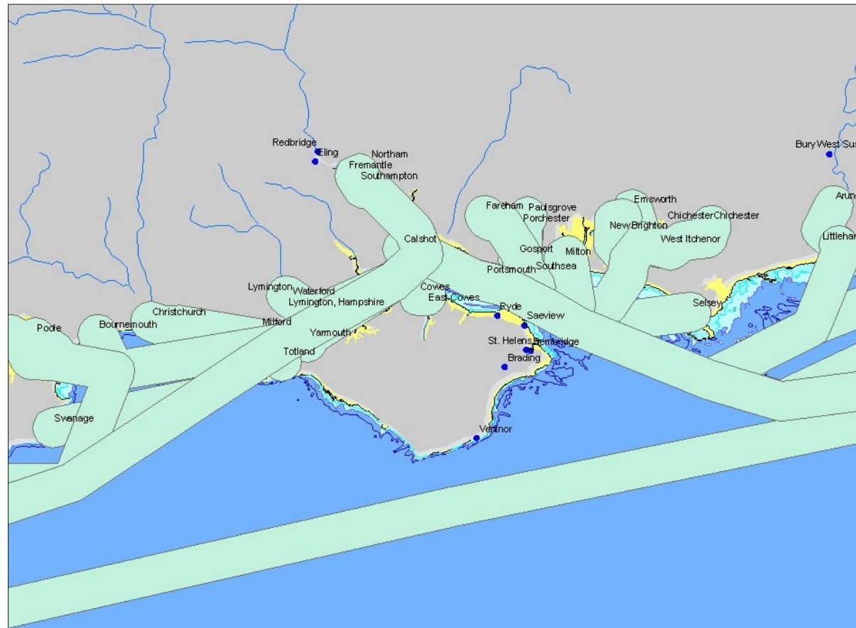
C: All of the routes produced as part of step 2 were then amalgamated into one layer made up of several individual routes.