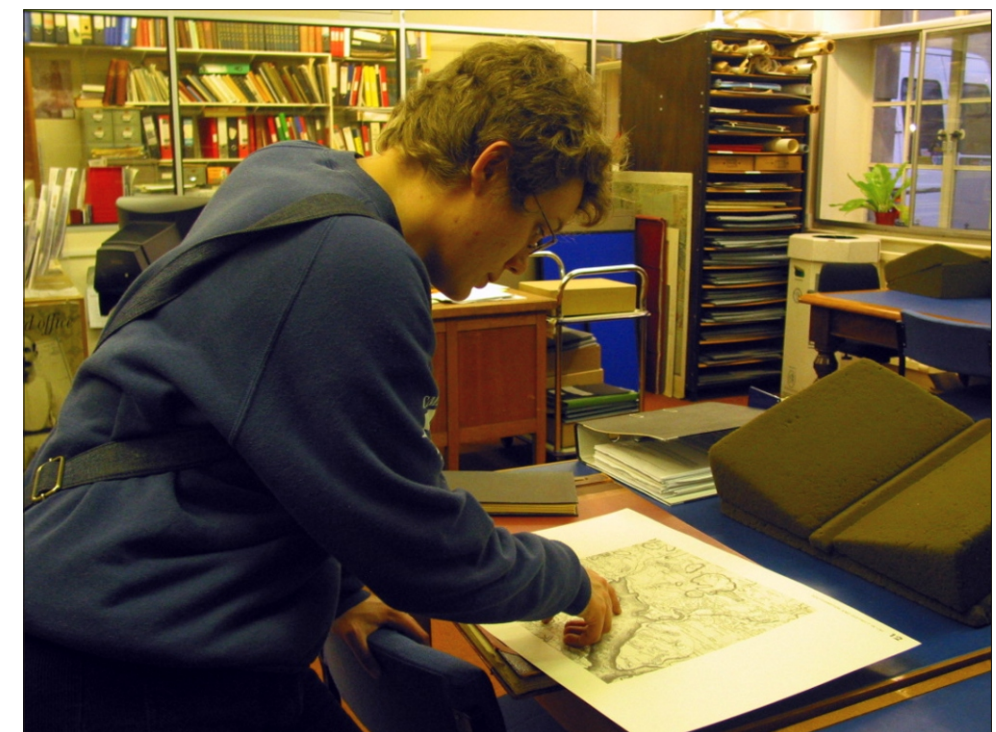
C: Wessex Archaeology staff assessing historical charts to determine historical anchorage locations which can then be compared to modern anchorages.