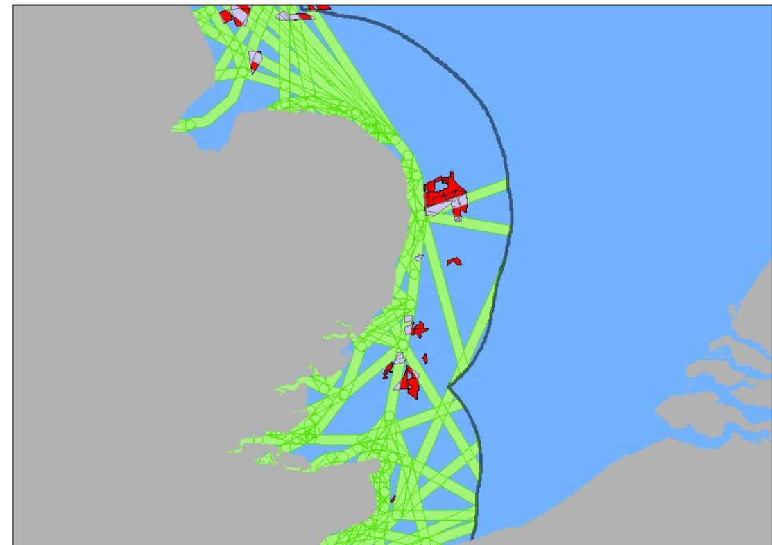
D: The location of dredging areas in relation to the route network for the East Coast of England.