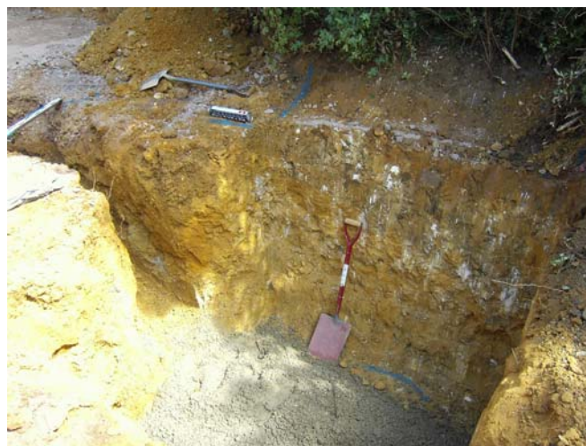
The natural soil profile observed in the pit

A single visit was made to the site on the 12 th July 2005. It was observed that c.250mm of topsoil had been removed from the line of the drainage run exposing clean undisturbed yellow clay. Towards the NE corner of the site a length of drainage run and a 1.8m sq pit were examined during the visit. These cuts clearly demonstrated that the exposed clay was the natural subsoil of the area. The spoil heaps were also scanned for finds, but no evidence for previous occupation/ activity on the site was observed.